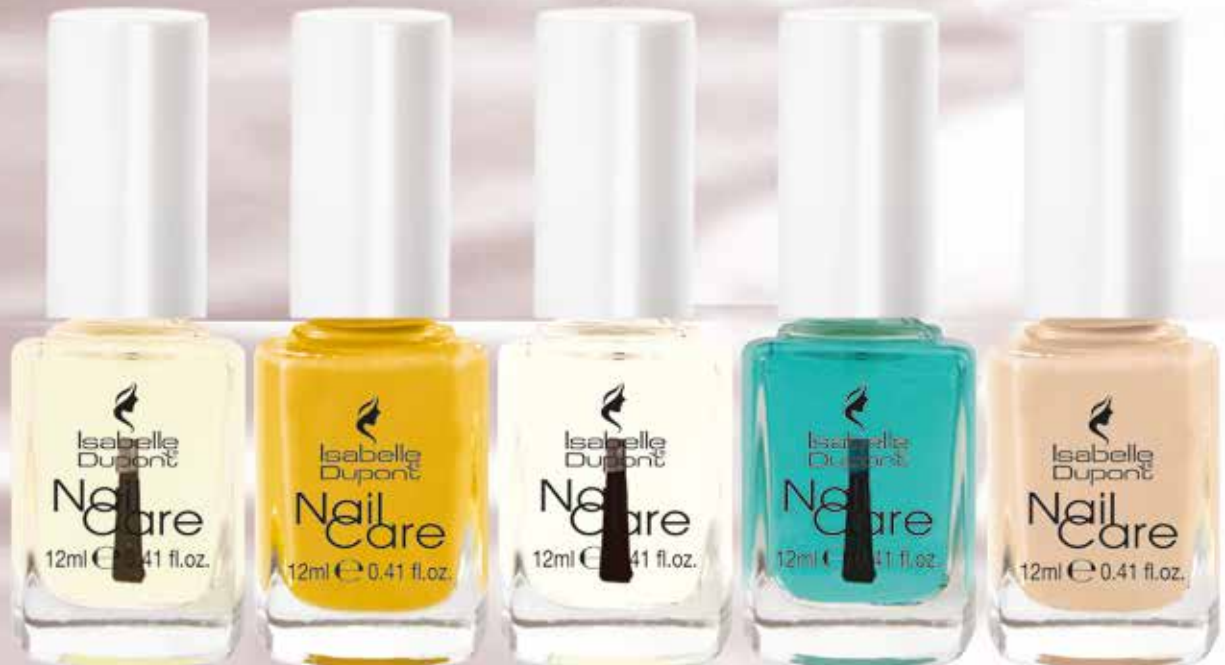
WATER BASED CUTICLE REMOVER GEL