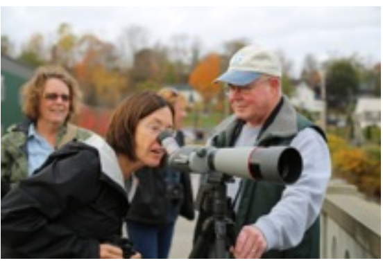
Solstice Celebration at Head of Tide Preserve

85 Doak Road, Belfast Friday, December 21 at 3:00 Hot cider and cookies Solstice tree decorating for the animals You are invited to bring something to read or sing