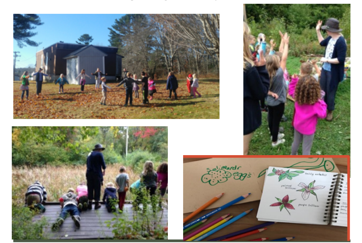
Belfast Bay Watershed Coalition www.belfastbaywatershed.org

In the first 6 weeks, the Natural Literacy program has served 298 students for 877 student-contact hours, with help from eight community volunteers.