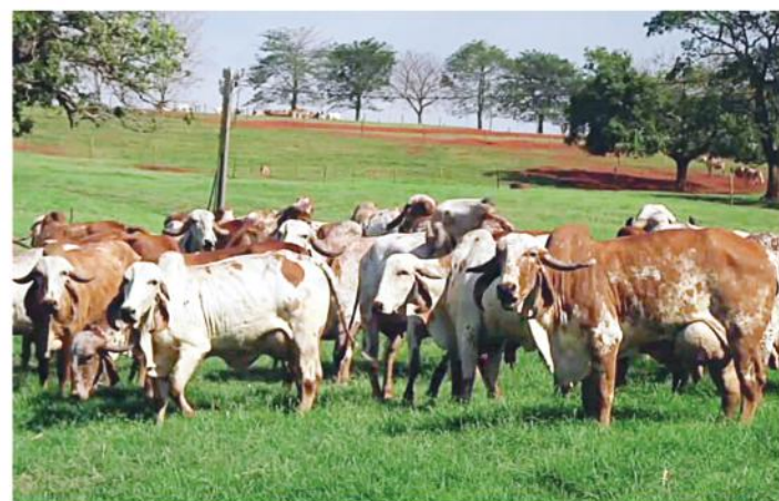
AAT News Service

THE Union Cabinet chaired by Prime Minister Narendra Modi was apprised of Memorandum of Understanding (MoU) signed between India and Brazil for co-operation in the fields of zebu cattle genomics and assisted reproductive technologies (ARTs). The MoU was signed in October 2016. The MoU will strengthen the existing friendly relations between India and Brazil and promote development of genomics and ARTs in cattle through joint activities to be implemented through mutually-agreed procedures.