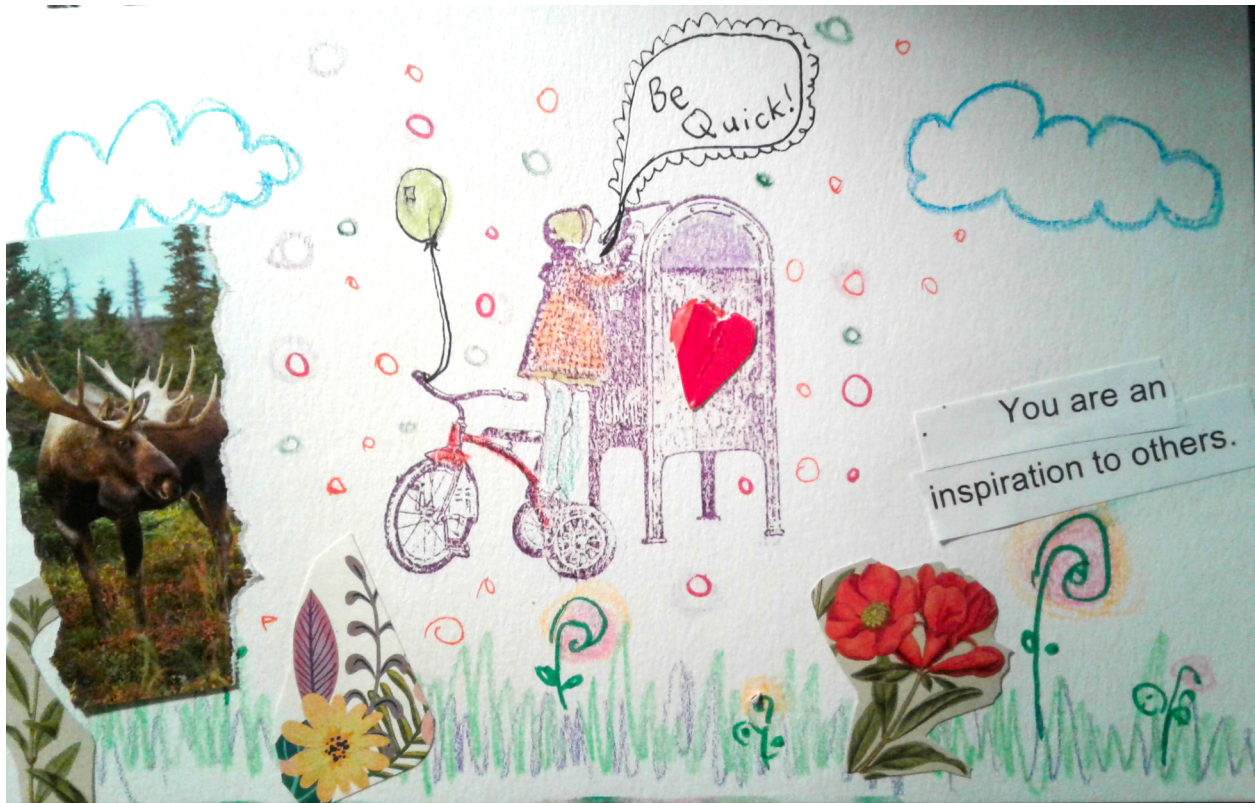
Collage by Ahna