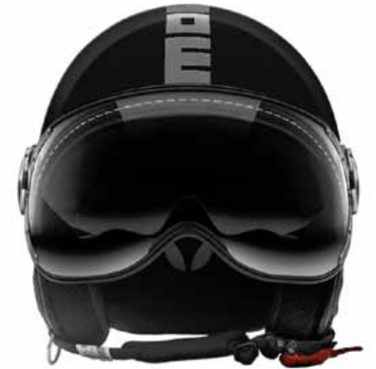
BLACK MET GLOSSY - CHROME LOGO 1001002035