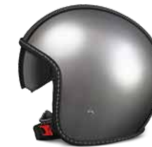
GLOSS METAL ANTHRACITE - BLACK DECAL 1011001004