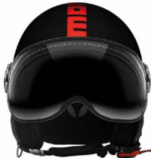
BLACK MATT - RED FLUO DECAL 1001004024