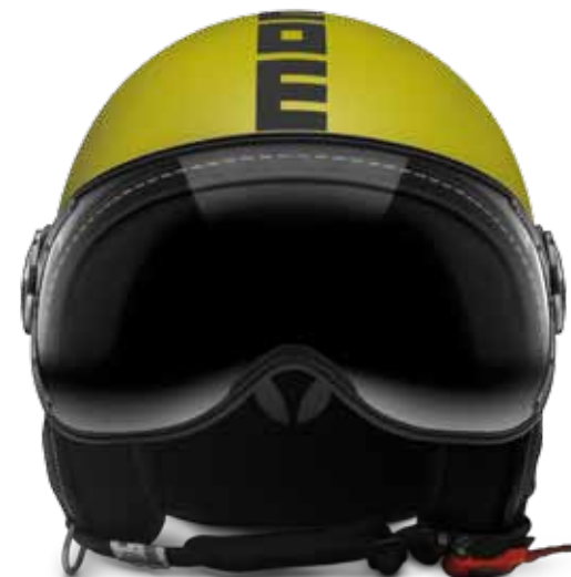
YELLOW MATT - ANTHRACITE DECAL 1001003037