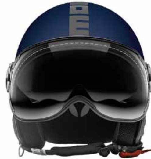
BLUE MATT - SILVER DECAL 1001003038