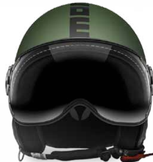
MILITARY GREEN MATT - BLACK DECAL 1001002026