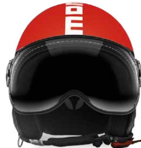
RED MATT - WHITE DECAL 1001002024