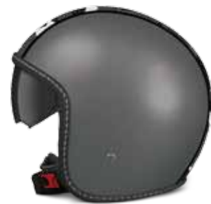
TITANIUM FROST - CAMOUFLAGE 1011002004