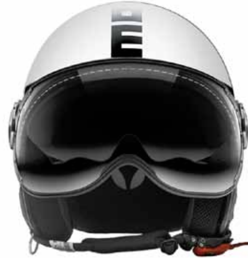
SAGE FROST- CAMOUFLAGE DECAL 1001003035