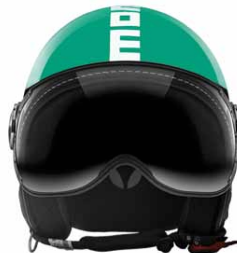
AQUAMARINE GLOSSY - WHITE DECAL 1001002031