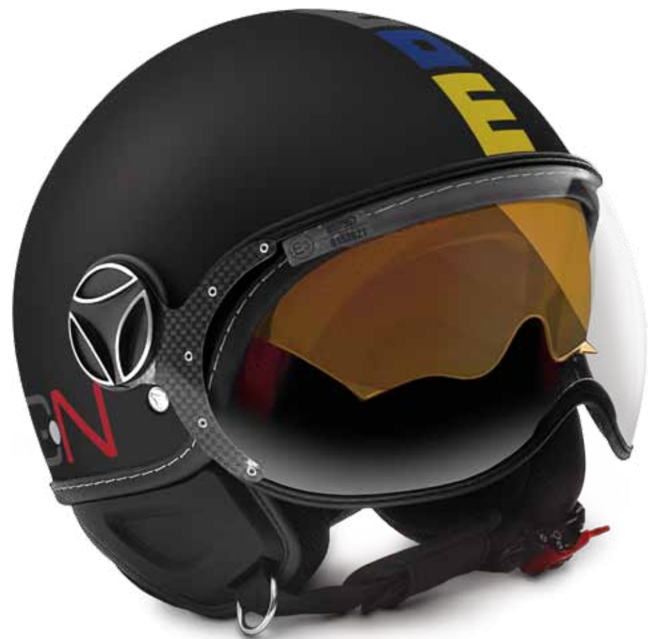
LIMITED EDITION BLACK FROST - MULTICOLOR DECAL 1001006000