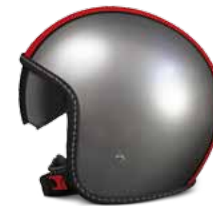
GLOSS METAL RED - BLACK DECAL 1011001002