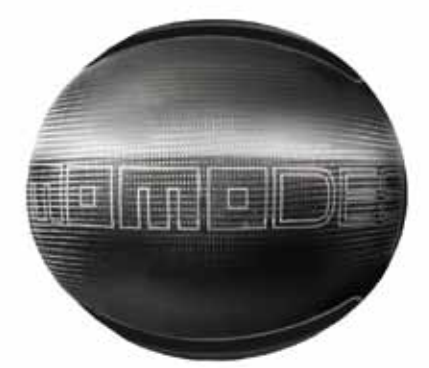
MILITARY GREEN MATT - WHITE OUTLINE DECAL 101400001