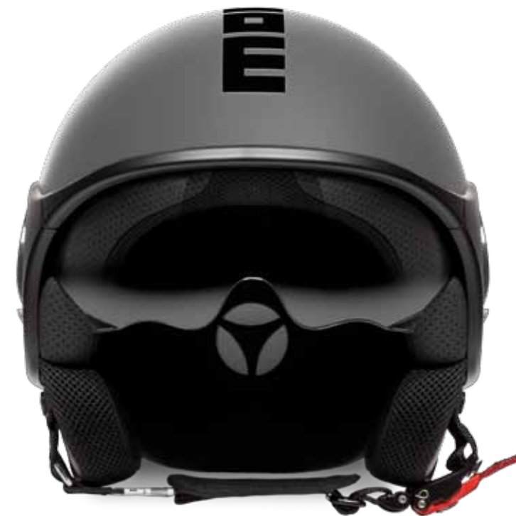
ALLUMINIUM FROST - BLACK DECAL 1002003004