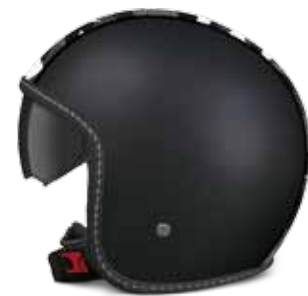
BLACK FROST - CAMOUFLAGE 1011002003