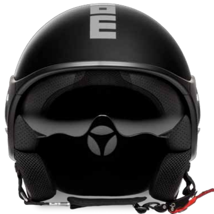
BLACK MATT- SILVER DECAL 1002003005