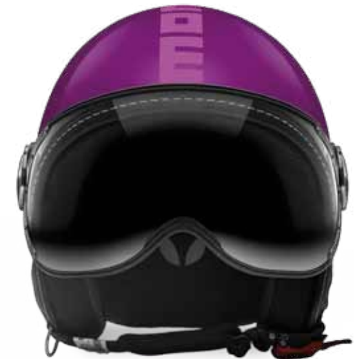
VIOLET MATT - PINK DECAL 1001002033