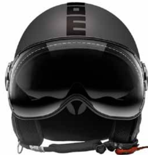
TITANIUM FROST- BLACK DECAL 1001003029