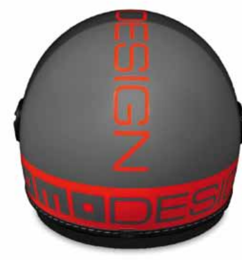
GLOSSY GREY - ORANGE FLUO DECAL 1001004027