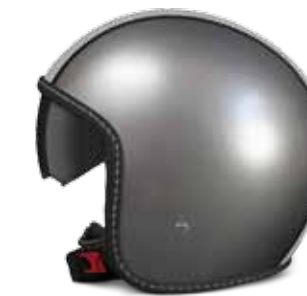
GLOSS METAL WHITE - BLACK DECAL 1011001001