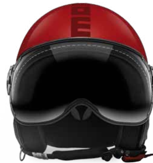
RED GLOSSY - BORDEAUX DECAL 1001002034