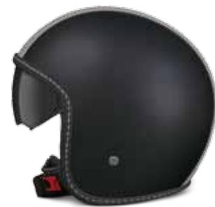
BLACK FROST SATIN - BLACK DECAL 1011002000