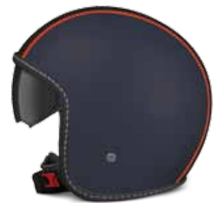
GREY MATT - RED FLUO 1011002002