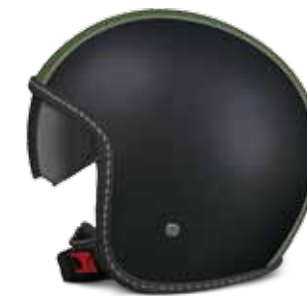
BLACK FROST - MILITARY GREEN SILVER DECAL 1011002001