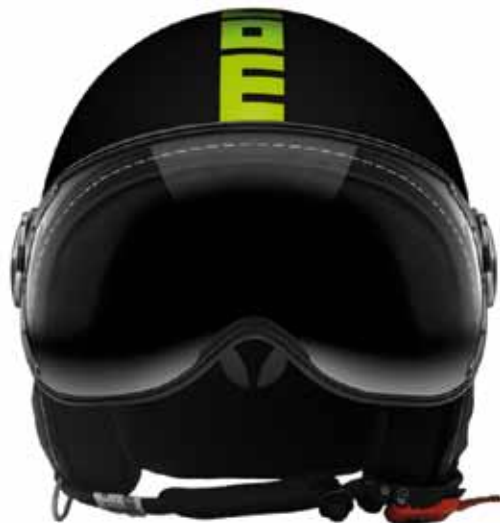
BLACK MATT - YELLOW FLUO DECAL 1001004023