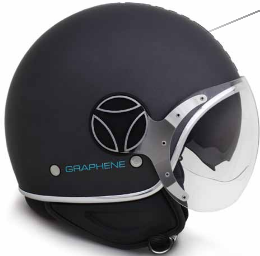
GRAPHENE - CHROME DECAL 1001005000

STRENGTH - Graphene distributes the impact force of the collision better than any other material. This allowed us to produce a more durable helmet, improving the safety.