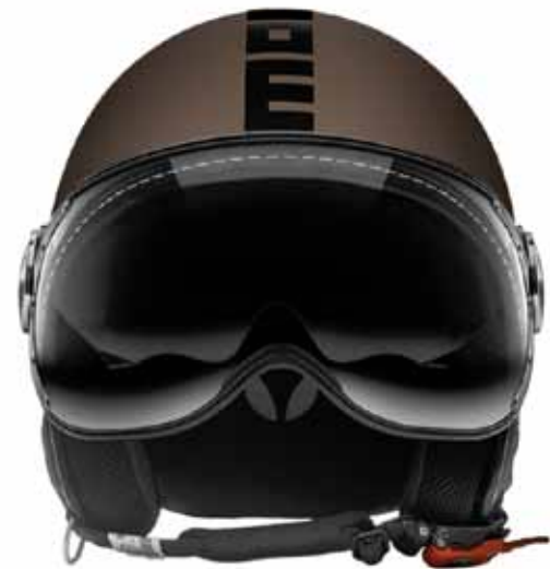
TOBACCO FROST - BLACK DECAL 1001003030