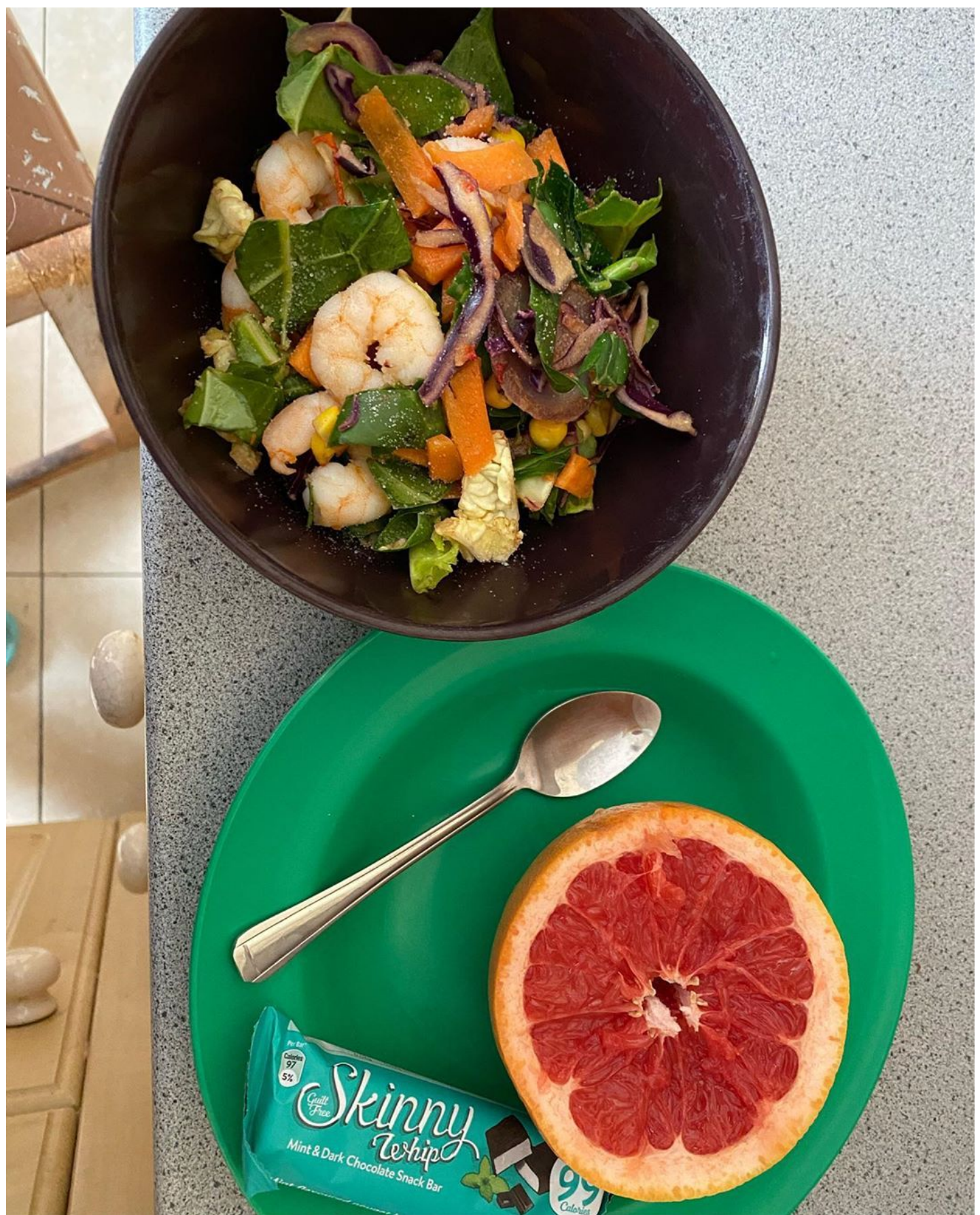
losefat# losingfat# losingweightjourney# looseweight# loosefat# bodybuild# nutritiontips# cardio# weightstraining# gettingstronger# coffee# flexibledieting