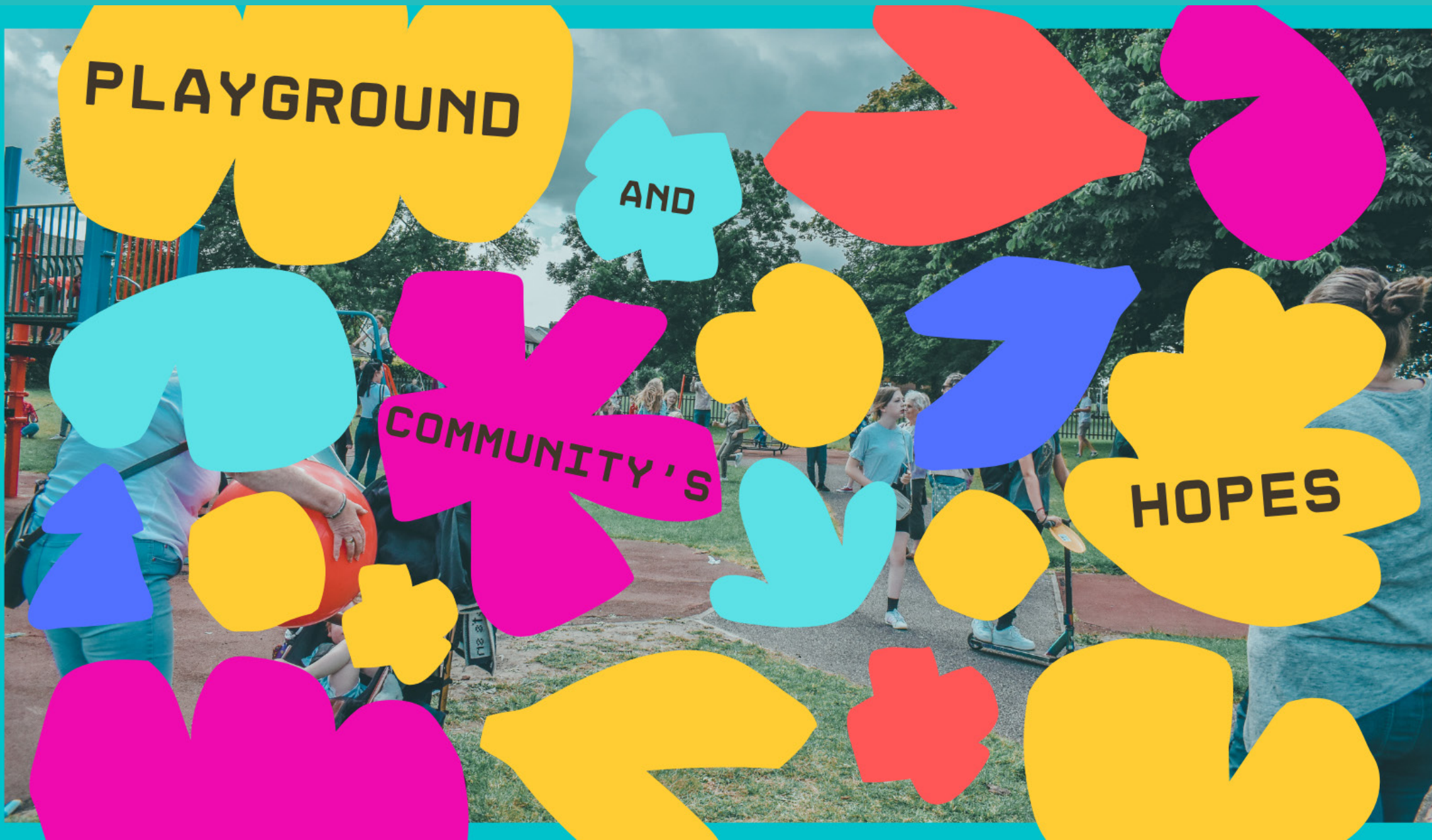
A collection of ideas by Adwick & Carcroft residents from Arty Party in the Park