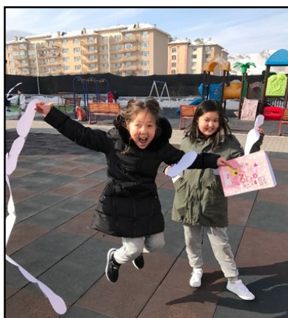
Grade 4B students practicing measurement on the playground.

maica as part of their participation in International Day.