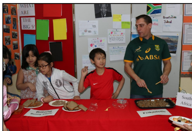
Grade 4C students answer questions about South Africa at their International Day booth.