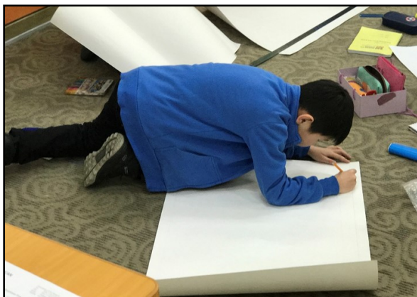
Grade 4B students work on research projects about ancient Greece. The project involved some traditional skills as well as use of technology.