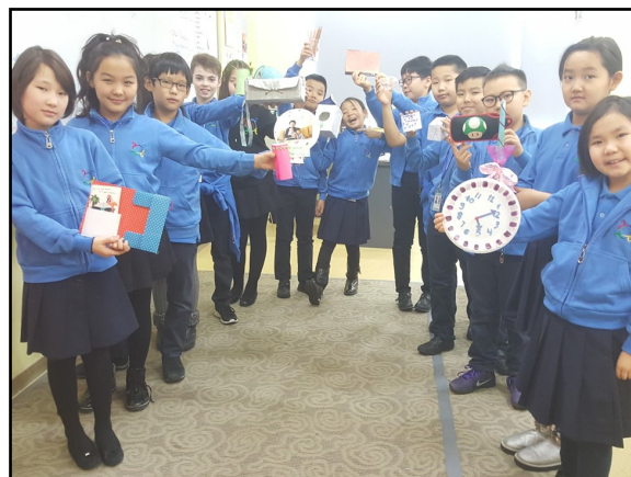
(Left) Grade 4A students proudly displaying their various pieces depicting aspects of Ancient Greece. (Above) Students showing off their creative pieces as a part of a Science project on Repurposing.