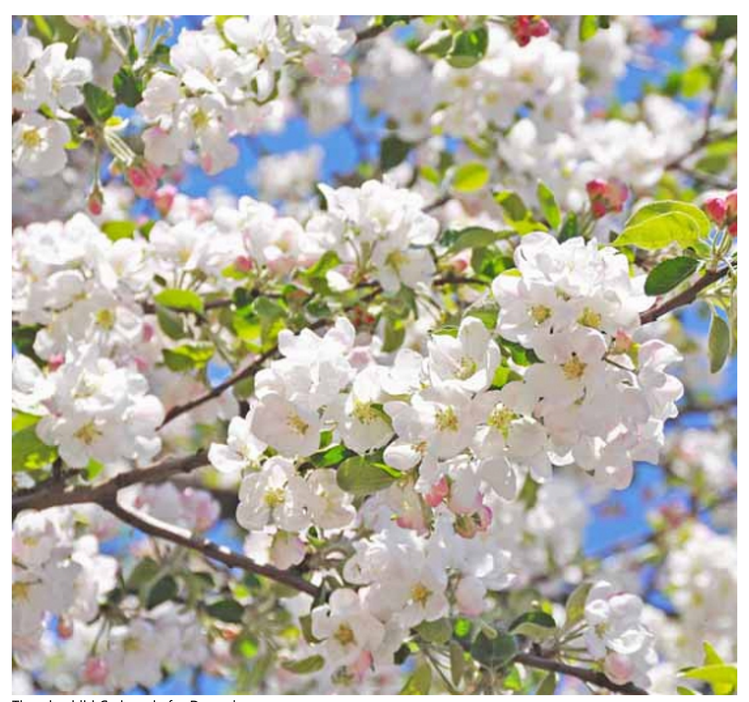
Thunderchild Crabapple for Dummies

For the first handful of years, <a href="https://www.washingtonpost.com/newssearch/?query=organic gardening">https://www.washingtonpost.com/newssearch/?query=organic gardening</a> see to it your freshly planted complainer apple plant is actually properly watered in dry durations. Constantly provide a compost of well-rotted manure or garden compost in spring season and also trim in late winter to clear away any sort of lifeless, perishing, unhealthy or crossing limbs. It's achievable to propagate crab apple trees by taking softwood cuttings in overdue spring season or early summer season.