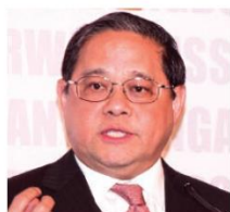
Victor Fung , Honourary Chairman, International Chamber of Commerce