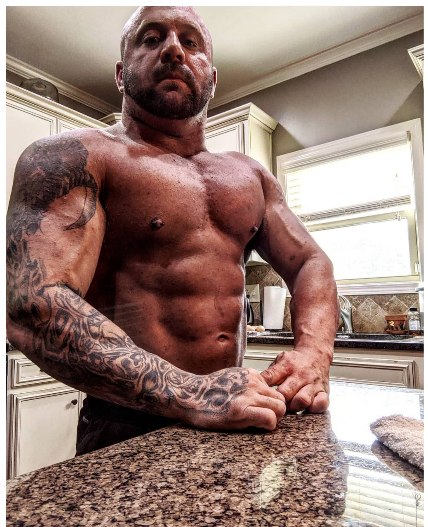
For my friends and family they know I say this all the time but I absolutely love my job. Working as a personal trainer is the best thing I ever did. Not only is the job fun but you meet such amazing people, you can help and change life's by doing what you enjoy- how can you want more!!

https://cdn.shopify.com/s/files/1/0494/5621/8263/files/Anapolon_Balkan_Pret-html.pdf