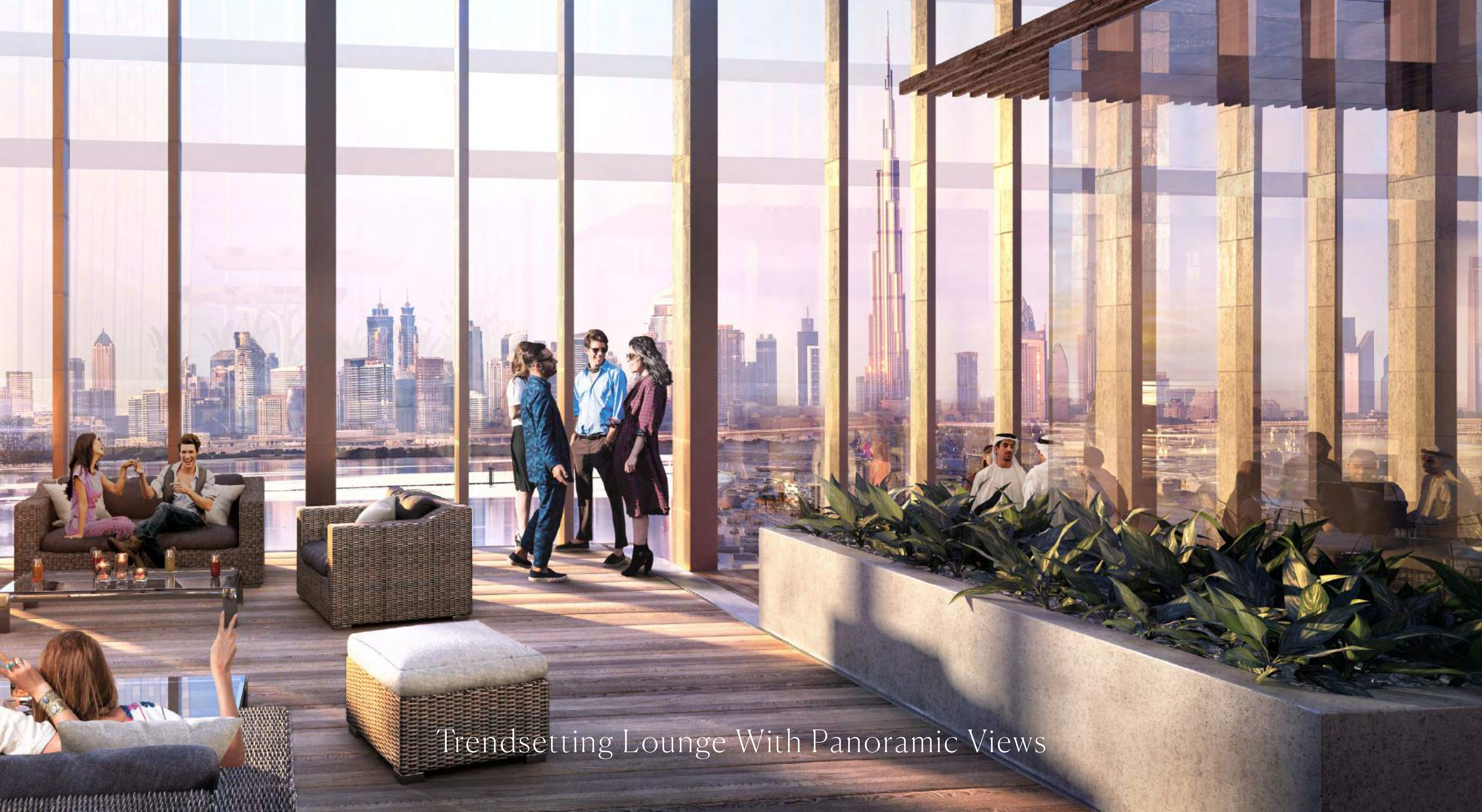
Trendsetting Lounge With Panoramic Views