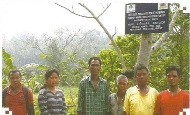
Training on health awareness at Garagre