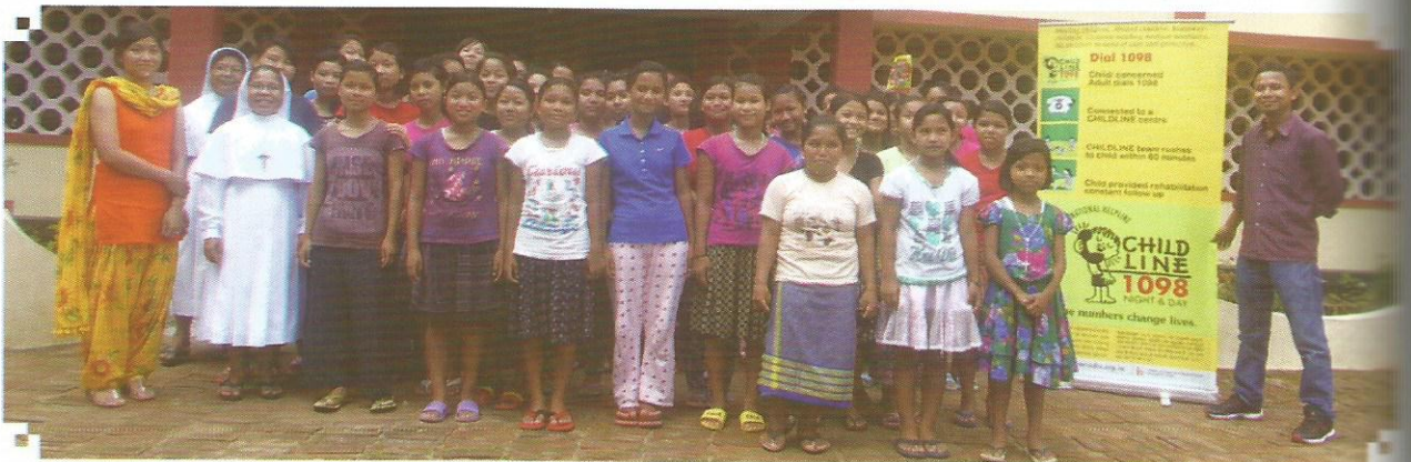
St. Mary's School