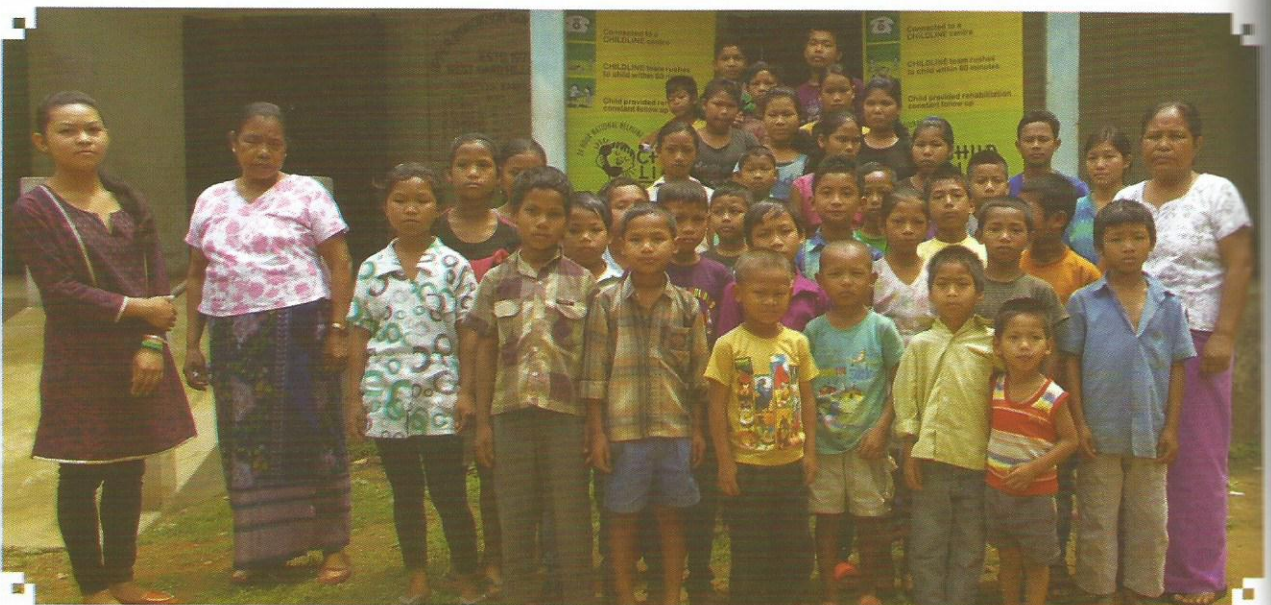
Upper Rongkhon L.P School