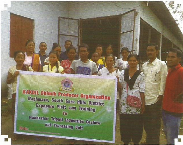
Baghmara PO-Exposure Visit to Cashew nut processing unit