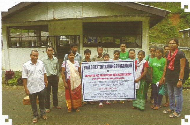
Exposure visit to Gindo pigery farm