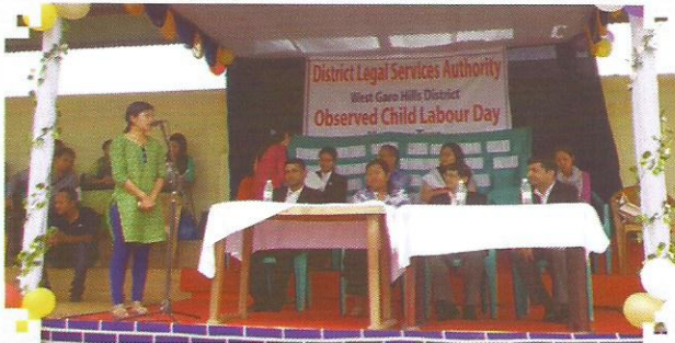
Anti Child Labour Day