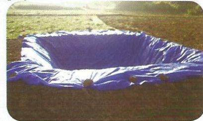
Rain water harvesting