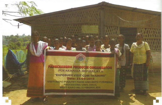
Purakhasia PO-Exposure visit to poultry farm