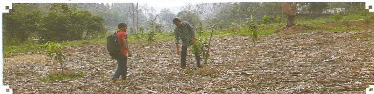
Inter cropping of Turmeric in the mango wadi