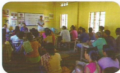
Health awareness training at Garagre