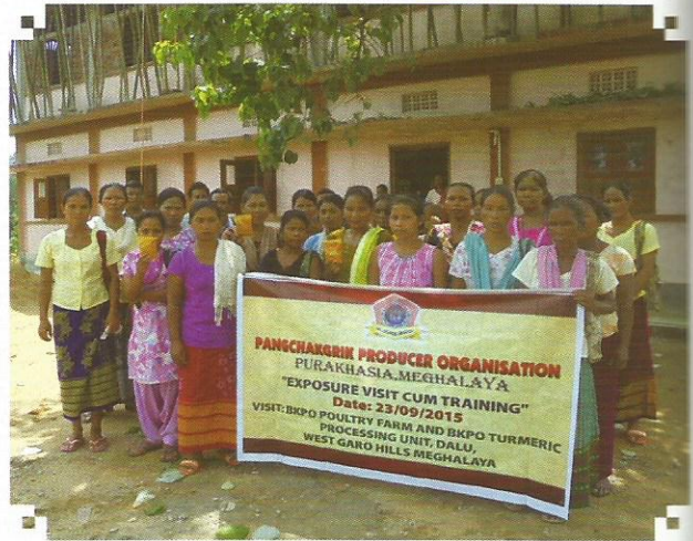
Purakhasia PO-Exposure visit to Turmeric Processing Unit