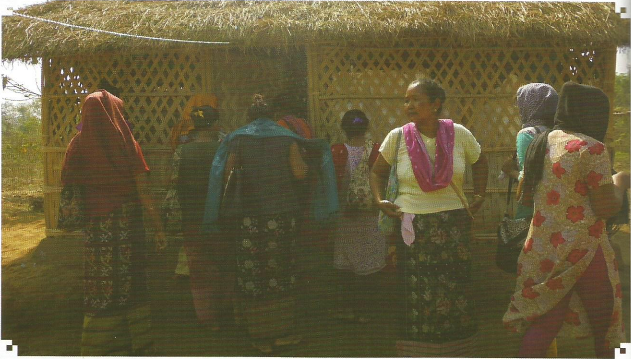
Exposure visit to individual poultry farmers

C) FARM (Three years report in additional attachment)