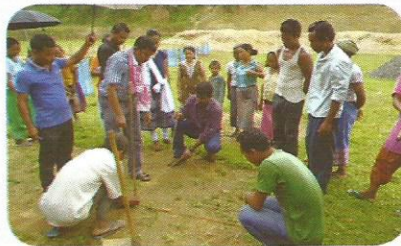
Demonstration on Scientific method of plantation