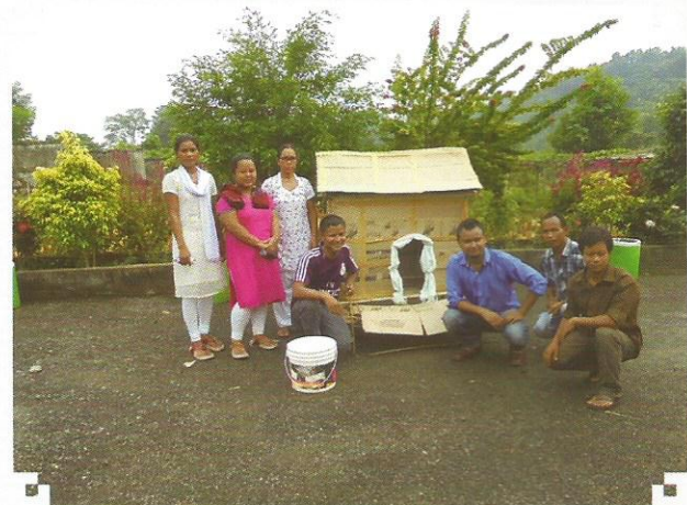
Learning through games- Leadership Training at BTC