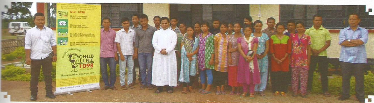
Community awareness at Babadam