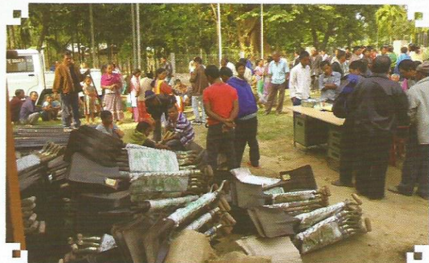
Distribution of tools to the farmers at Zikzak