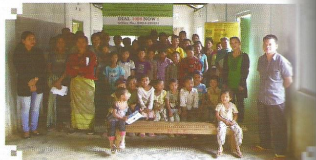
Marenggre Community awareness