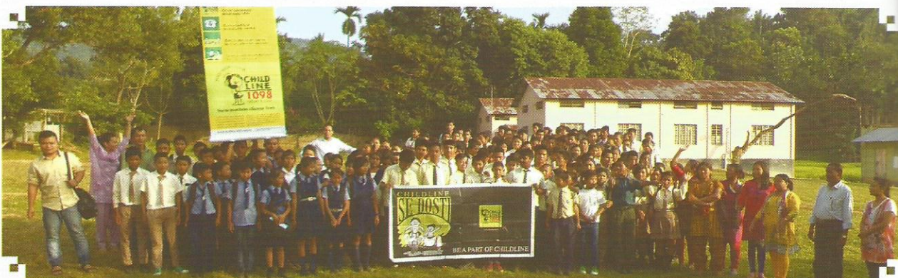
Child Line Se Dosti ( Childrens Day )