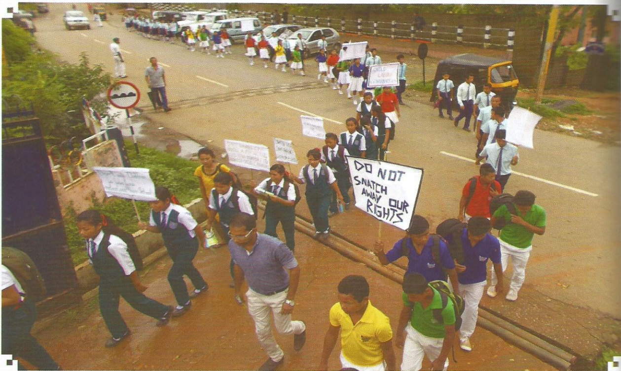
Students Participating in Rally- Anti Child Labour Day