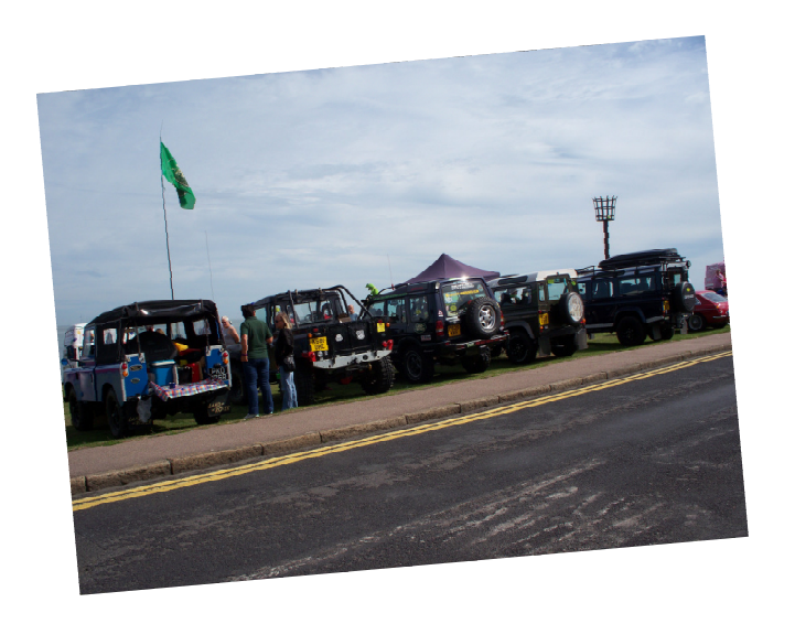
Whitstable – August (The "B" Side!)