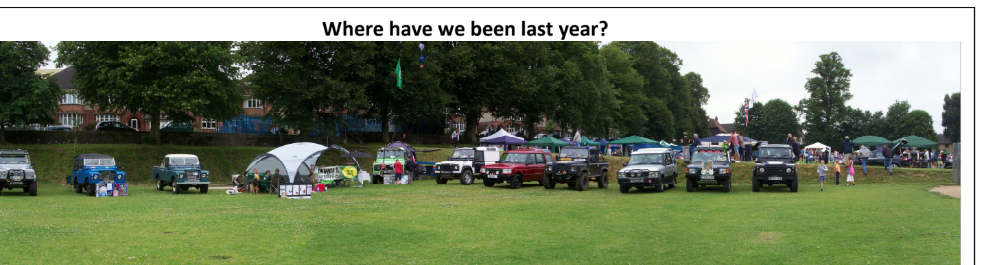
Cob Web – May River - July Chr