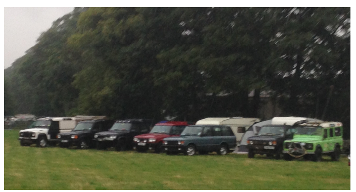
Chilli - July