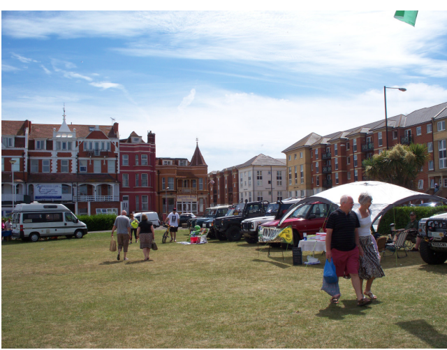
Clifftonville – June