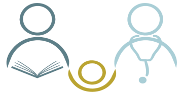
Nebraska Child Health & Education Alliance

NCHEA is a unique broad based advocacy organization built around the principle goal of ensuring Nebraska children and youth have access to health services to ensure success as educated, healthy adults. The membership is made up of entities from the private sector who want to work together to foster this very important goal.