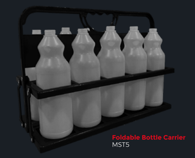
BOTTLES OPTIONAL EXTRA

Carry 10 litres to working area, for quick reload