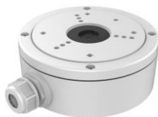
DS-1280ZJ-S Junction Box