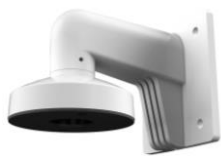
DS-1272ZJ-110-TRS Wall Mount