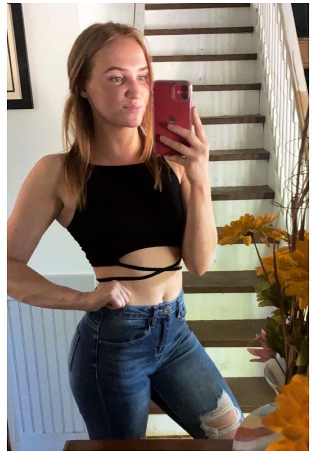
Trenbolone Acetate was originally used in veterinary medicine to accelerate muscle growth and improve the appetite of animals. Recently, the drug has found wide demand in professional bodybuilding, weight and athletics, powerlifting. Where can I buy Trenbolone Acetate Online in USA?