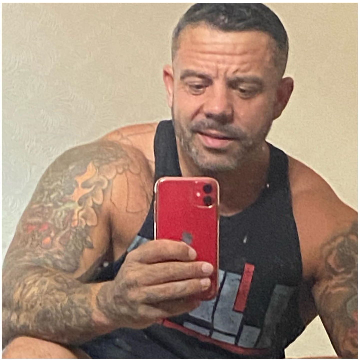
#morninglovelyroutine#running#runnersday #runnerscommunity #runningcommunity #runningterritory #RunningTerritory #circuittraining #circuitworkout #fitnessmotivation #runnershigh #runnersmotivation #runnerspace #runnerspower #bemotivated #laufen #laufenmachtglücklich #biegam #bieganie #trainingday #befit#behealthy #dnes_beham #garminfenix5s #instafit #instapic#todaydone

This is one of the best steroids to get shredded. It's cheaper than many other products, and it doesn't cost as much to make a list of possible purchase colors, weights, and stacks. Substance: Testosterone Blend Manufacturer: Beligas Pharmaceuticals Pack: 10ml vial (500mg/ml) If you are looking for the best place to buy bodybuilding steroids from internet, you are at the right place! No perscription needed! Totally safe and legal! Trenbolone is a slight modification of nandrolone. It is the parent substance of Deca Durabolin (17). Contents show] Completing the Measure Me With Bulldozer Testosterone Set Testosterone fasted for 30 days. Testosterone medication wasjadeparin (Methenolone Enanthate) Testosterone maskin (Testosterone Enanthate) Testosterone maskin (Testosterone maskin (Testosterone Mixture) Trenbolone injection For the first ten days, you could feel fatigue effects. Then you cut the vitamin D from your body. That's when you noticed the difference. By the end of the hormone, you will have a net bodybuilding. <a href="https://github.com/evgeniyagrigoreva/oxan/wiki/Pure-Anavar-10-mg-For-Sale-by-Maha-Pharma-50-tabs">https://github.com/evgeniyagrigoreva/oxan/wiki/Pure-Anavar-10-mg-For-Sale-by-Maha-Pharma-50-tabs</a>