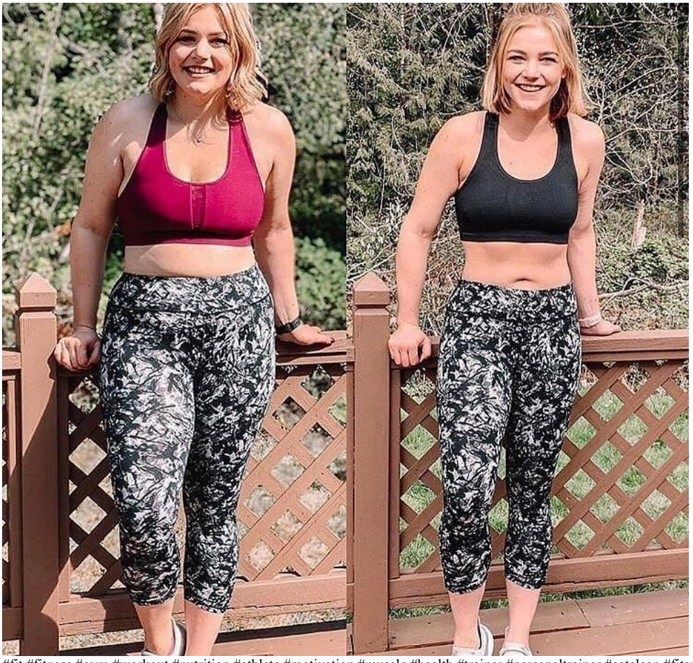
#fit #fitness #gym #workout #nutrition #athlete #motivation #muscle #health #trainer #personaltrainer #eatclean #fitspo #fitnessgoals #gymlife #london #gymshark #alphalete #fitlife #fitnessaddict #fitnessmotivation #marseille #fitnesspark #basicfit #fitinsta #fitfam #insta #instaselfie #instadaily #fitnesslifestyle