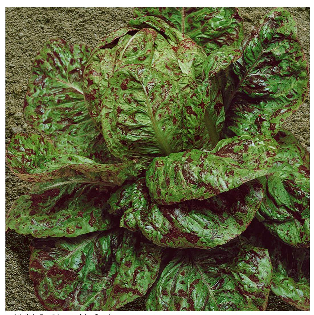
Best Mulch For Vegetable Garden

China is the largest producer of lettuce, contributing 55% to the globe's complete production by weight. By comparison, the USA contributes just around 16% to complete lettuce production worldwide. The main sort of lettuce produced and consumed in China is a stem lettuce (L. var. angustana), while in the U.S..