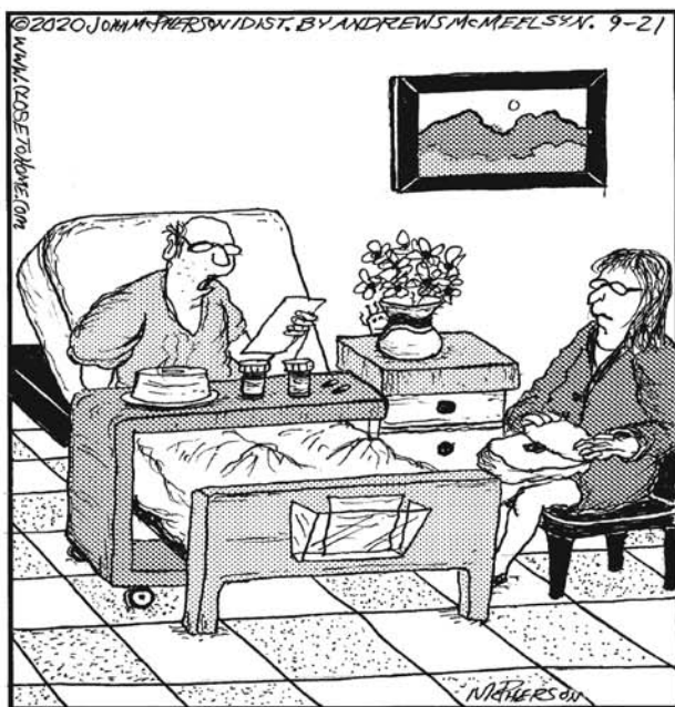
"May cause delusions, bleeding ears, incessant barking, toes may shrivel and fall off, extreme hair growth from nostrils ... and that's just the meatloaf!"