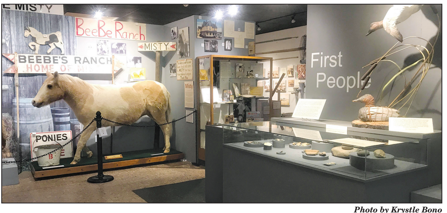
Visitors to the Museum of Chincoteague Island can see a well-preserved Misty and historic artifacts from the island.

The museum has extended its reach to offer a bus-guided Island History Tour. One tour per day is available Thursday through Saturday, with the bus leaving from the museum promptly at 2 p.m. and returning approximately one hour later