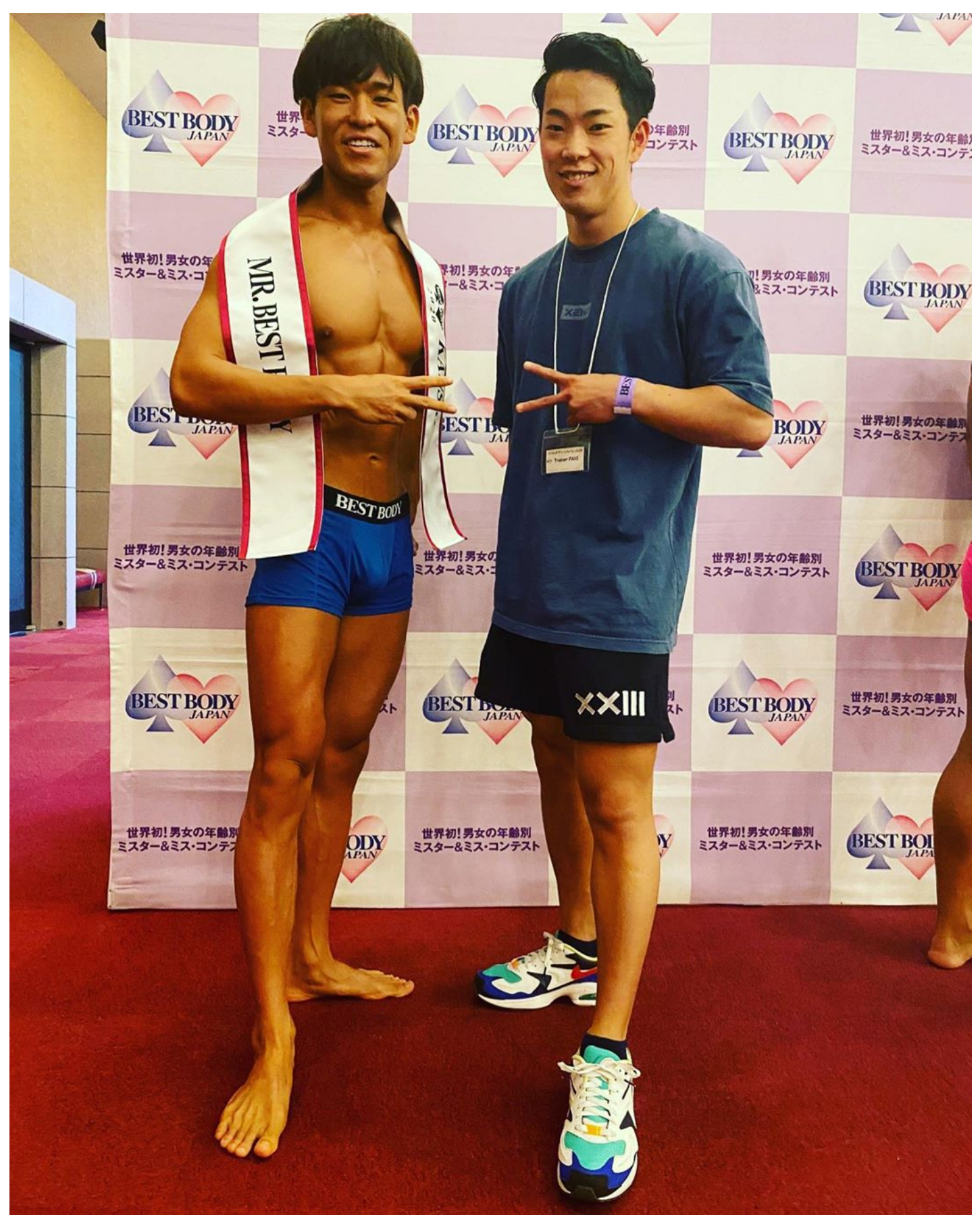
Track your progress - there are various ways you can track your progress from taking pictures, measuring yourself, weigh-ins, recording weights lifted as well as how you feel both mentally and physically. Doing this allows you to look back and acknowledge how far you have come, what you've achieved and whether there's anything you'd like to change.