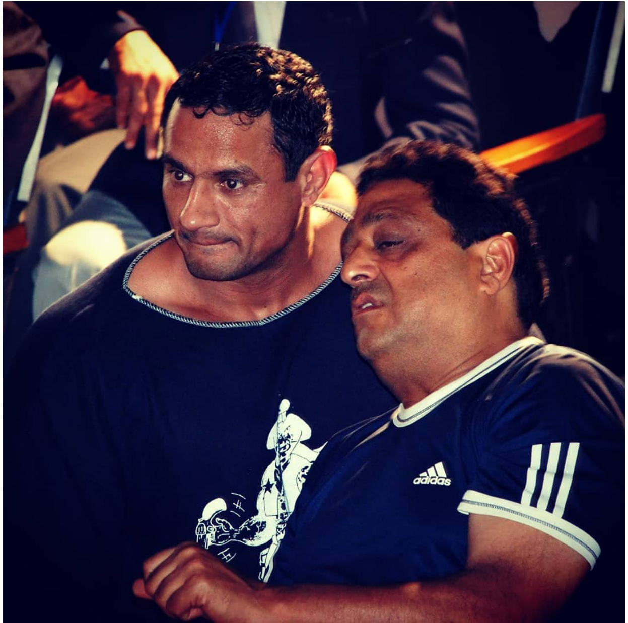
#igfit #vegasfit #lasvegas #fitnessmodel #fit #instafitness #workout #nike #athlete #beastmode #aesthetics #quarantine #quarantinelife #lockdown #2020 #classicphysique #firthi #physique #personaltrainer #abs #lvacflamingo #eosfitness #lasvegasfitness #selfmade #fitness #bodybuilding via @commandforig