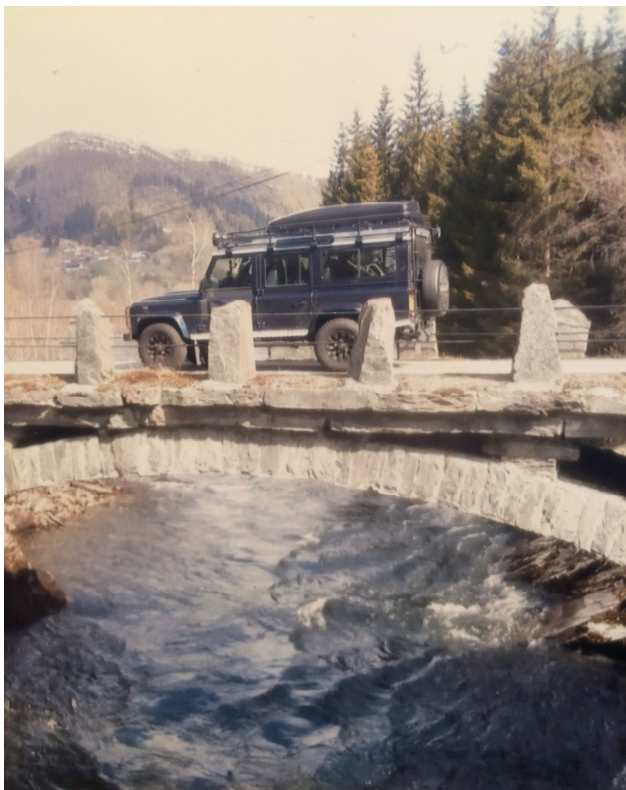
Perfect photo opportunity.