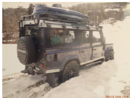
My Defender getting his wheels "snowy" in Norway.