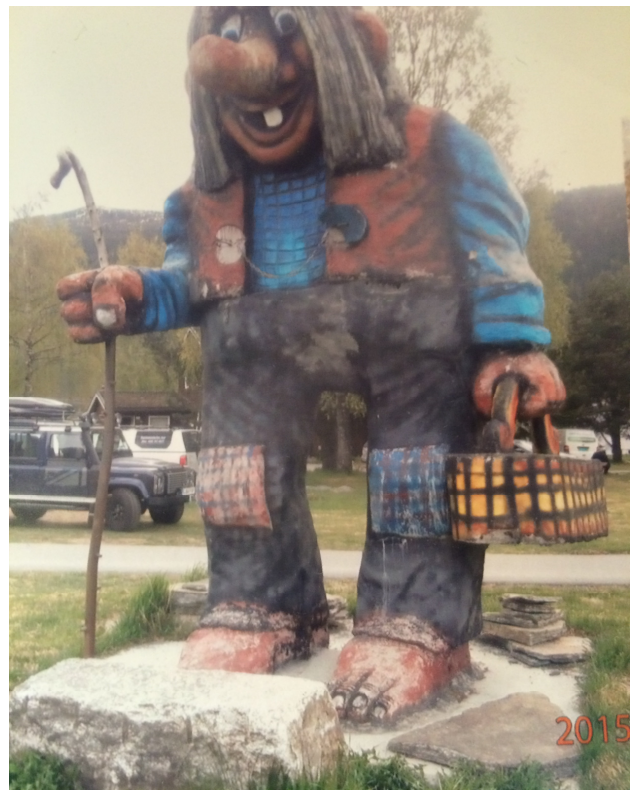
The locals were very friendly, thank goodness!