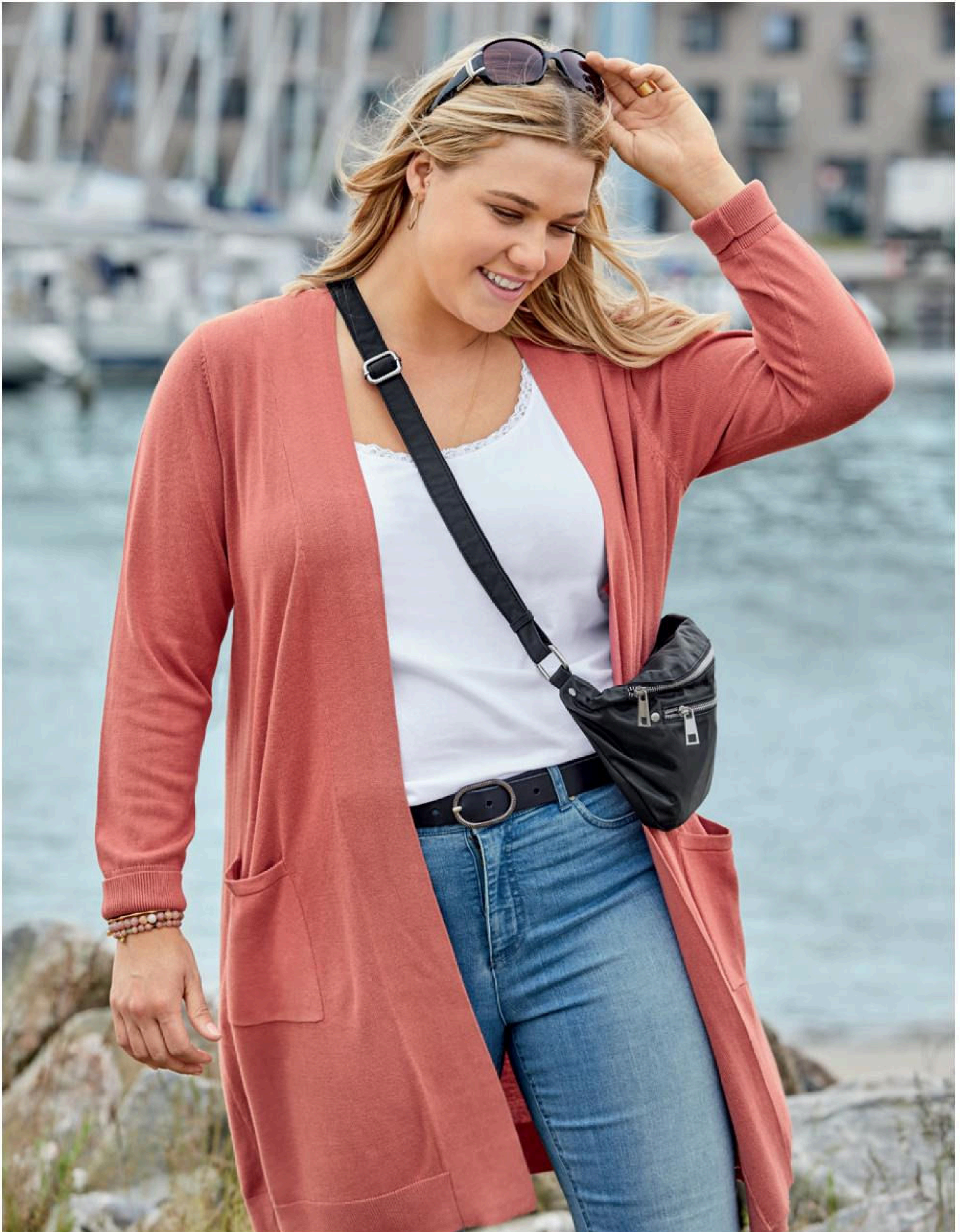
CARDIGAN 208729 TOP 211283 JEANS 210895 // BACKPAGE: COAT 210766 T-SHIRT 211217 JEANS 210895