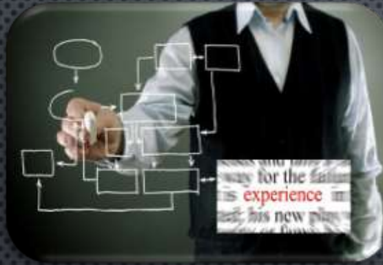
0 Trading Experience