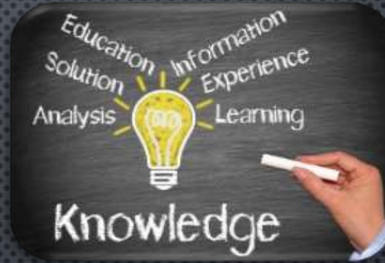
0 trading Knowledge