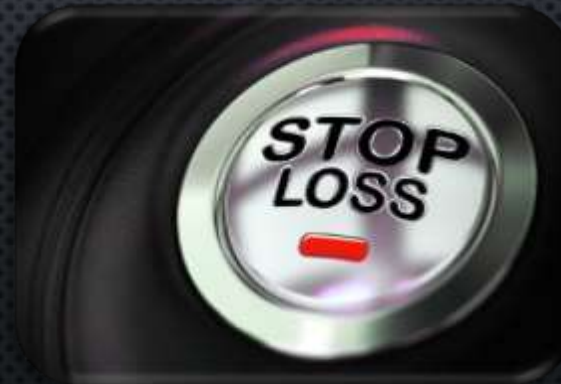
Stop Loss Apply