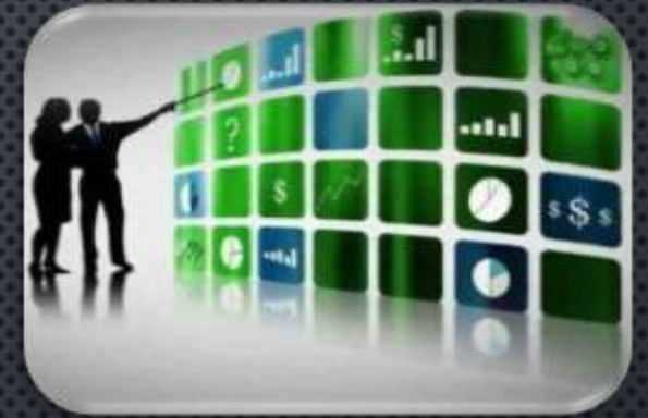
0 Trading Skill