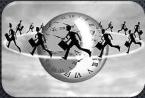
0 Spending Time