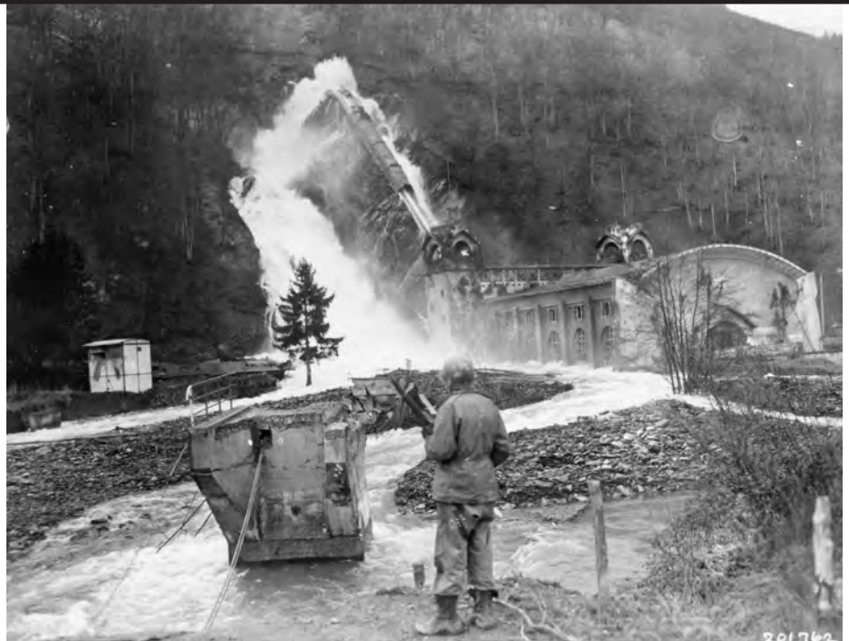
ABOVE: An American soldier watches torrents of water from the River Rur flow around the Heimbach hydro electric plant after the Schwammenauel Dam was breached in February 1945. OPPOSITE: A line of American troops crosses a bridge and marches through one of the many small villages that dot the Hürtgen region. The difficult hilly and forested terrain is very obvious in this photo, taken November 16, 1944.

He later came to the attention of the U.S. Army's Chief of Staff, General George C.