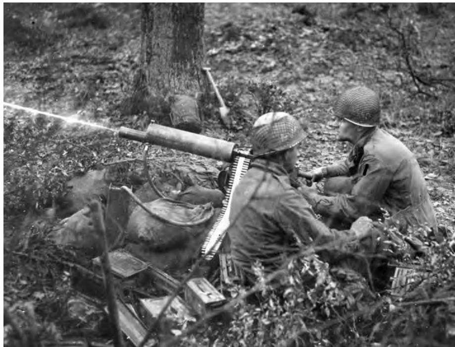
ABOVE: A .30-caliber machine-gun crew of Company D, 39th Regiment, 9th Infantry Division, fires a stream of bullets into the forest. BELOW: Vehicles from the 893rd Tank Destroyer Battalion roll down a logging trail through the Hürtgen Forest on their way to support the 28th Infantry Division at Schmidt, November 4, 1944.

Meanwhile, to the north the 109th Infantry Regiment had begun its attack to obtain a line of departure overlooking the village of Hürtgen itself. By early afternoon, the ini-