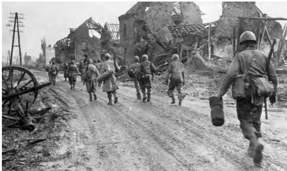
ABOVE: Men of the 121st Infantry Regiment, 8th Infantry Division, head out of the destroyed town of Hürtgen and advance toward Kleinau and the start of the attack to capture the Brandenburg-Bergstein Ridge. BELOW: German positions were so close to this 8th Infantry Division artillery battery that the gunners had to fire their 105mm howitzer at maximum elevation. OPPOSITE: American troops and armored vehicles pause in their advance as a German Hanomag Sk.Kfz/251 (right) burns.