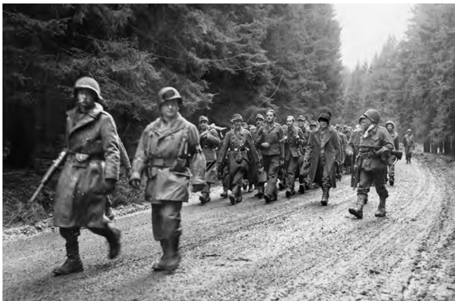
ABOVE: Members of the 28th Infantry Division escort a group of German prisoners captured in Schmidt to the rear, November 3, 1944. The Germans retook the town the next day. OPPOSITE: The heavily wooded terrain restricted visibility and mobility. Here a squad of 28th Infantry Division men advances cautiously through the Hürtgen Forest near Vossenack during the attack on Schmidt, November 3.