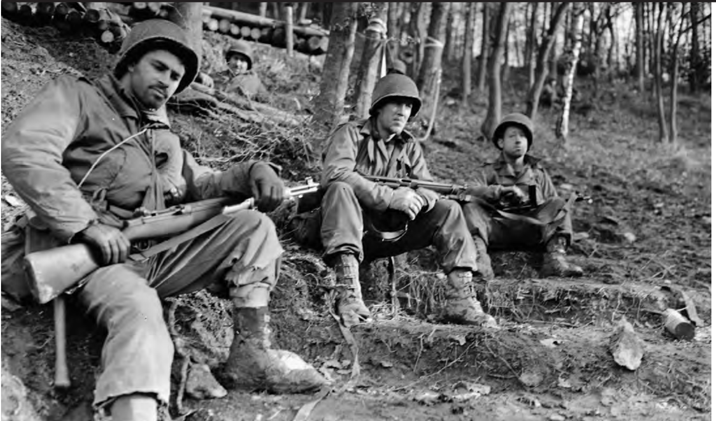
A group of tired and dirty 4th Infantry Division GIs gazes at the town of Schmidt from their hillside positions and ponder the effort that will be needed to take it, November 18, 1944.

were cleaned out by the 13th and 121st Infantry Regiments. A renewal of the attack on November 30 saw the 8th Division's 28th Infantry Regiment reaching Vossenack. But the next day strong enemy counterattacks turned the 8th Division onto the defensive.