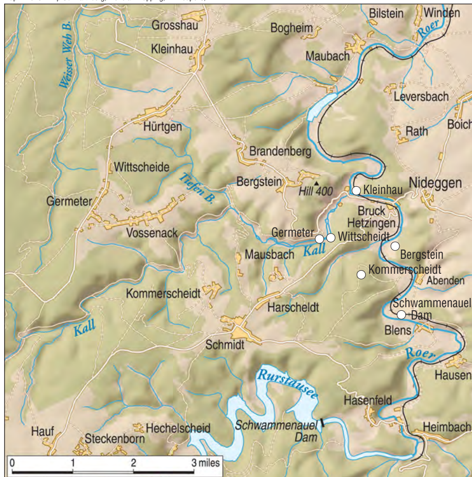
V and VIII Corps of the U.S. First Army faced a variety of obstacles during their penetration of the Roer Valley: hills, rivers, bad weather, a nearly impenetrable forest, and the bunkers of the Siegfried Line, or Westwall.