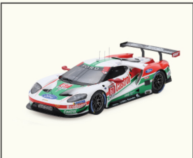
Ford GT GTLM #67 2019 Daytona 24 Hr. TSM430428