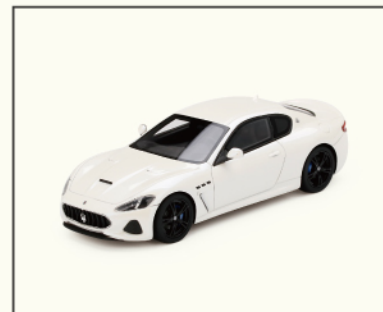
Maserati GranTurismo MC Bianco Birdcage TSM430398