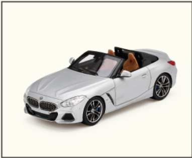
BMW Z4 Glacier Silver Metallic TSM430456

Specially chosen 1:43 scale models featuring unique additions to any collection