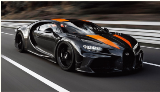
Bugatti Chiron Super Sport 300+

■ 1/43 McLaren Elva Presentation TSM430500