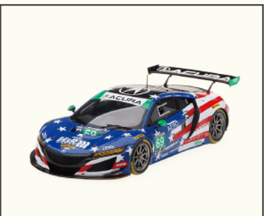
Acura NSX GT3 #69 2018 IMSA Watkins Glen TSM430417