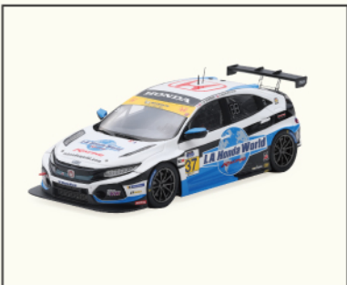
Honda Civic Type R TCR #37 2019 Daytona 24Hr. Class Winner TSM430448