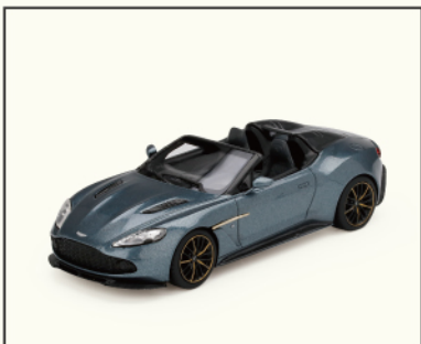
Aston Martin Vanquish Zagato Speedster Predator Grey TSM430372