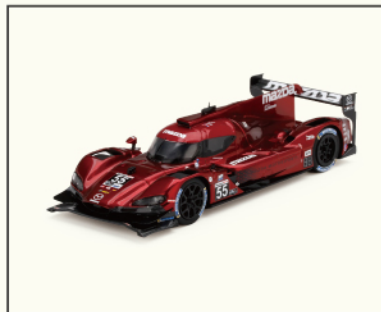
Mazda RT-24P #55 2019 IMSA Watkins Glen Winner TSM430407