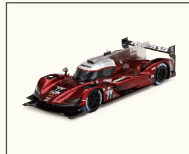
Mazda RT-24P #77 2019 IMSA Mobil 1 SportsCar GP Winner TSM430408