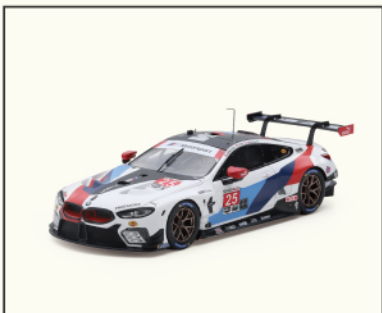
BMW M8 GTLM #25 2018 IMSA Petit Le Mans 3rd Place TSM430432