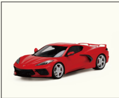
Chevrolet Corvette Stingray Torch Red TSM430494