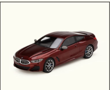
BMW M850i Aventurin Red Metallic TSM430454