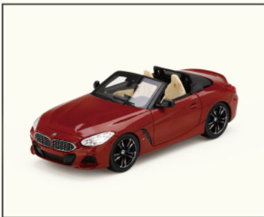
BMW Z4 San Francisco Metallic TSM430457