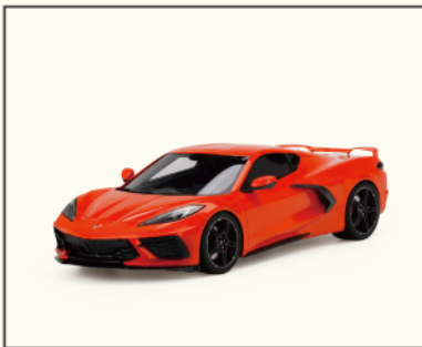
Chevrolet Corvette Stingray Sebring Orange Tintcoat TSM430495