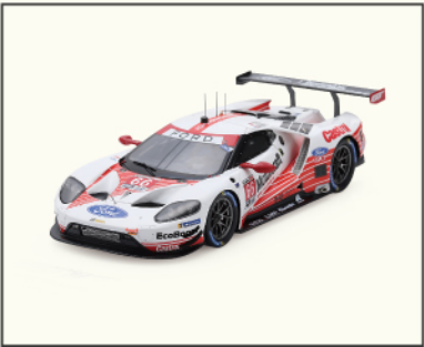
Ford GT GTLM #66 2019 Daytona 24 Hr. TSM430427