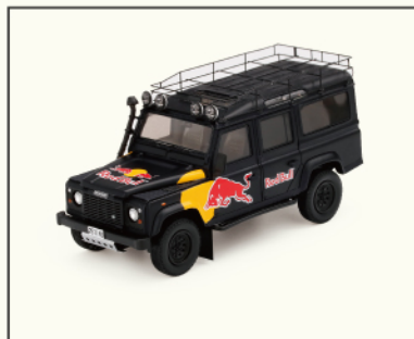
Land Rover Defender 110 Red Bull LUKA TSM430322