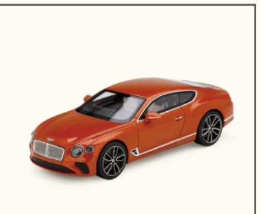
Bentley Continental GT Orange Flame TSM430377