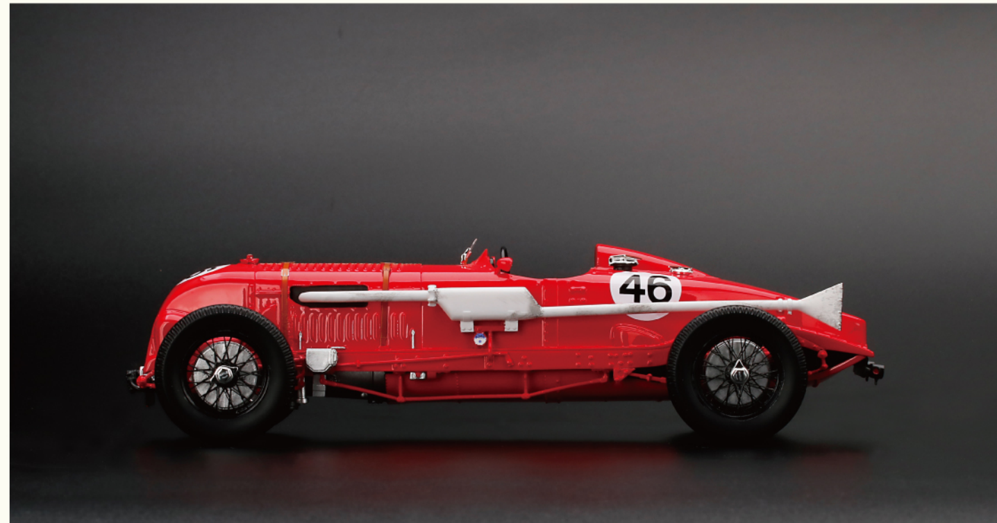
1/18 Bentley Blower No.1 1932 Brooklands 500 Miles Endurance TSMCE180008