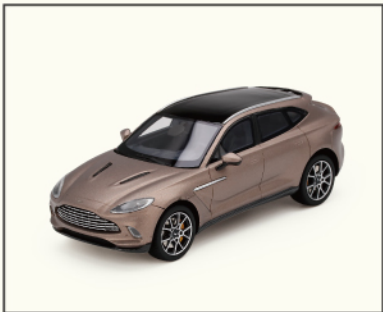
Aston Martin DBX Satin Solar Bronze TSM430498