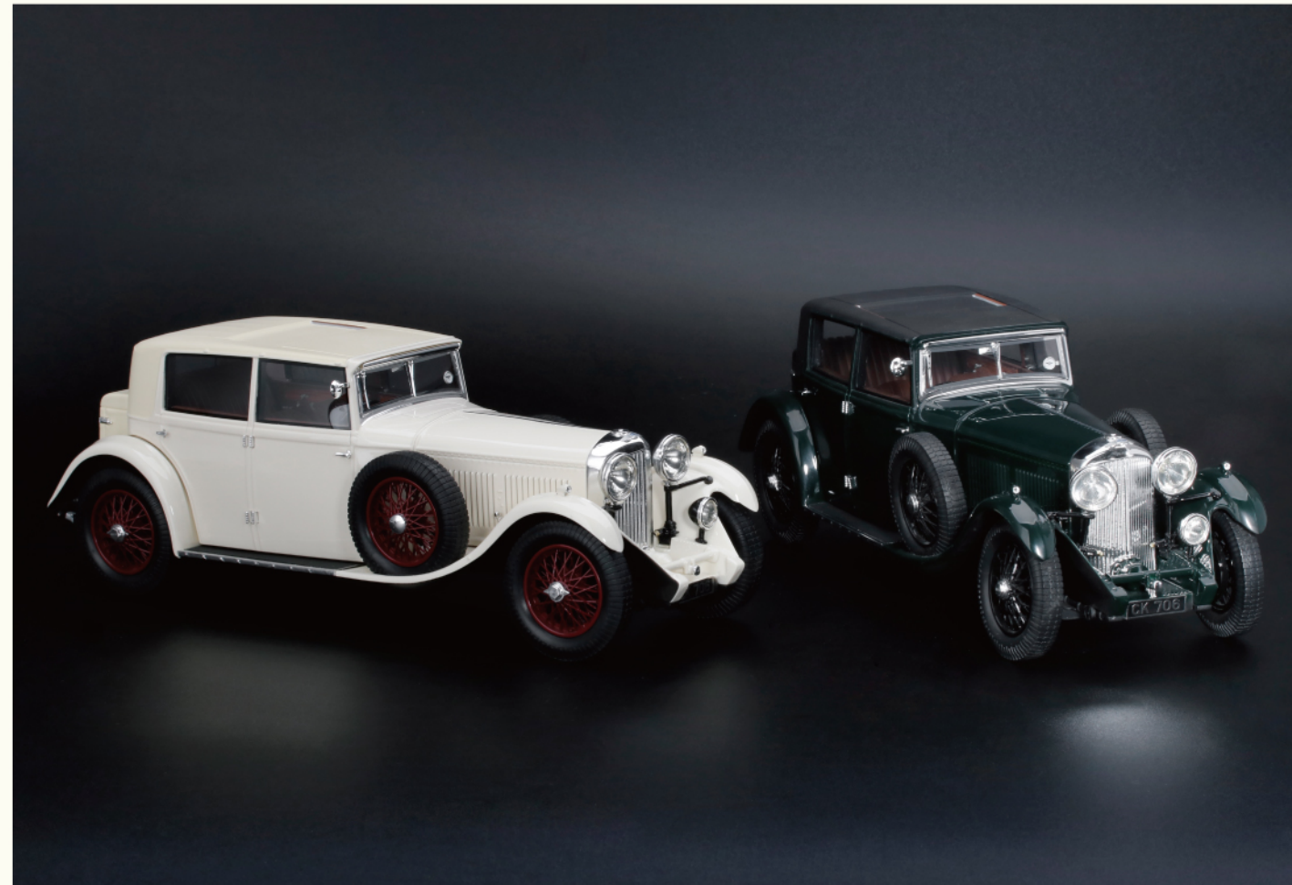
1/18 Bentley 8 Litre 1930 White TSMCE180007