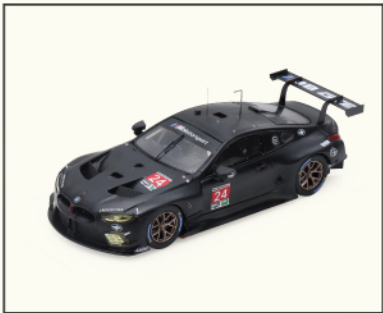
BMW M8 GTLM #24 2018 Daytona 24Hr. Test Car TSM430434