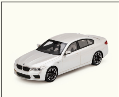
BMW M5 Alpine White TSM430379