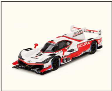
Acura DPi ARX-05 #6 2019 Daytona 24 Hr. TSM430438

■ 1/43 Bugatti Chiron Super Sport 300+ TSM430503