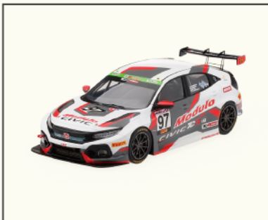
Honda Civic Type R TCR #97 Super Taikyu 2018 Suzuka Winner TSM430444

The new Defender is an automotive icon reborn for the 21st-century.