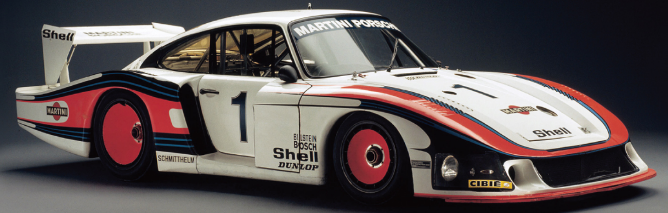
■ 1/12 Porsche 935/78 Moby Dick 1978 Le Mans 24Hr. TSM120007