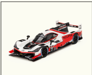
Acura DPi ARX-05 #7 2019 Daytona 24 Hr. 3rd Place TSM430439