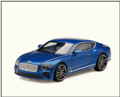
Bentley Continental GT Sequin Blue TSM430376