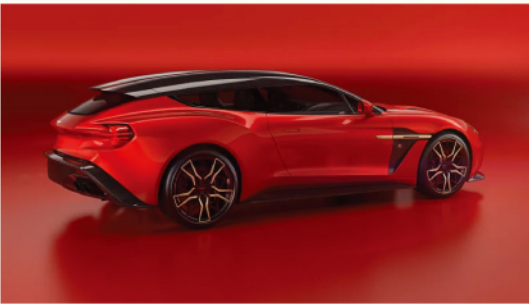
Aston Martin Vanquish Zagato Shooting Brake

■ 1/43 Mazda RT-24P #55 Mazda Team Joest IMSA Watkins Glen Winner TSM430407