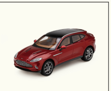
Aston Martin DBX Hyper Red TSM430497