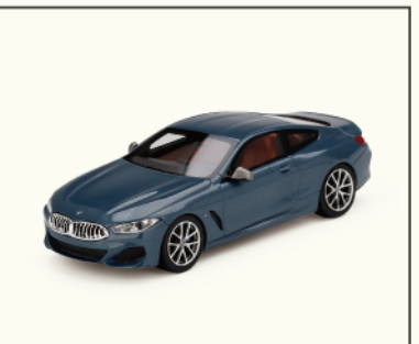
BMW M850i Barcelona Blue Metallic TSM430453