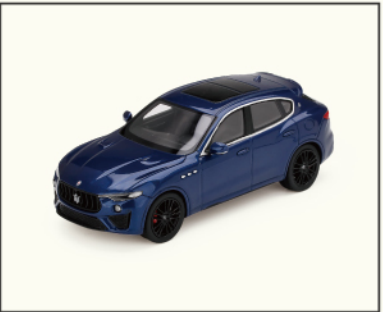
Maserati Levante Super Trofeo Blu Emozione TSM430400