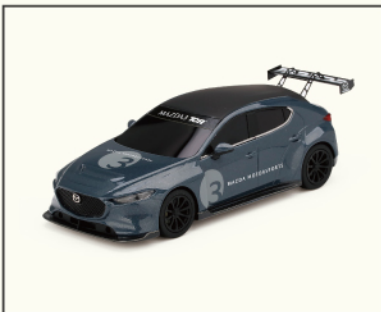
Mazda 3 TCR Presentation TSM430410