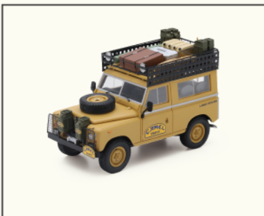
Land Rover Series III 1983 Camel Trophy Zaire TSM164321