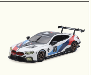
BMW M8 GTE 2018 Presentation TSM430429