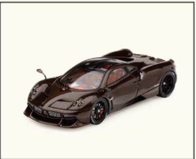
Pagani Huayra Hermes TSM430402