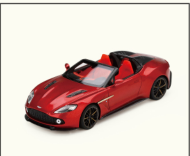
Aston Martin Vanquish Zagato Speedster Lava Red TSM430373