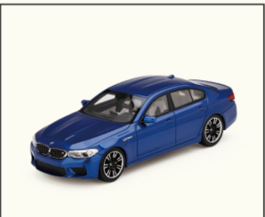
BMW M5 Yas Marina Blue Metallic TSM430381