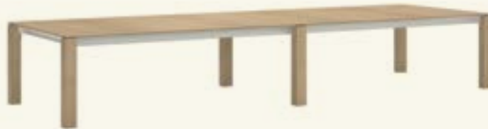
Table with 6-legged with oak, lacquered, optical glass, technical stone 8, Compacto HPL, laminated, ultramatte, linoleum, marble M1 or M3 top.