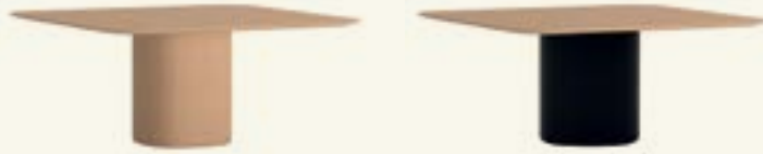
Meeting table with a central polyethylene base and with the option of an FSC® oak plywood base available with different top options.