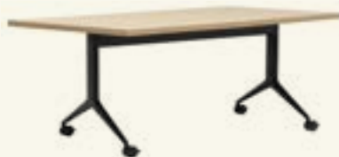
Fixed Y base