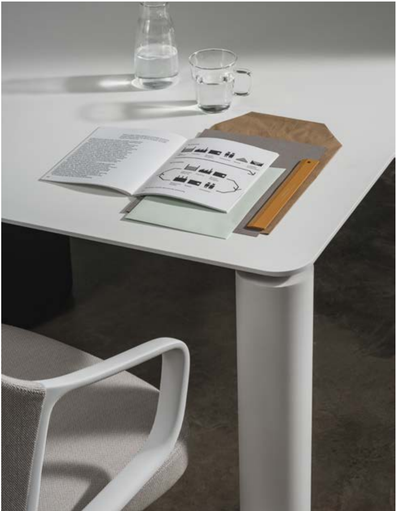
EXTRA CONFERENCE TABLE