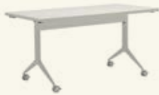
Fixed Y base

Multiple connectivity options are available for solutions on both the surface and out of sight. Individually or in a group, Connect allows multiple configurations for individual work, collaboration or team meetings and stands out as an intelligent system with multimedia and energy connection that is highly versatile.