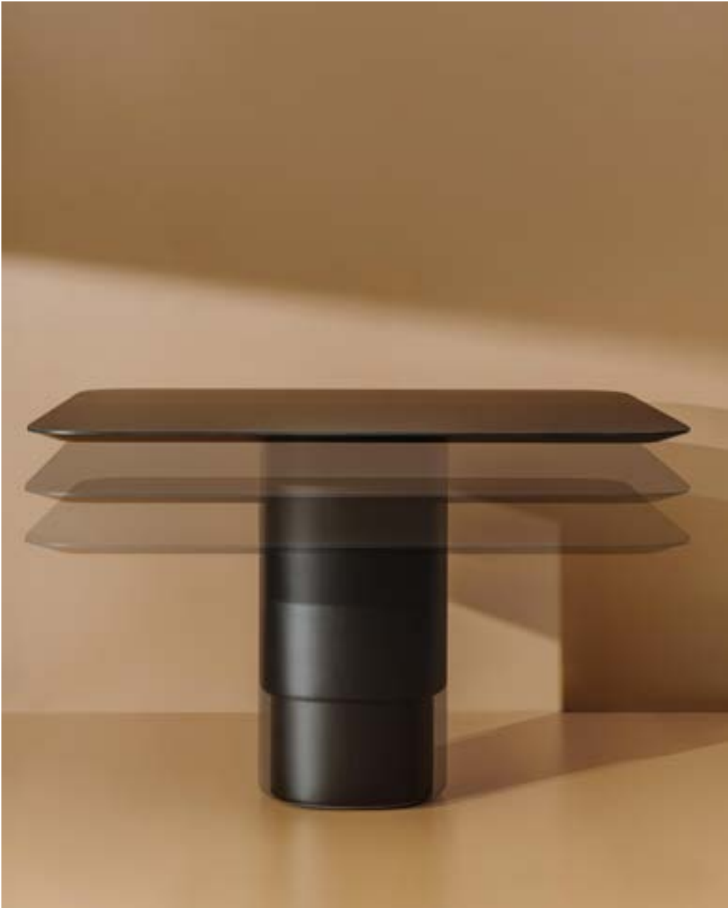
SOLID CONFERENCE TABLE