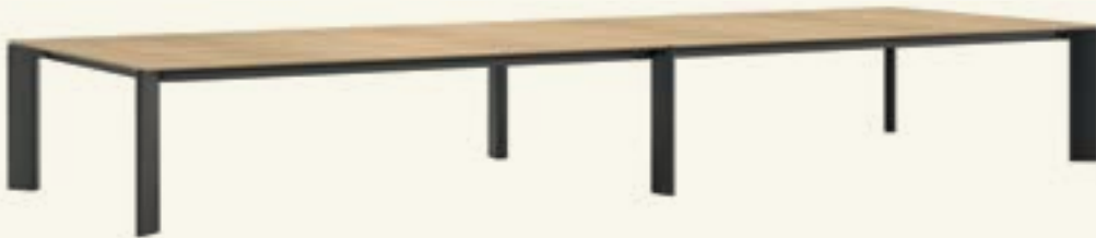
Table with 6-legged with oak, lacquered, optical glass, technical stone 8, Compacto HPL, laminated, ultramatte, linoleum, marble M1 or M3 top. 6.000 x 1.500 mm./ 236 x 59 in.