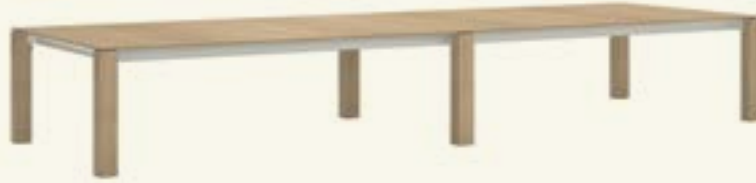
Table with 6-legged with oak, lacquered, optical glass, technical stone 8, Compacto HPL, laminated, ultramatte, linoleum, marble M1 or M3 top. 5.000 x 1.500 mm./ 177.25 x 59 in.