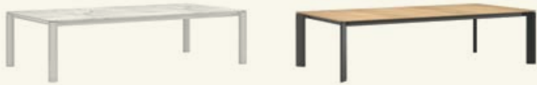
Table with 4-legged with oak, lacquered, optical glass, technical stone 8, Compacto HPL, laminated, ultramatte, linoleum, marble M1 or M3 top.

It is a table system of 1.500 mm./59 inches width and lengths from 3.000 mm./118,25 inches to 6.000 mm./236 inches. It can be configured with square, delta or cylindrical leg in aluminum or covered in oak. The table tops are available in a wide variety of materials and offer integrated wiring and electrification systems in accordance with international standards.