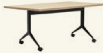
Fixed Y base