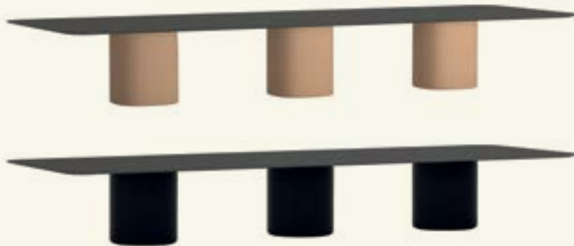
Meeting table with three polyethylene bases and with the option of an FSC® oak plywood base available with different top options.