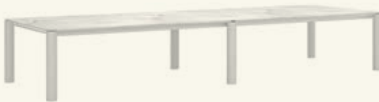
Table with 6-legged with oak, lacquered, optical glass, technical stone 8, Compacto HPL, laminated, ultramatte, linoleum, marble M1 or M3 top. 4.000 x 1.500 mm./ 157.5 x 59 in.