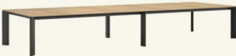
Table with 6-legged with oak, lacquered, optical glass, technical stone 8, Compacto HPL, laminated, ultramatte, linoleum, marble M1 or M3 top. 4.500 x 1.500 mm./ 177.25 x 59 in.