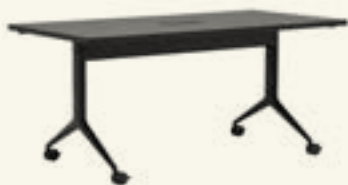
Fixed Y base

It is made of 100% recyclable aluminum and ecodesigned for the circular economy so that all components are easily separable and recyclable at the end of their useful life or they can be given a second life.