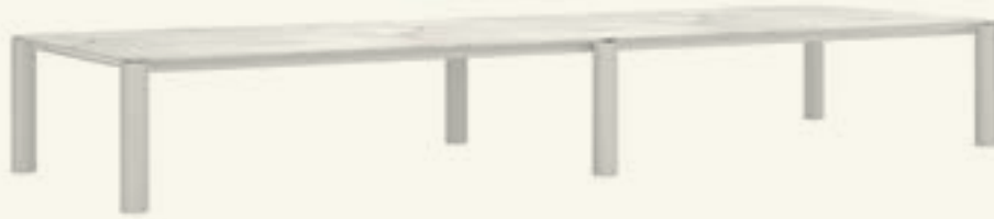
Table with 6-legged with oak, lacquered, optical glass, technical stone 8, Compacto HPL, laminated, ultramatte, linoleum, marble M1 or M3 top. 5.500 x 1.500 mm./ 216.5 x 59 in.