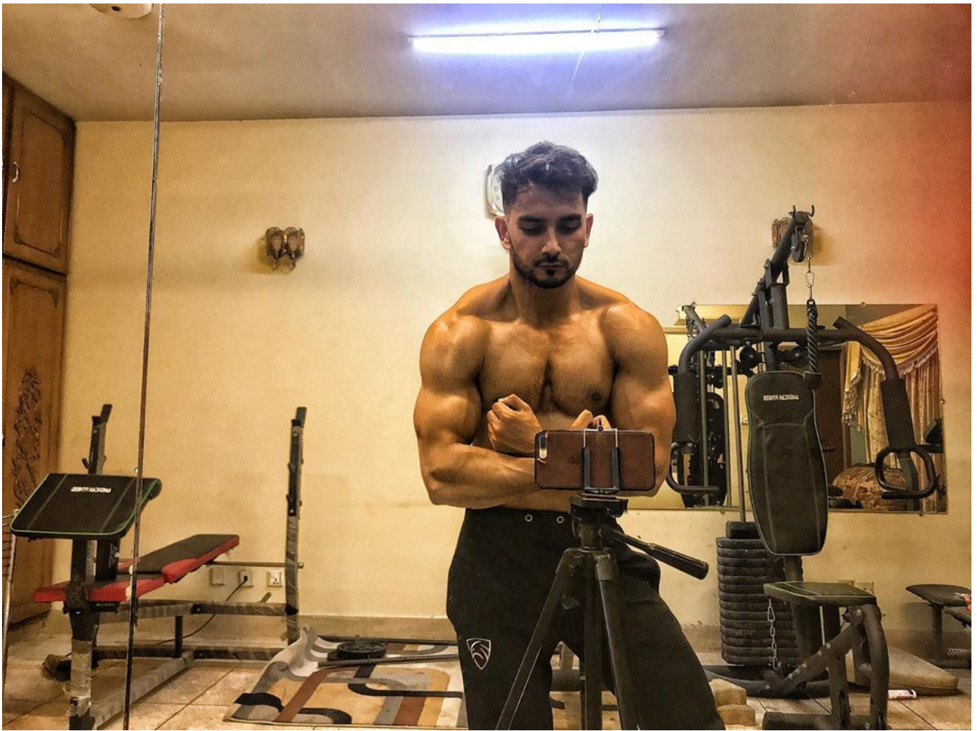
☐ King Zeus ☐ Please post any questions or comments down Below I want to interact and answer any questions for my followers much love ☐☐☐ ☘ Sparta Bullies ☘