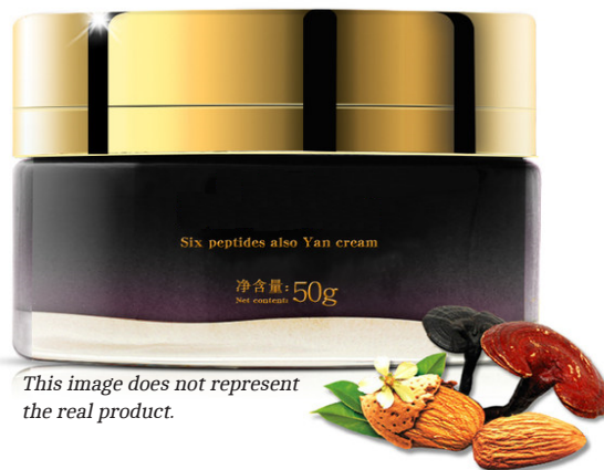
This image does not represent the real product.

Chen- creme hits the market - company investigates burn marks on skin of senior citizen.