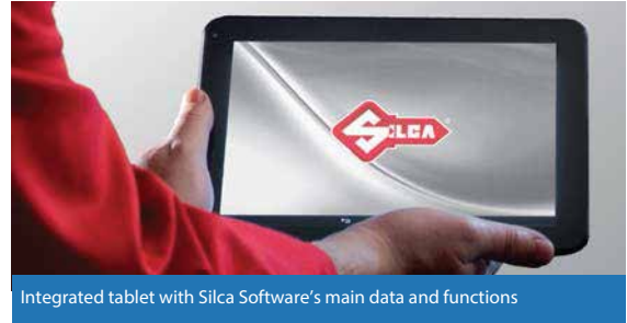
Integrated tablet with Silca Software's main data and functions

Silca remains by your side in your everyday work. Our technical assistance staff worldwide will provide you