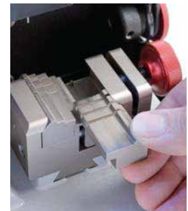
Interchangeable jaws for laser and dimple keys