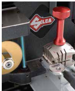
Prismatic cutter and optical reader for flat keys

Futura combines design and quality. Characterized by modern, clean-cut lines and a neat-looking shape, the machine is made of select components and first-rate materials and applies the most cutting-edge technologies, complying with the highest standards of Silca quality.