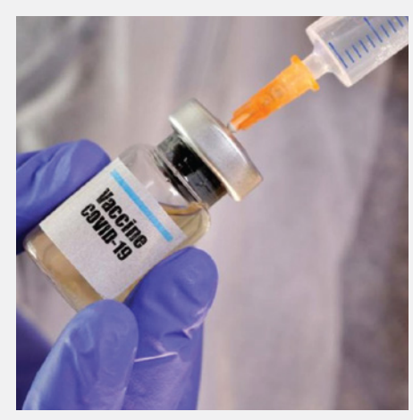
Accelerating the vaccination programme