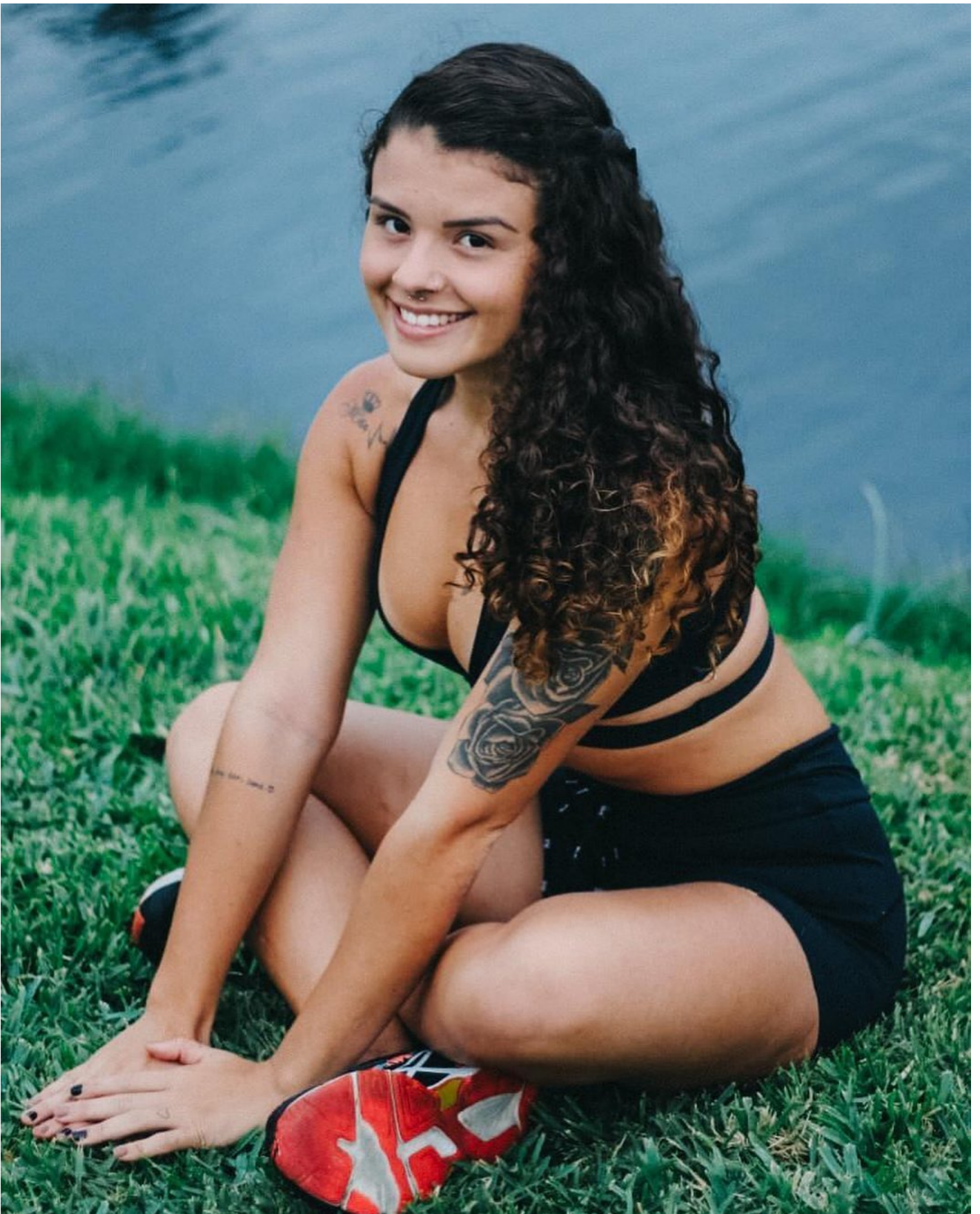
#epic #fashion #bikini #clothing #fitness #instpic #model #style #beautiful #health #swimwear #beauty #flexible #gym #blond #muscle #workout #hair #swimsuit #girl #shoutout #picoftheday #photography #flexibility #woman #repost #flexibility #love #selfie #cute 1080