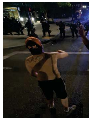
USAO Version Rev. April 2018