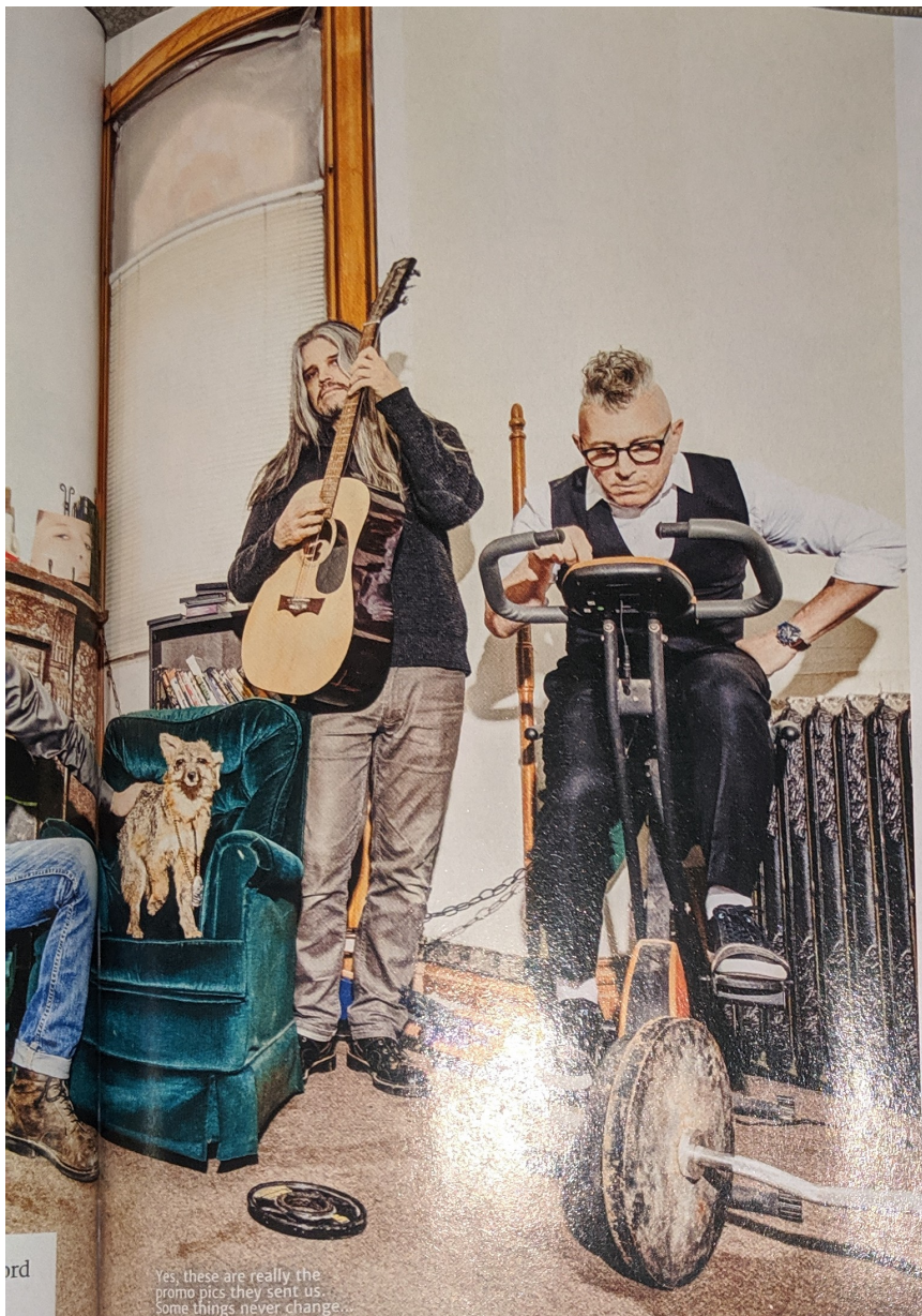
Yes, these are really the promo pics they sent us... Some things never change...

older, you wanna learn, you wanna change, you wanna evolve, and you don't want to live in fear. The fear of dying, fear of everything. Fear is the mindkiller, you know?"