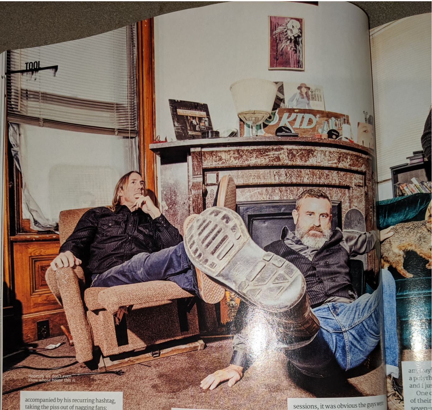
Honestly we don't even know whose house this is

accompanied by his recurring hashtag, taking the piss out of nagging fans: #whileyouwerewhiningwewereworking. The internet revved into overdrive.