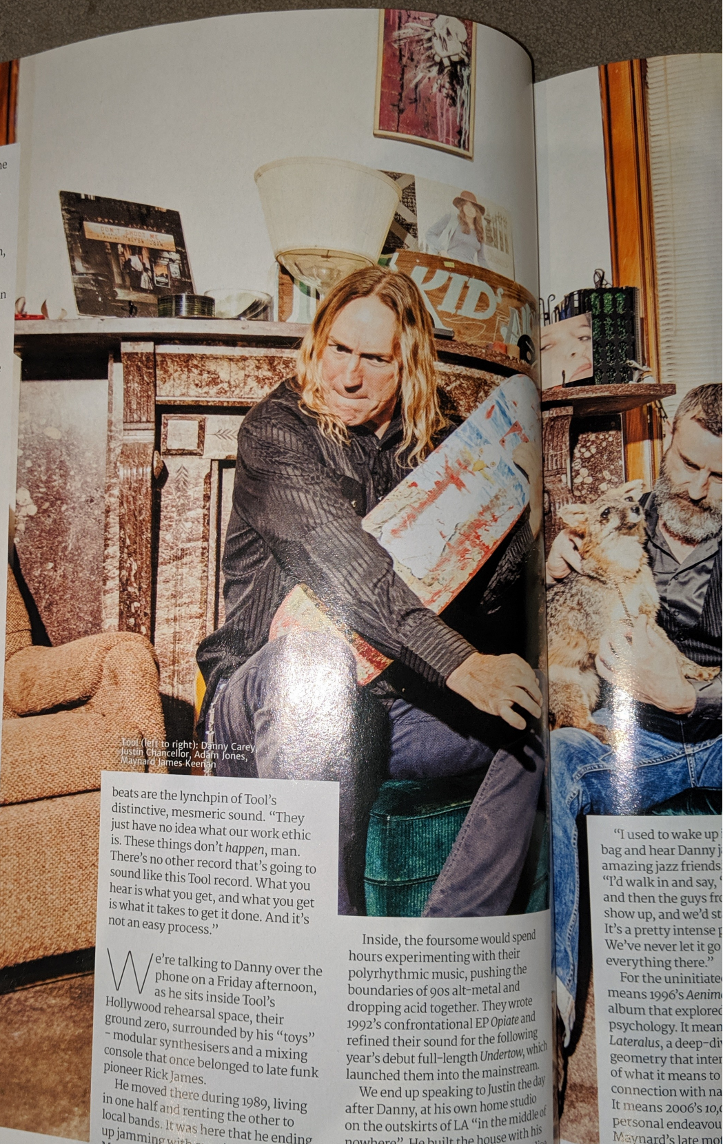
Tool (left to right): Danny Carey, Justin Chancellor, Adam Jones, Maynard James Keenan

"I felt bad for him, and he even told me he was getting death threats from these idiots out there," sighs drummer Danny Carey, whose insane