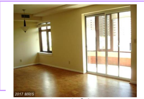
Before ASP® Staging

"The investment of Staging IN your home is always less than a price reduction ON your home"