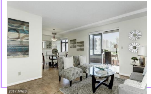
After ASP® Staging