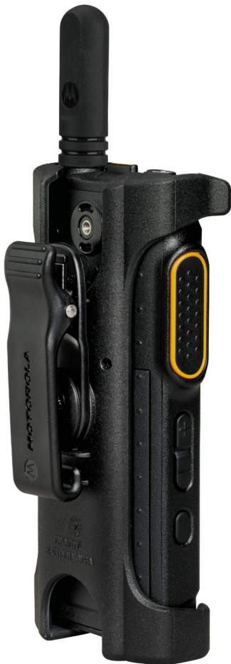
PMLN7190 Carry Holder/Holster with Swivel Belt Clip

By spending countless hours in the field with customers, we've developed accessories that aren't just the most innovative. But also the most useful.