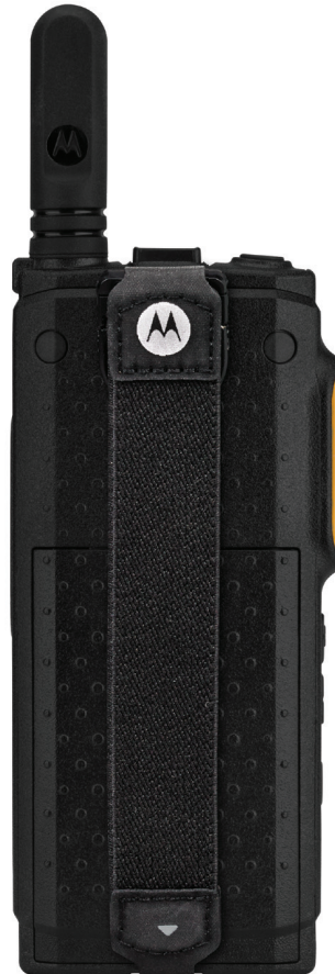
PMLN7076 Flexible Hand Strap