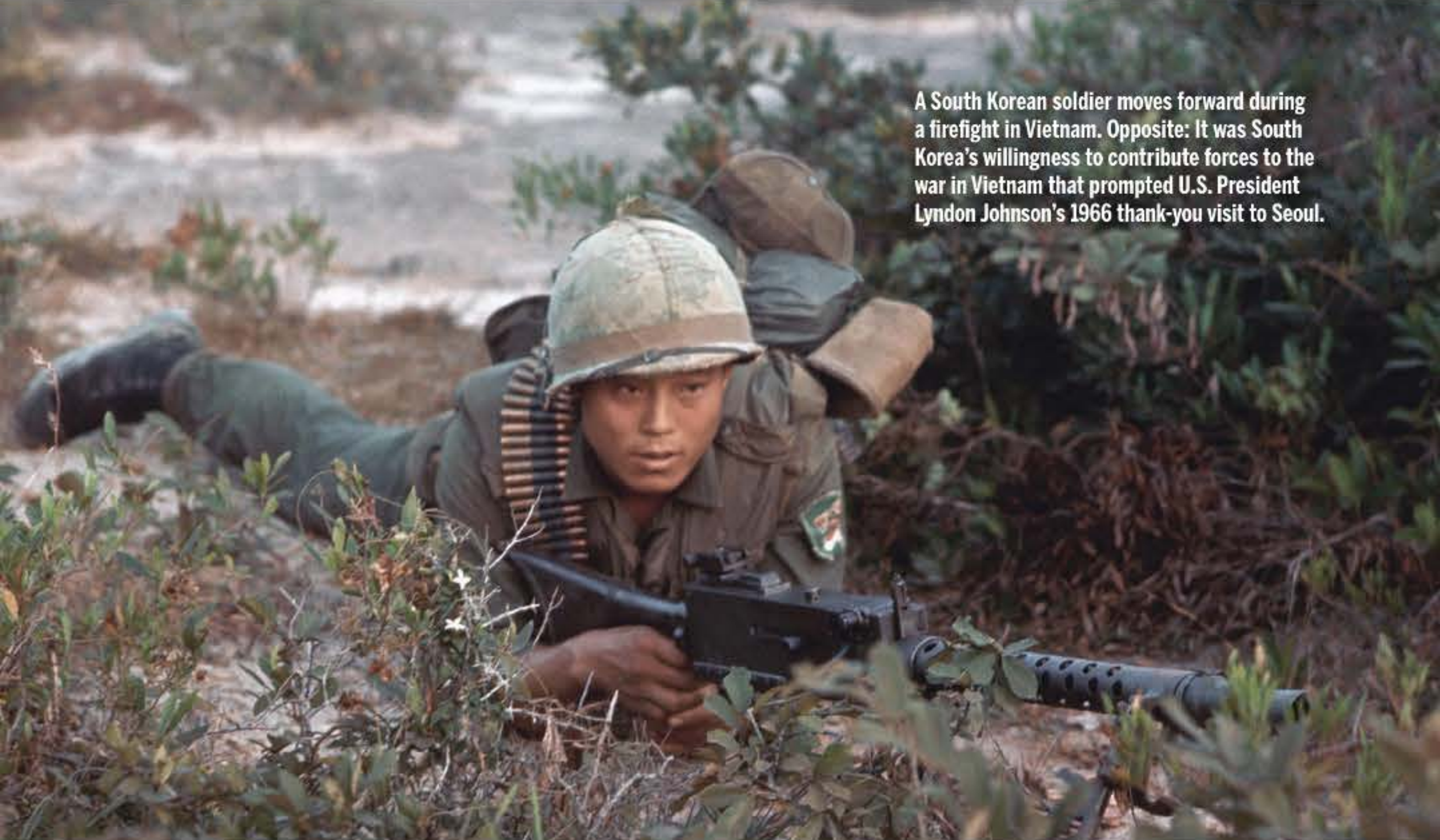
A South Korean soldier moves forward during a firefight in Vietnam. Opposite: It was South Korea's willingness to contribute forces to the war in Vietnam that prompted U.S. President Lyndon Johnson's 1966 thank-you visit to Seoul.

T he cheering Korean crowds were enough to stop any man in his tracks—even the president of the United States. South Korea was the final layover on Lyndon Johnson's 17-day, seven-nation tour of Asia in the fall of 1966, and he had come primarily to thank President Park Chung-hee for having committed 45,000 Korean troops to the Vietnam War effort.