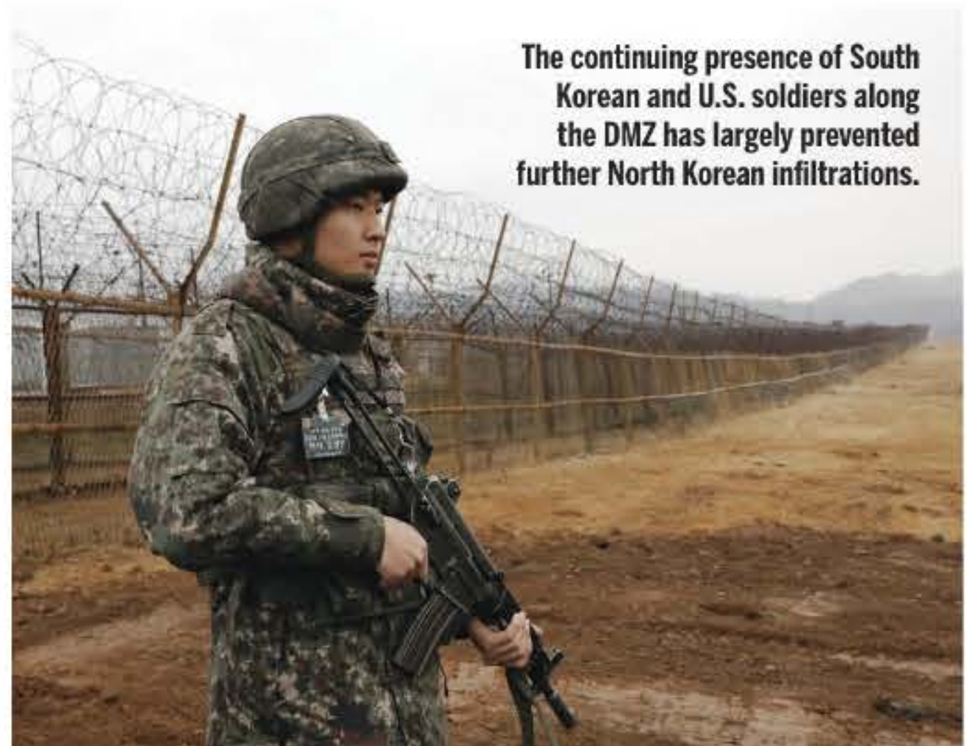
The continuing presence of South Korean and U.S. soldiers along the DMZ has largely prevented further North Korean infiltrations.

Stay Alert Long-duration guard duty and frequent patrols along similar routes can lead to deadly complacency.