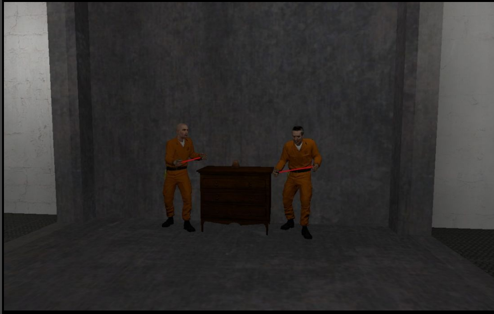
Subjects standing in same quadrant