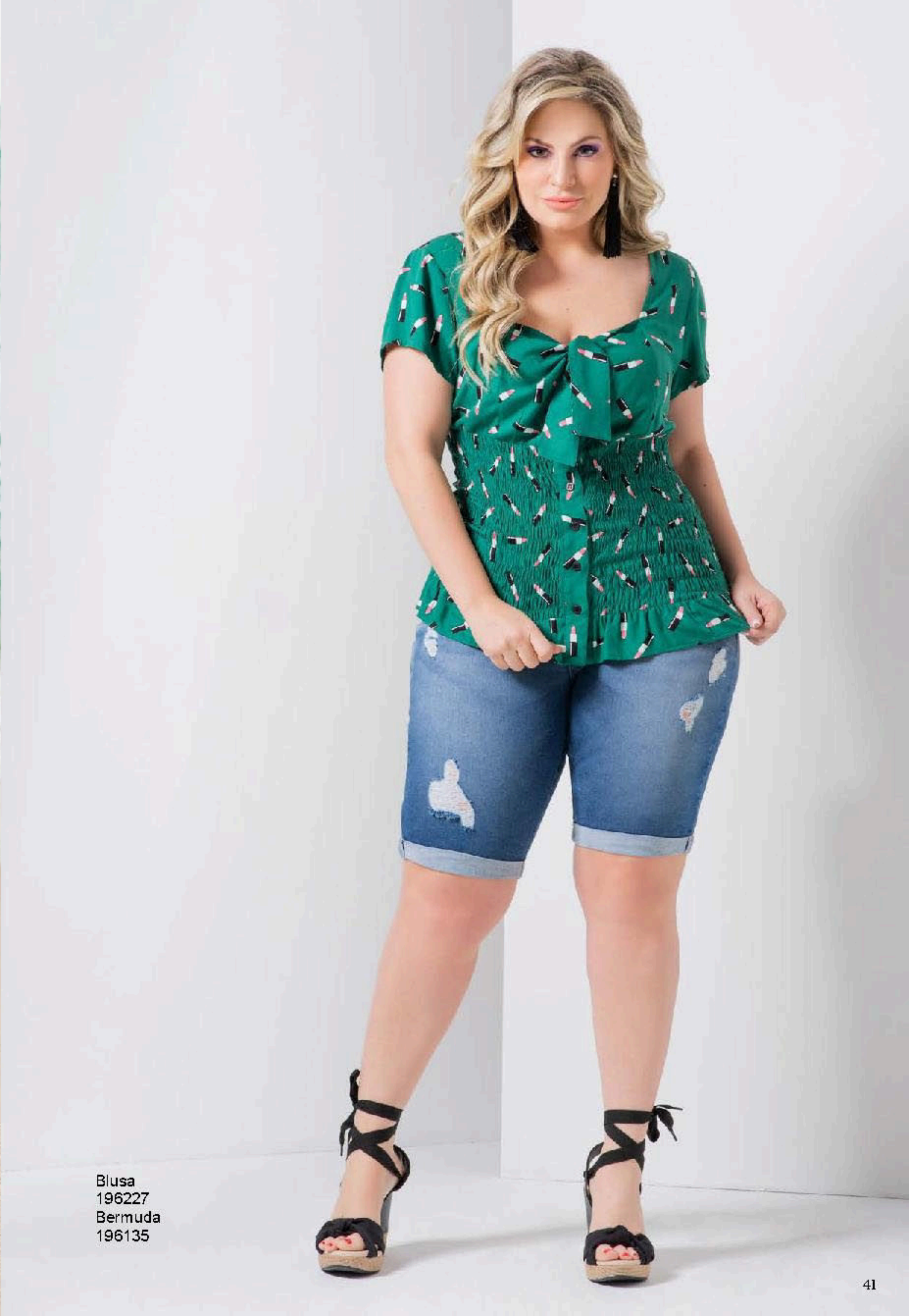
Blusa 196227 Bermuda 196135