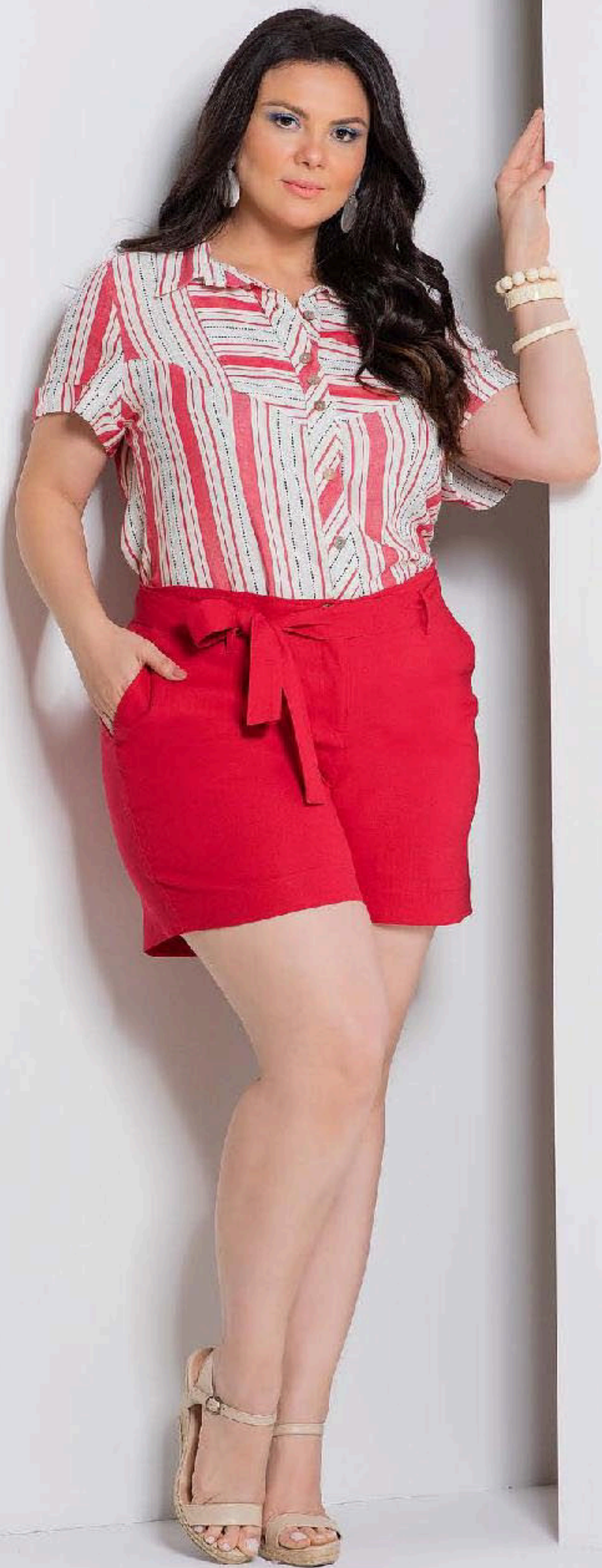
Camisa 196261 Shorts 196251