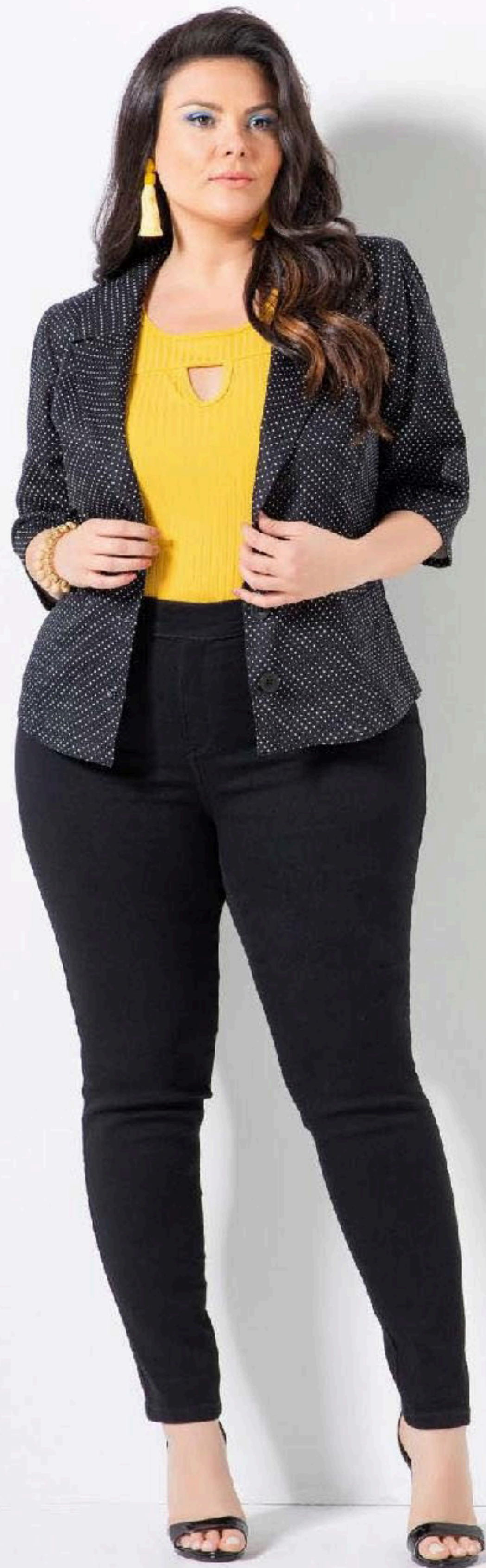
Blazer 196220 Blusa 191484 Calça 196041