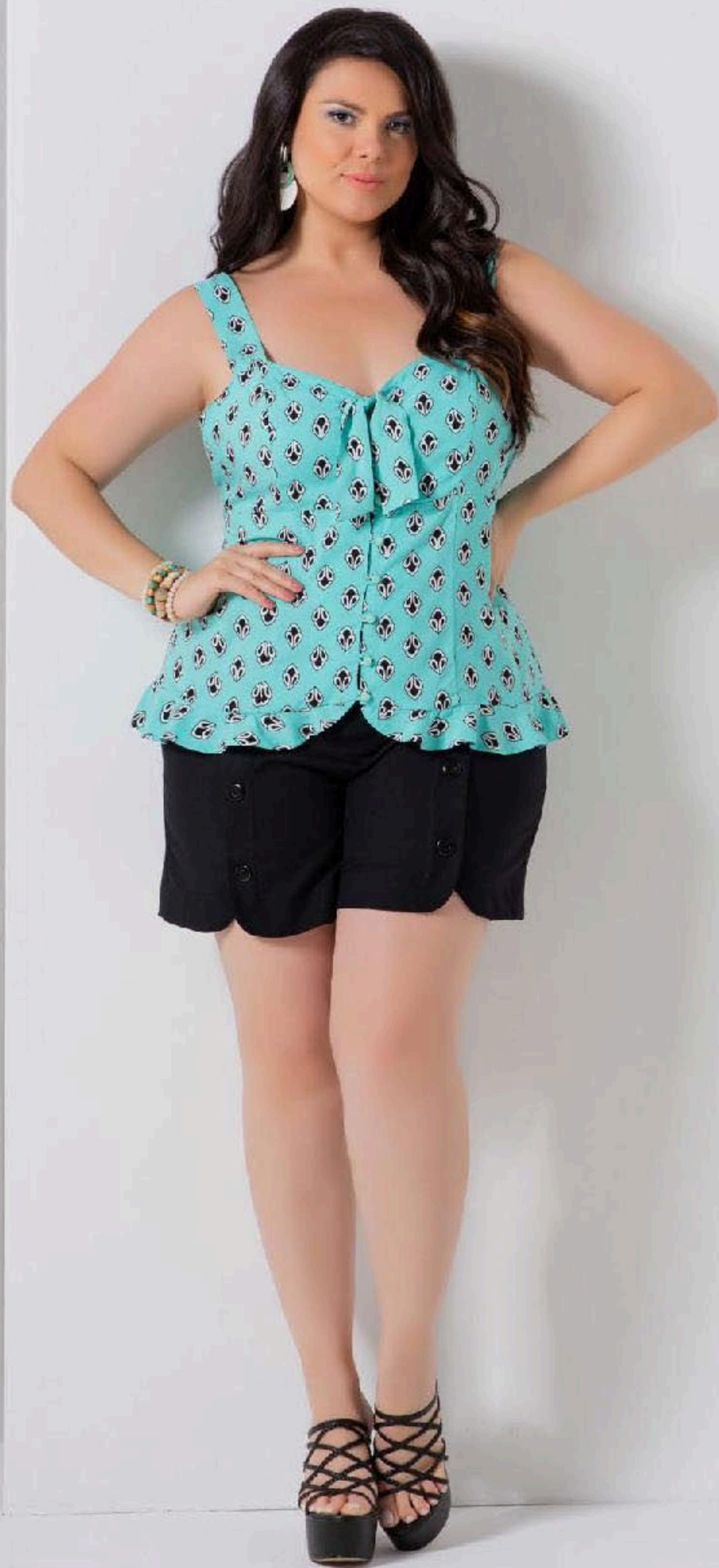
Blusa 196186 Shorts 196150