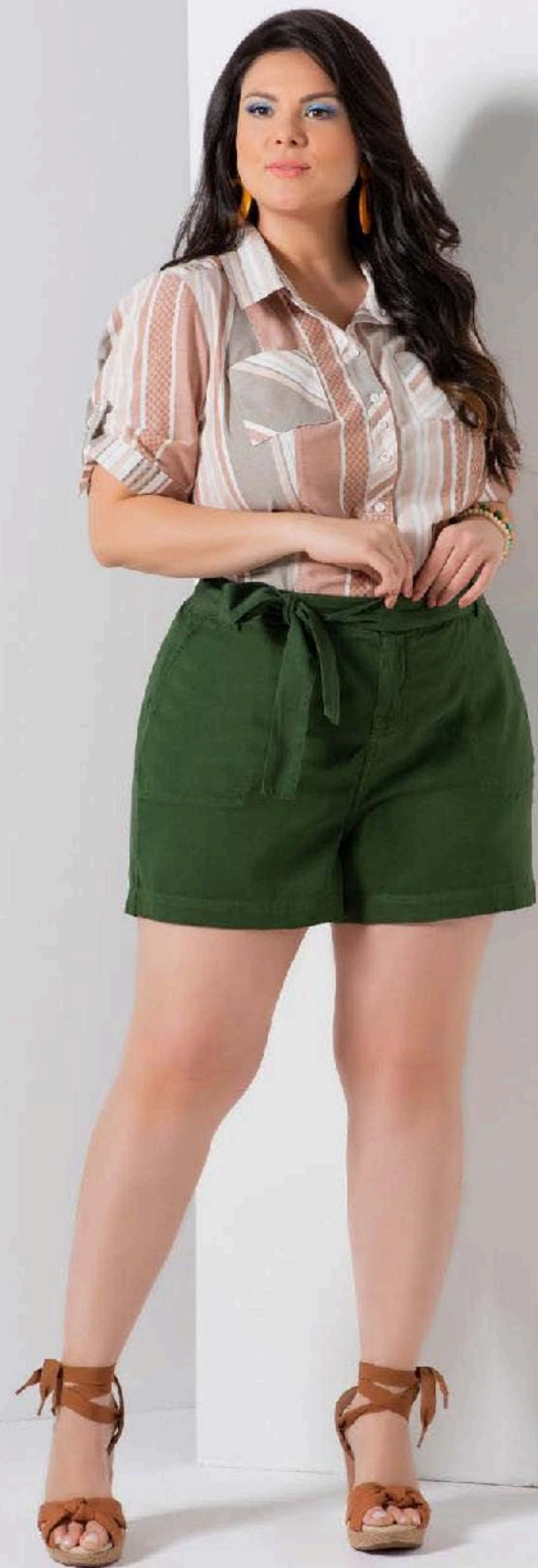
Camisa 196169 Shorts 196179