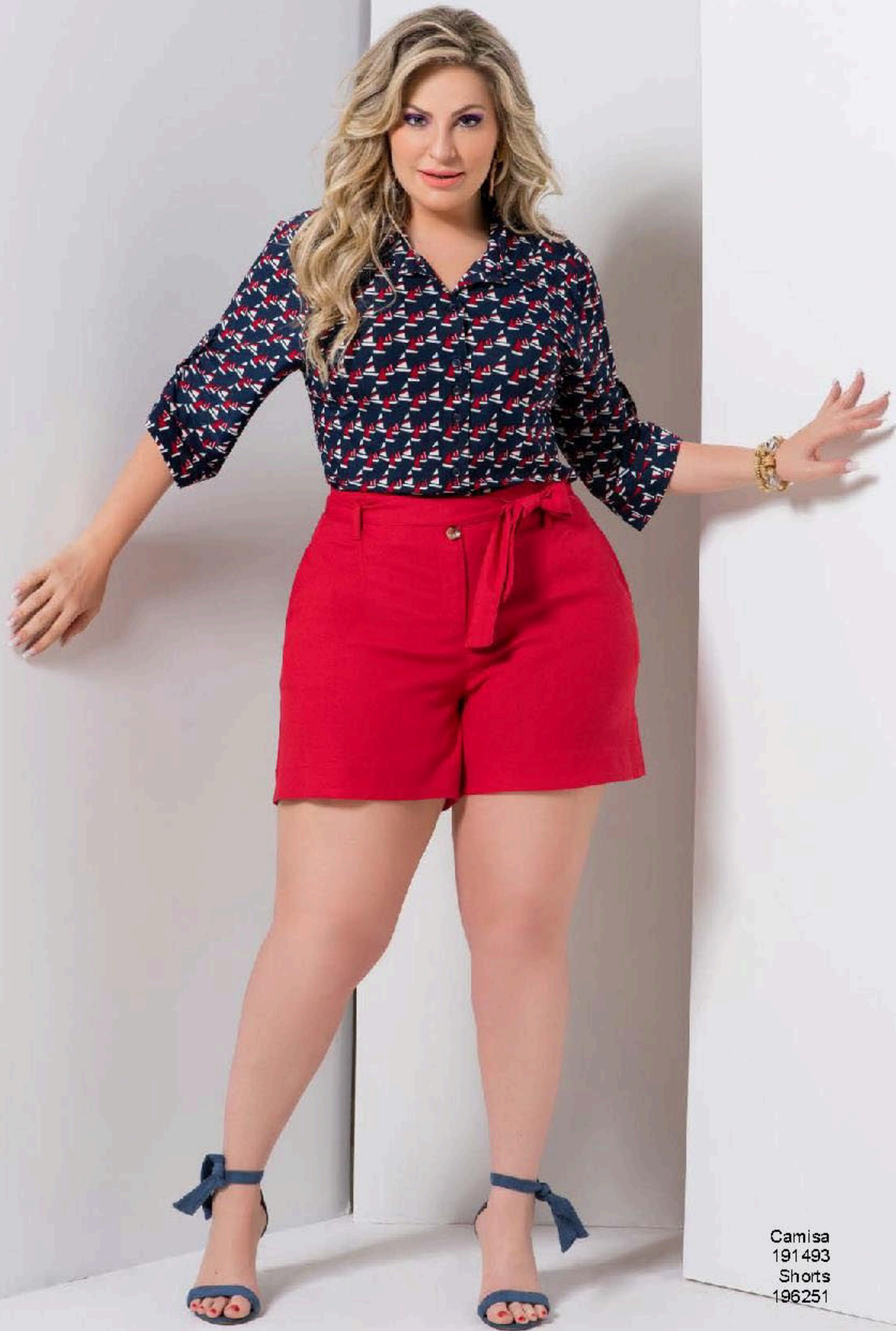
Camisa 191493 Shorts 196251