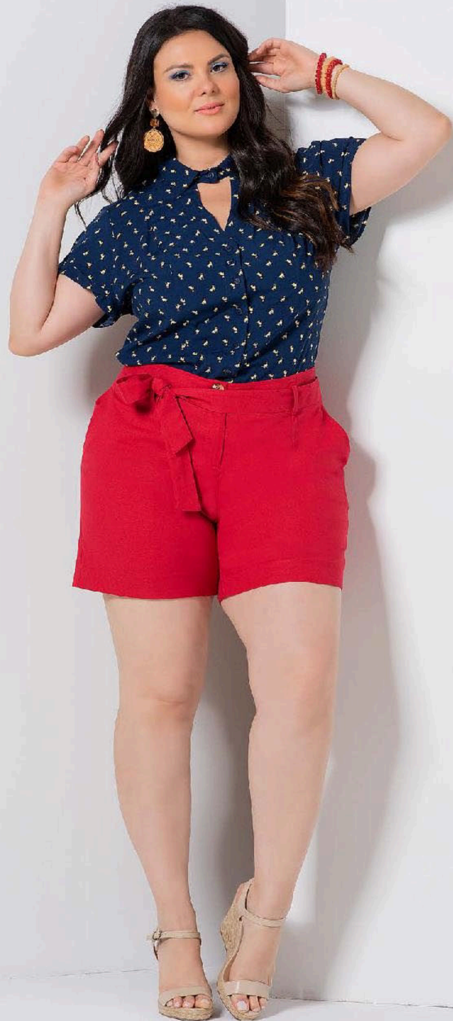
Camisa 196111 Shorts 196251