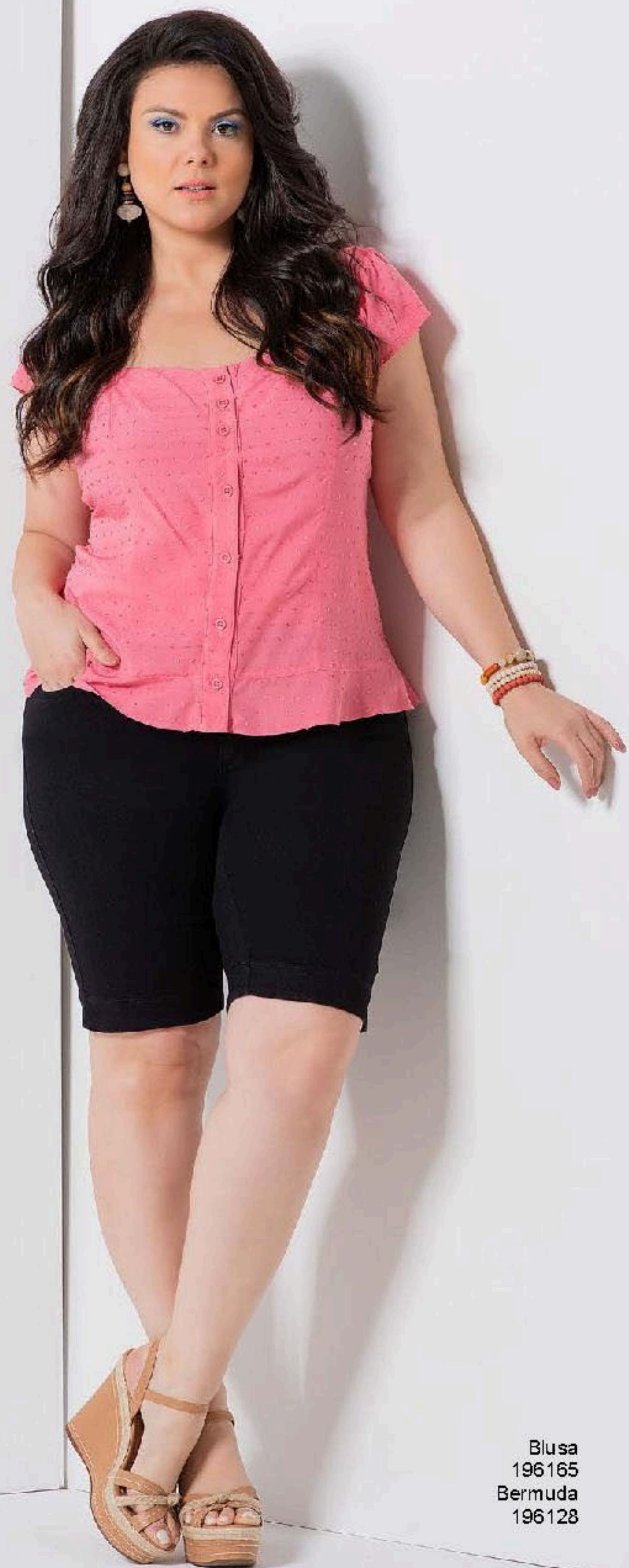
Blusa 196165 Bermuda 196128