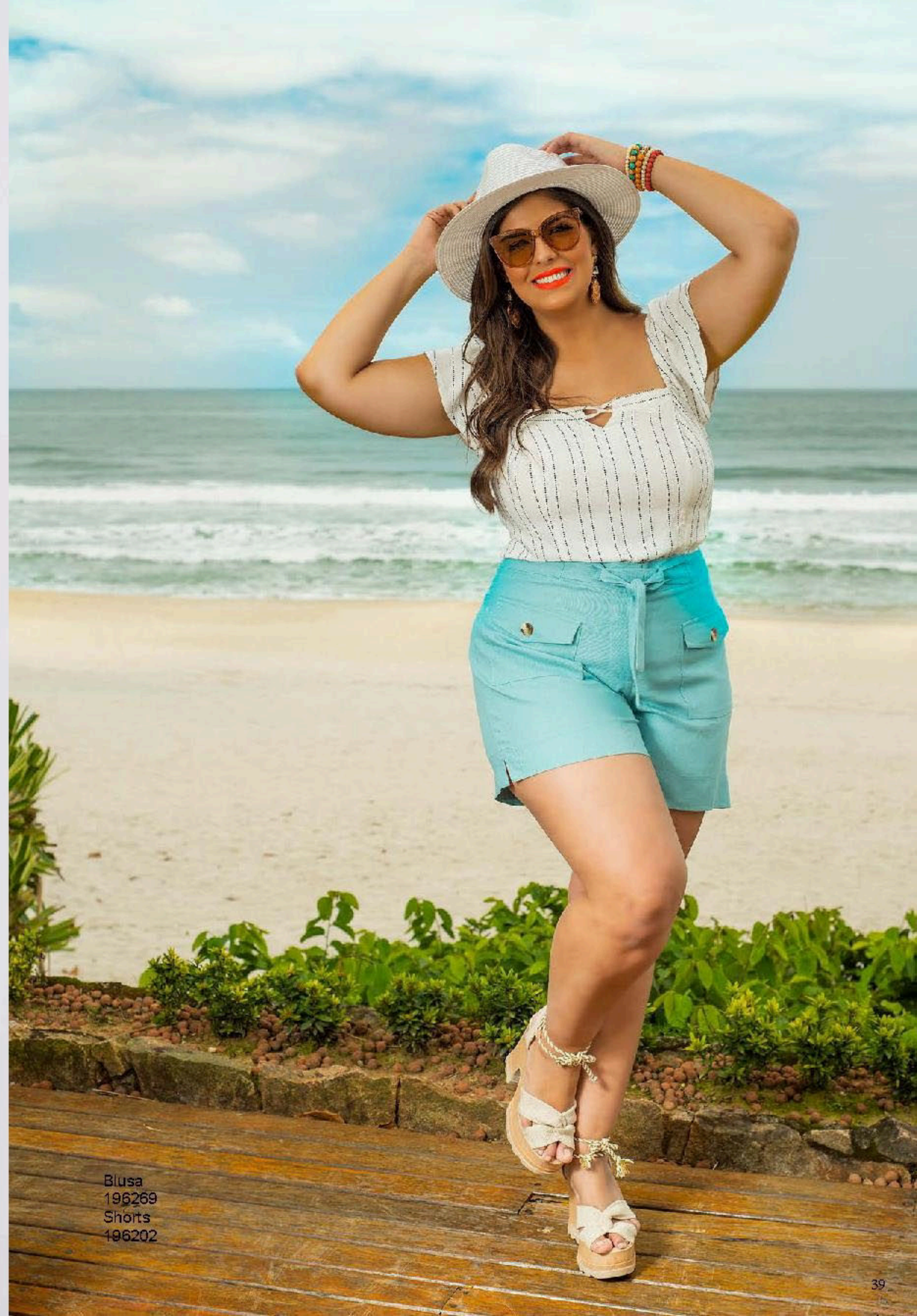
Blusa 196269 Shorts 196202