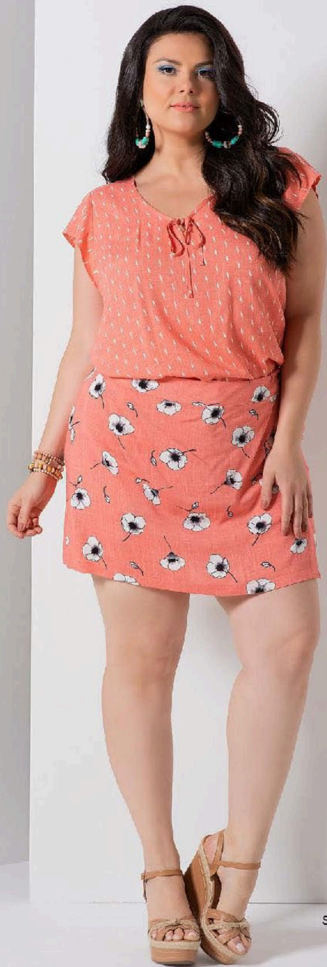
Blusa 196123 Shorts-saia 196124