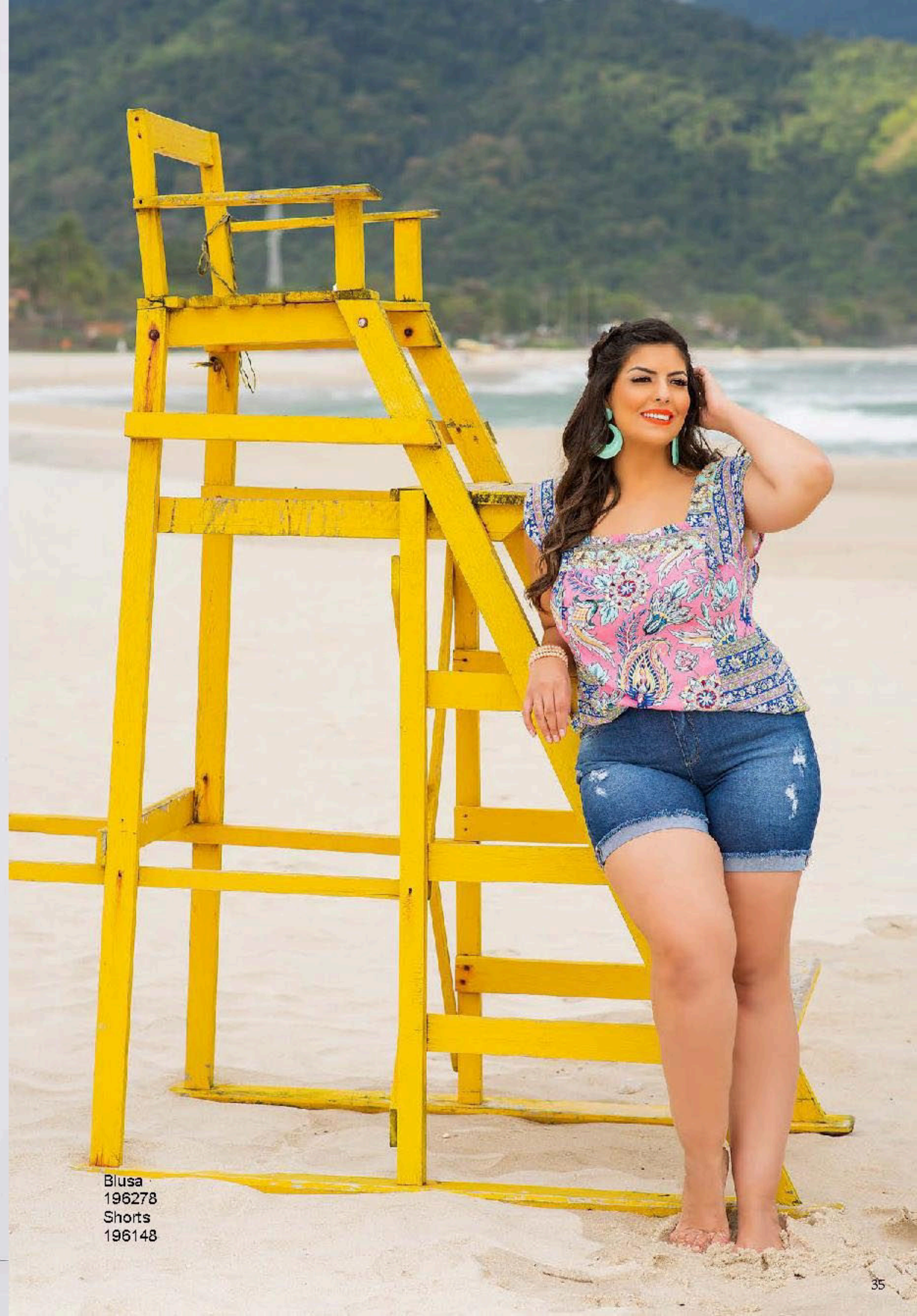
Blusa 196278 Shorts 196148