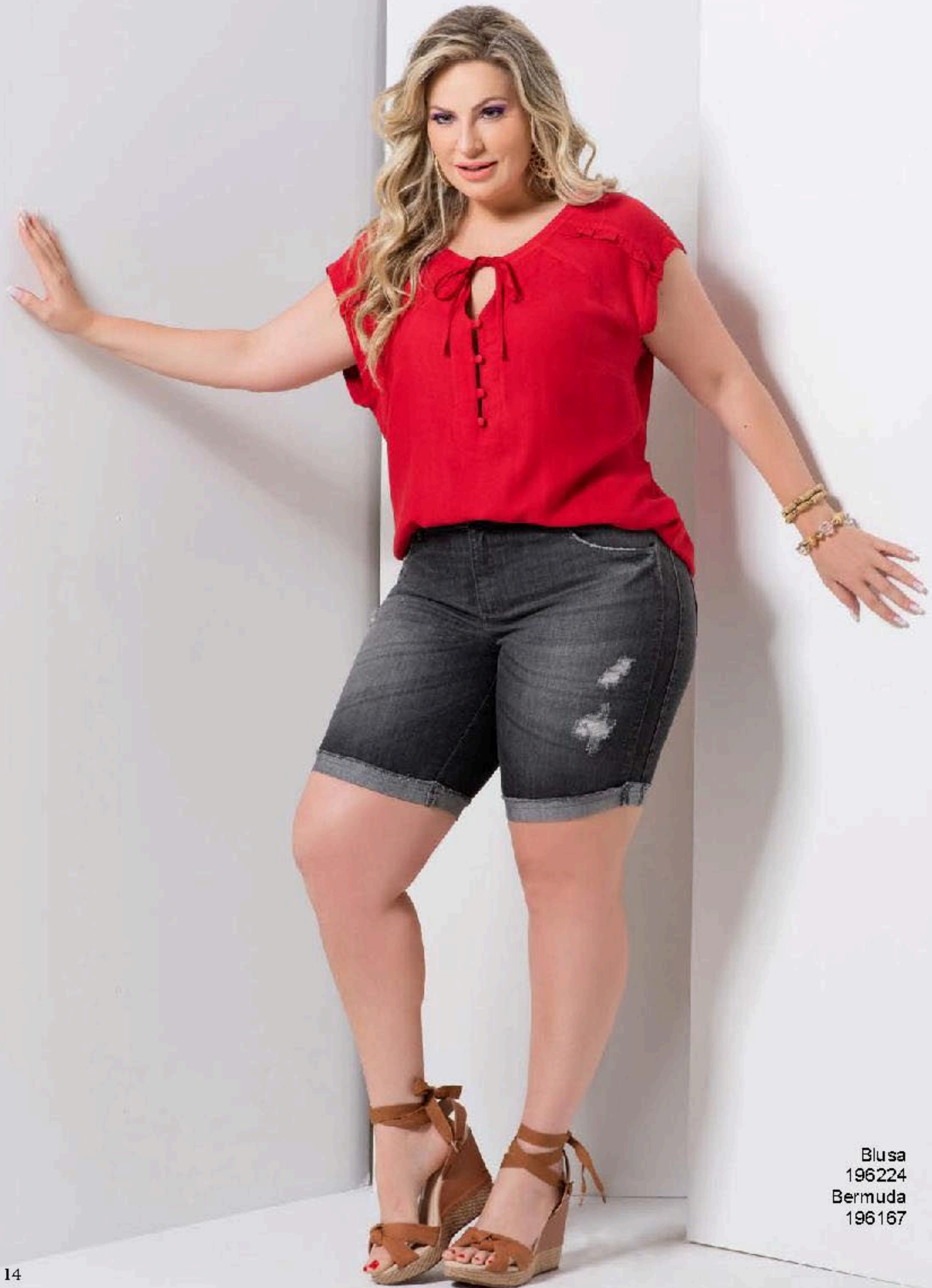
Blusa 196224 Bermuda 196167