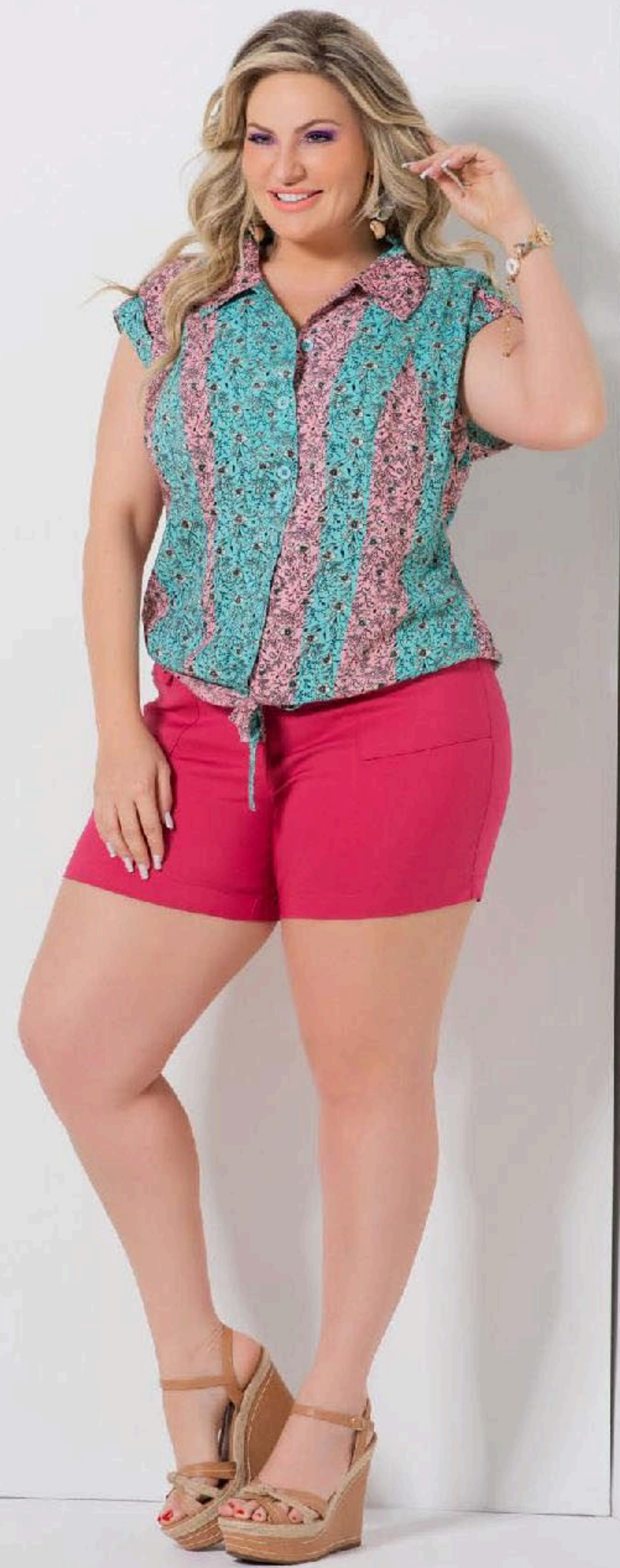
Camisa 196232 Shorts 196233