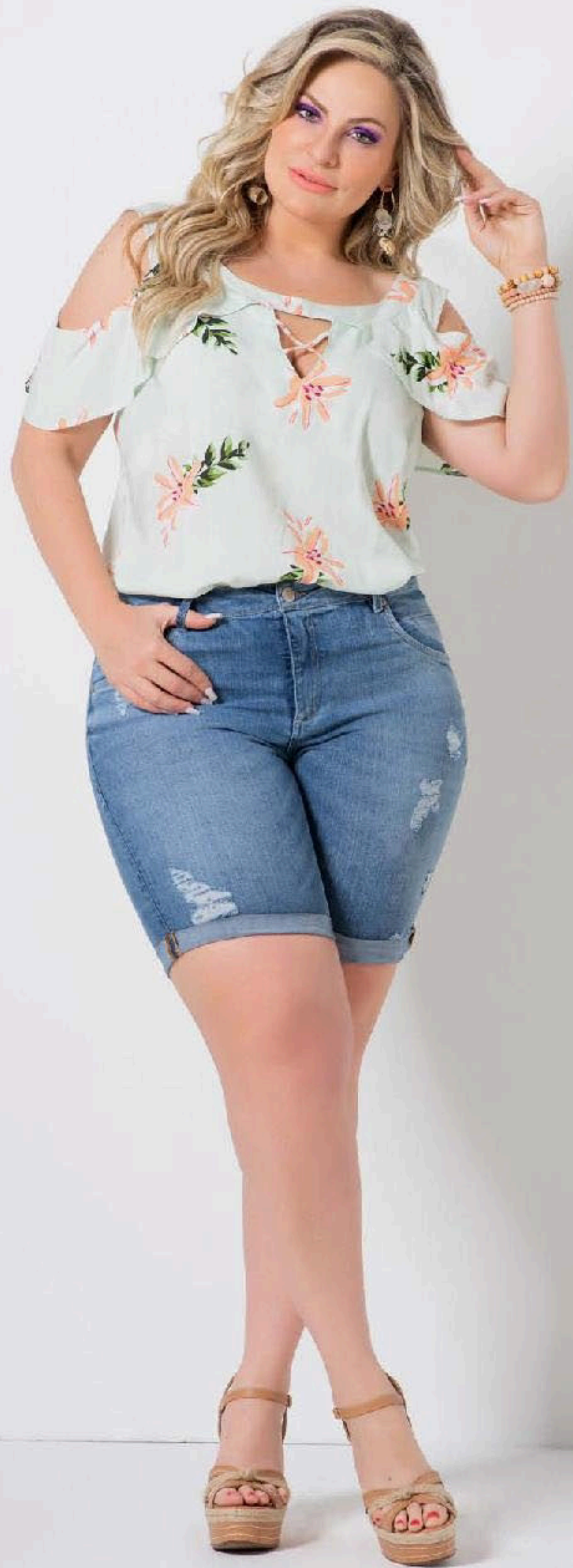
Blusa 196120 Bermuda 196175