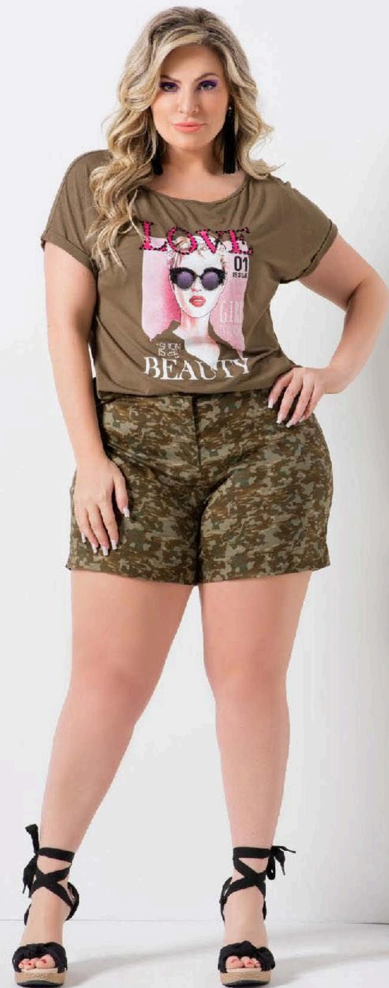
Blusa 191478 Shorts 196259