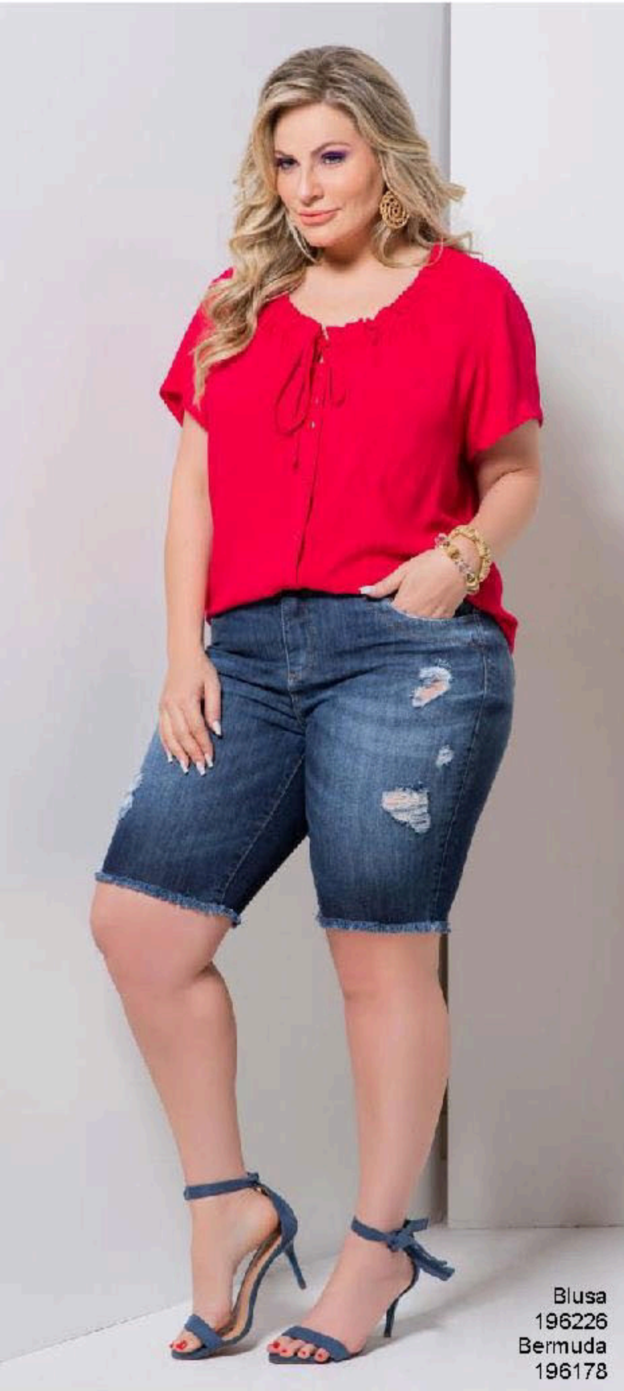
Blusa 196226 Bermuda 196178