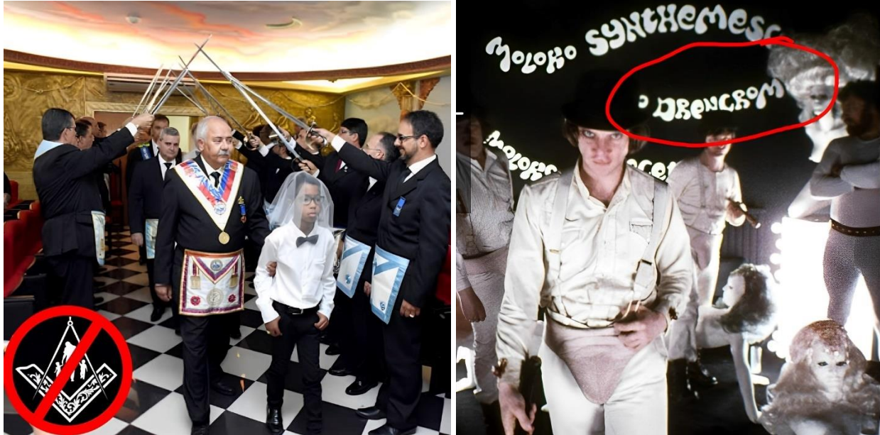
Left: Freemason escorting little boy in a veil. Right: From Stanley Kubrick's A Clockwork Orange (1971), a film about mind control and social engineering. Kubrick was a master coder; captured in this frame are the words "MOLOK" and "ADRENCHROME." Adrenochrome is a boutique drug derived from the blood of tortured children.

The Tavistock Institute represents a militant behavioral control research project begun in the 1950s and aimed at the eradication of independent thought, behavior, and religious sentiment among targeted populations. The Scottish Rite and Royal Arch Masons, the Central Intelligence Agency and numerous other high-profile centers and institutes of applied social psychology and cultural engineering have been involved in these Tavistock-led psychological warfare operations.