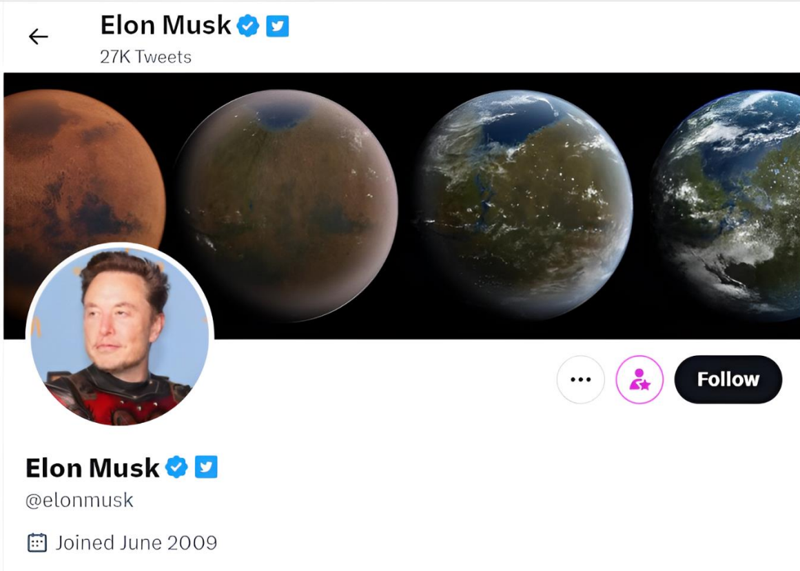
Screenshot of Elon Musk's Twitter profile (June 13, 2023). His profile photo has remained the same since he changed it to the above shortly after consummating his acquisition of Twitter on October 28, 2022.