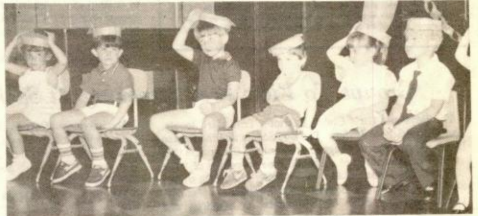
GRADUATES of the Little Patriots Nursery School prepare for their graduation ceremony.