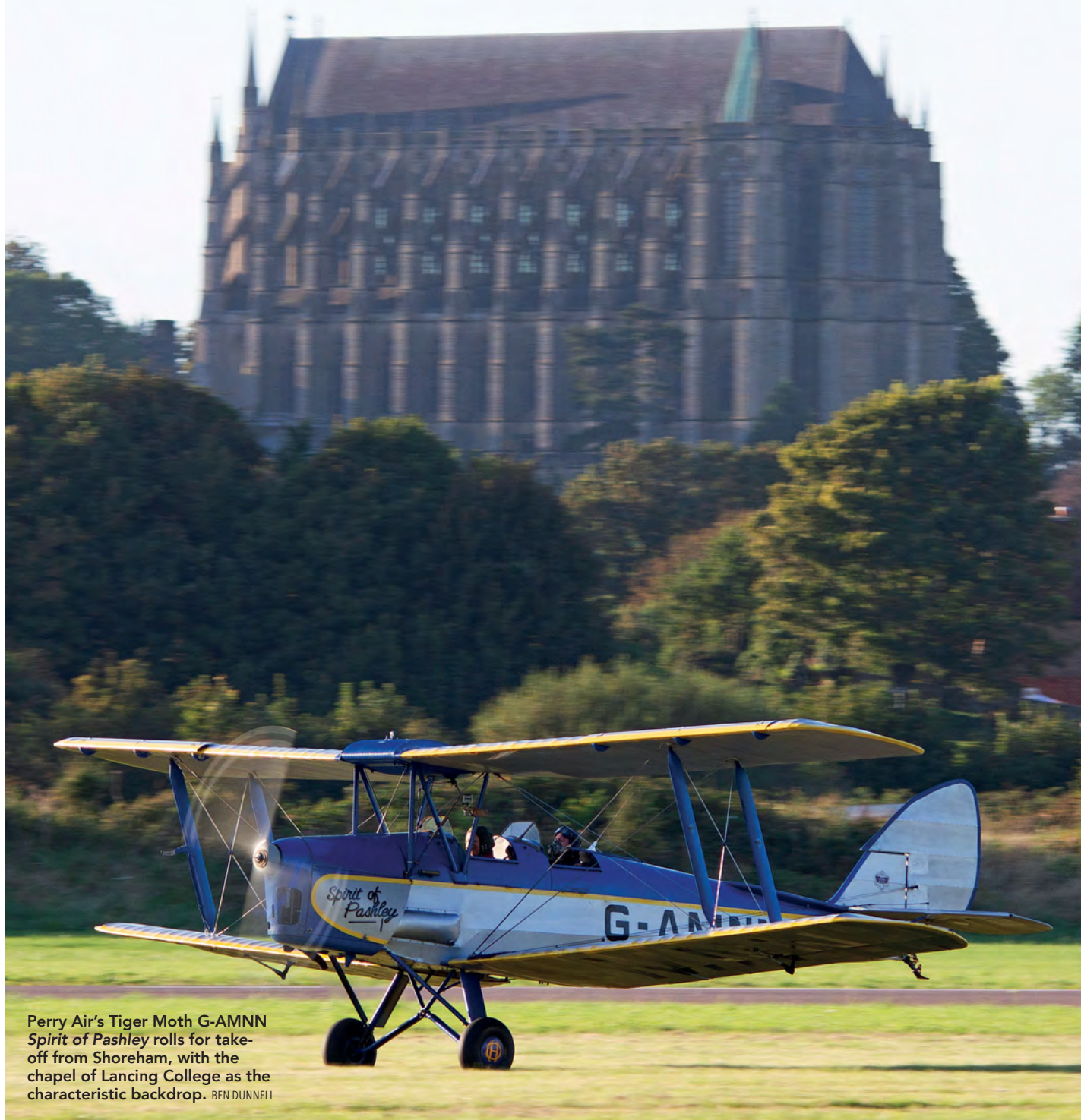
Perry Air's Tiger Moth G-AMNN Spirit of Pashley rolls for take-off from Shoreham, with the chapel of Lancing College as the characteristic backdrop.

Telephone 01273 463081, www.perryair.co.uk