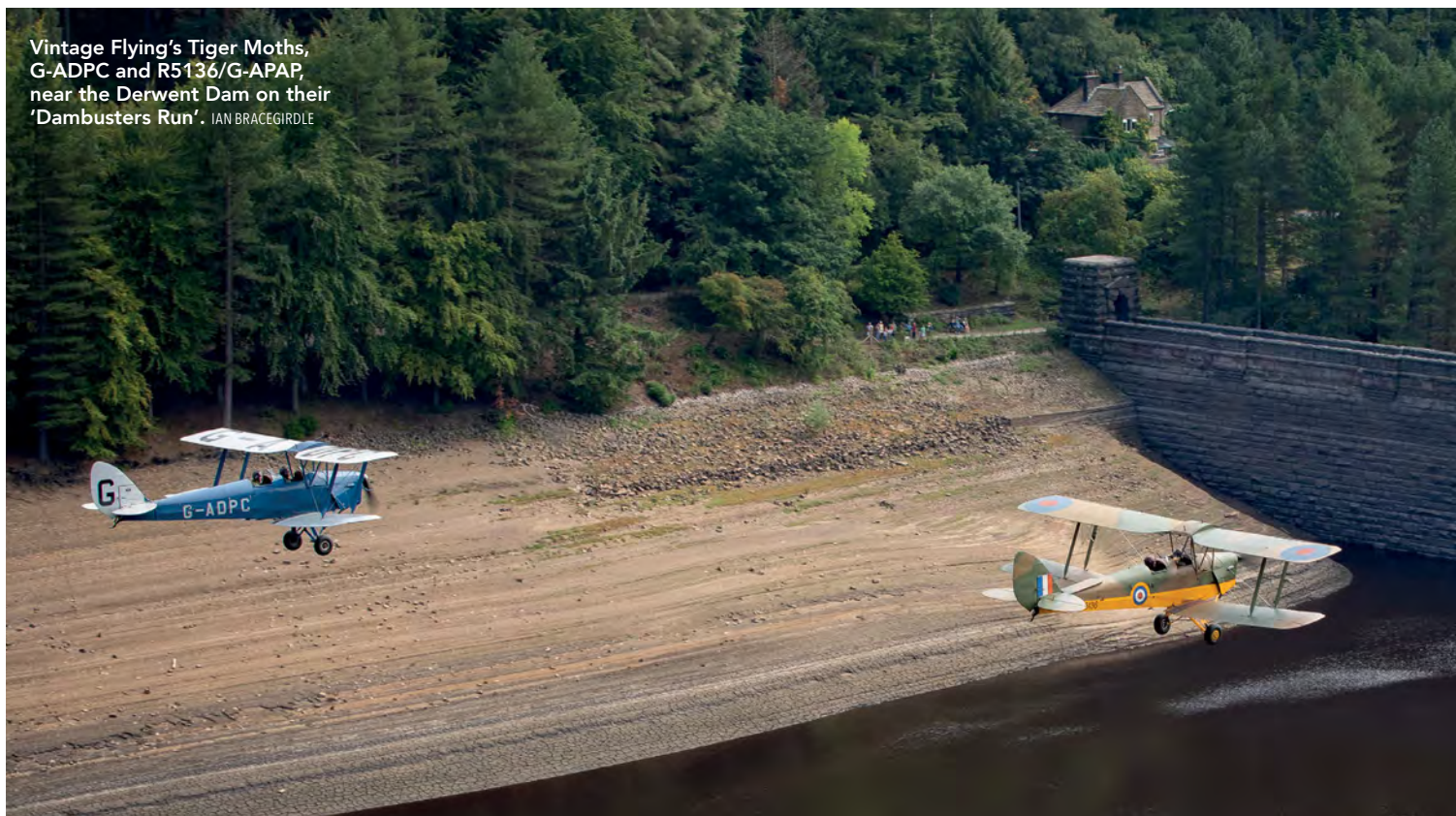
Vintage Flying's Tiger Moths, G-ADPC and R5136/G-APAP, near the Derwent Dam on their 'Dambusters Run'. IAN BRACEGIRDLE