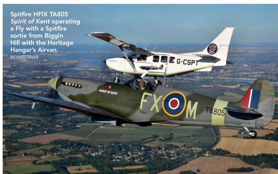
Spitfire HFIX TA805 Spirit of Kent operating a Fly with a Spitfire sortie from Biggin Hill with the Heritage Hangar's Airvan.

Telephone 01959 576767, flyaspitfire.com