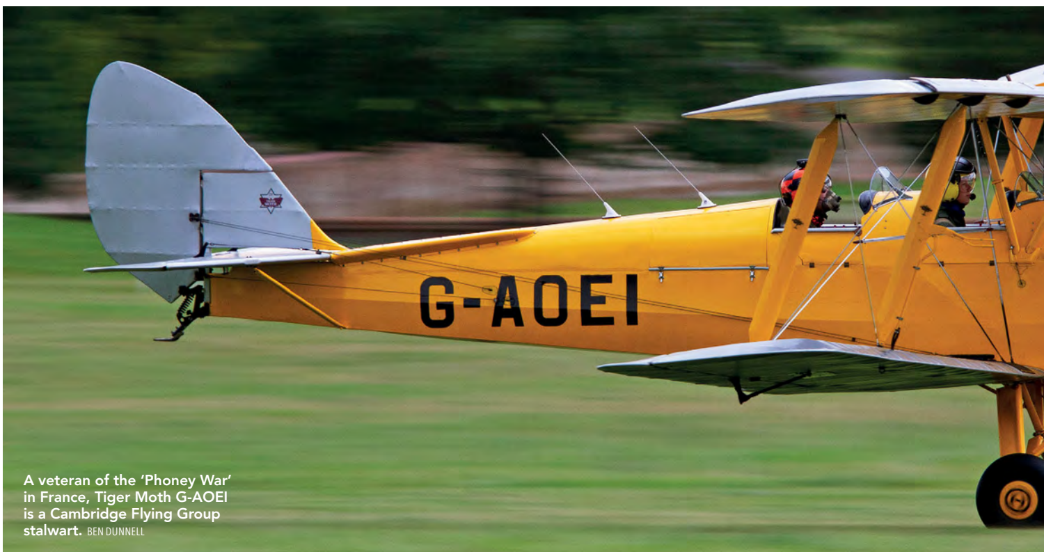
A veteran of the 'Phoney War' in France, Tiger Moth G-AOEI is a Cambridge Flying Group stalwart.