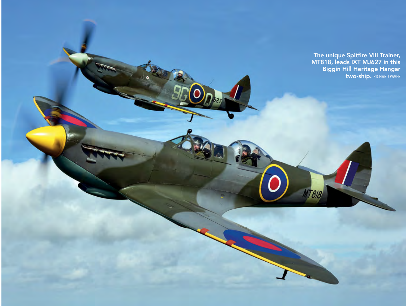
The unique Spitfire VIII Trainer, MT818, leads IXT MJ627 in this Biggin Hill Heritage Hangar two-ship.