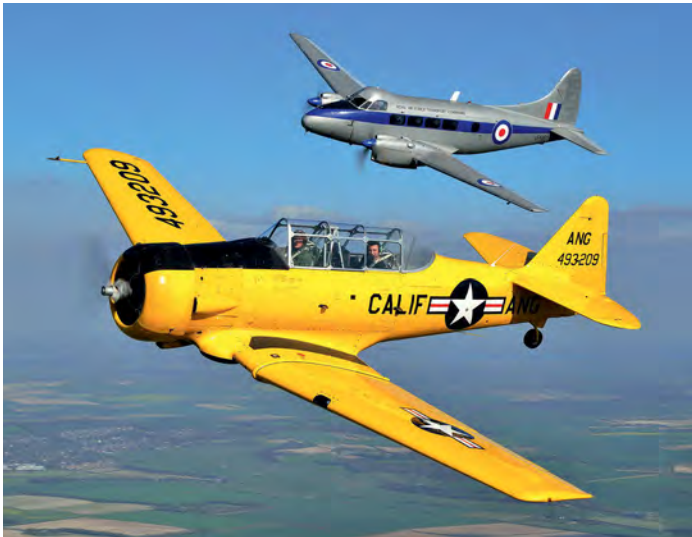
Classics from the Aero Legends fleet in formation: T-6G Texan G-DDMV and Devon C2 VP981/G-DHDV. RICHARD PAVER