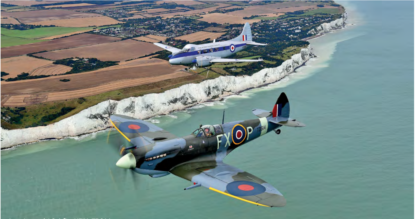
Aero Legends' Spitfire HFIX, TD314, on a flight near the white cliffs of Dover with Devon VP981. RICHARD PAVER