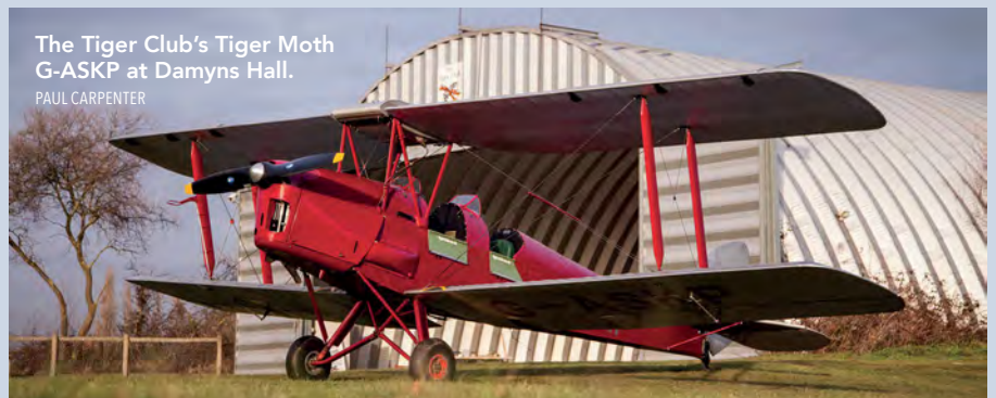
The Tiger Club's Tiger Moth G-ASKP at Damyns Hall.

"Half-hour trips generally take in the Battle of Britain Memorial at Capel-le-Ferne, while hour-long flights allow the chance to overfly more of Kent"