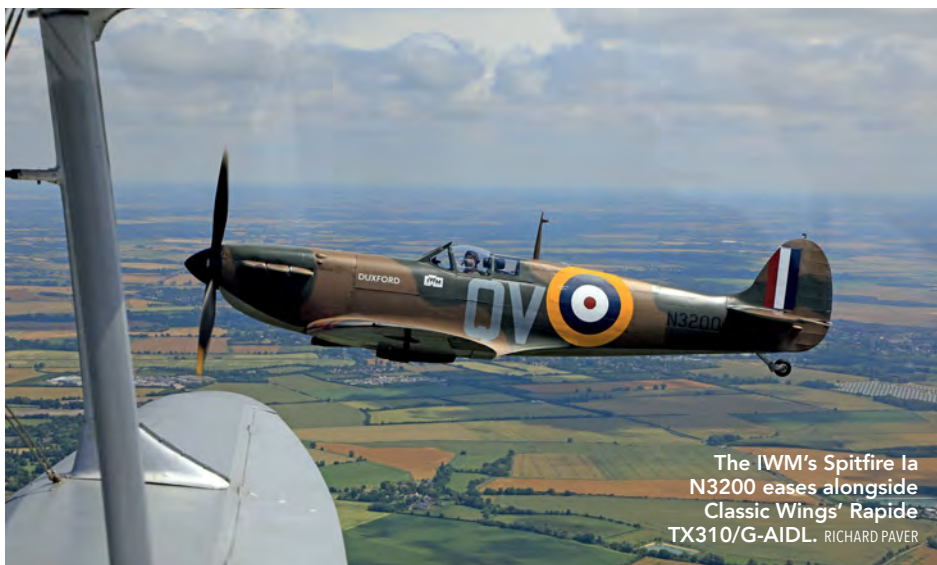
The IWM's Spitfire Ia N3200 eases alongside Classic Wings' Rapide TX310/G-AIDL. RICHARD PAVER