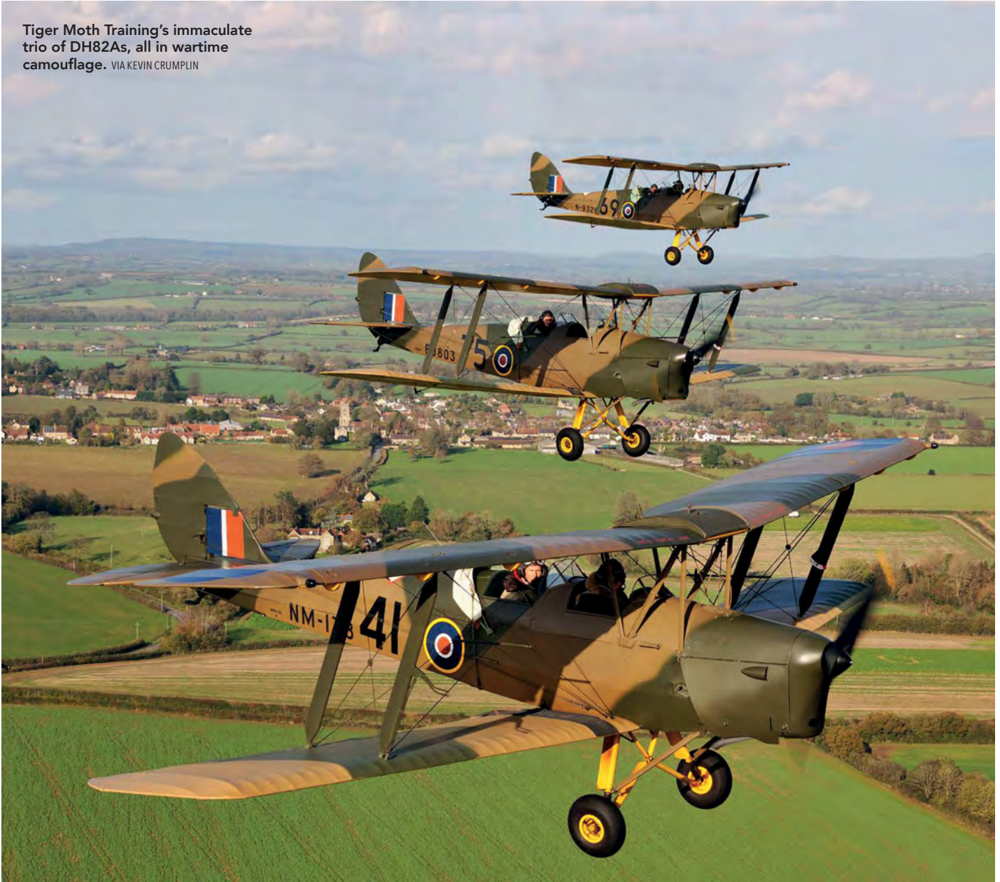
Tiger Moth Training's immaculate trio of DH82As, all in wartime camouflage.