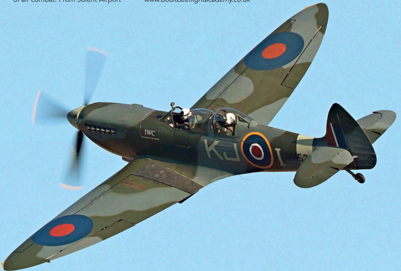
Spitfire IXT SM520 of the Boulton Flight Academy.

Telephone 01243 531147, www.boultonflightacademy.co.uk