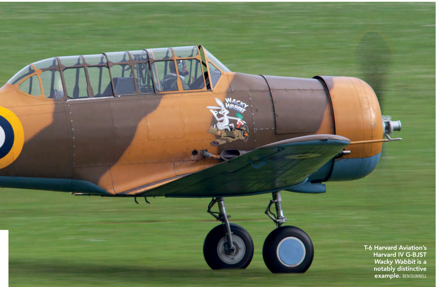
T-6 Harvard Aviation's Harvard IV G-BJST Wacky Wabbit is a notably distinctive example. BEN DUNNELL