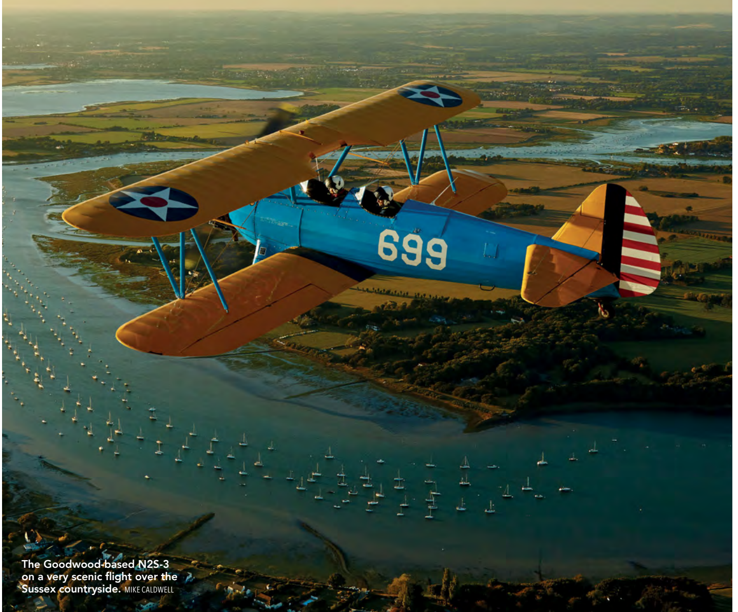
The Goodwood-based N2S-3 on a very scenic flight over the Sussex countryside. MIKE CALDWELL

PRICES, BOOKING AND INFORMATION: Telephone 01243 755066, www.goodwood.com