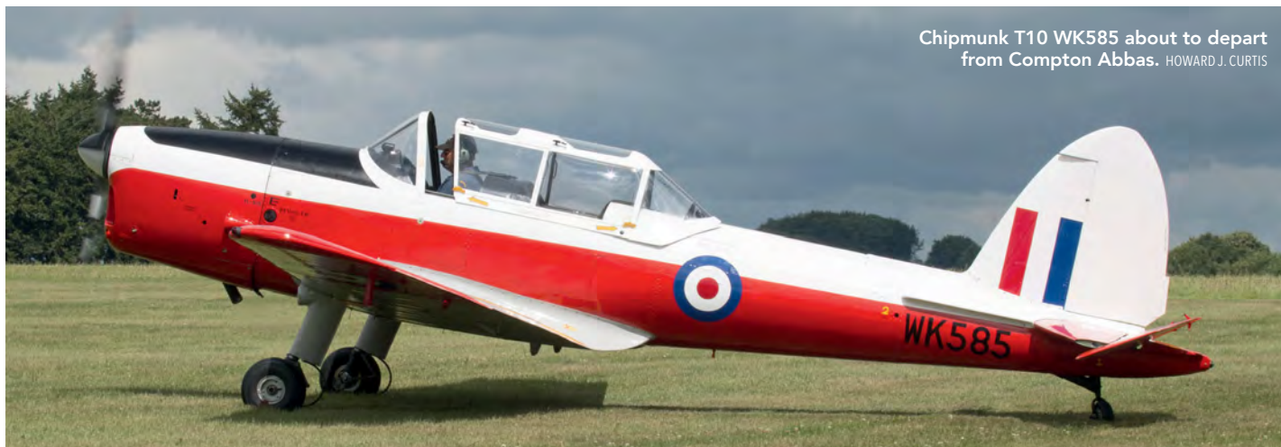
Chipmunk T10 WK585 about to depart from Compton Abbas.

PRICES, BOOKING AND INFORMATION: Telephone 01747 811767, www.comptonabbasairfield.co.uk