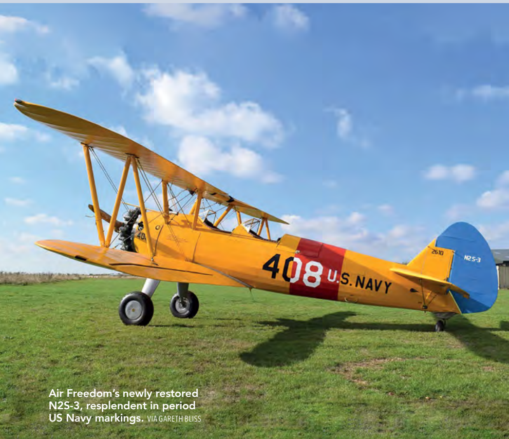
Air Freedom's newly restored N2S-3, resplendent in period US Navy markings.

PRICES, BOOKING AND INFORMATION: Telephone 01622 812830, www.aerolegends.co.uk