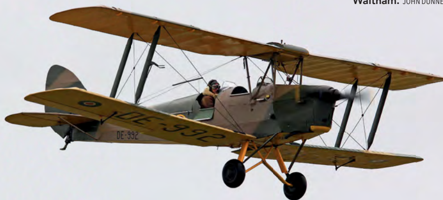
Tiger Moth DE992/G-AXXV operates flights from White Waltham. JOHN DUNNELL