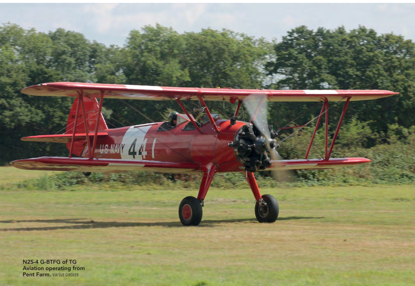
N2S-4 G-BTFG of TG Aviation operating from Pent Farm.