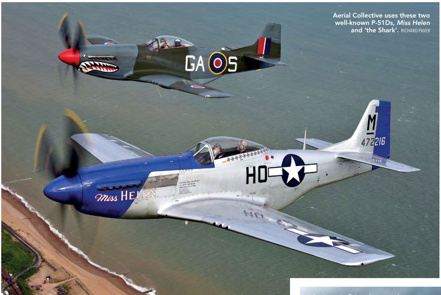
Aerial Collective uses these two well-known P-51Ds, Miss Helen and 'the Shark'.

NOTE: This information has been compiled from a variety of sources. Aeroplane accepts no responsibility for any errors that thus arise. Readers are advised to contact or otherwise check with operators for the latest details.