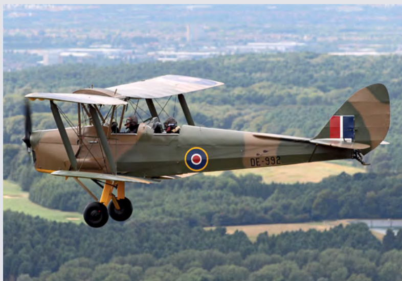
DE992 is a regular airshow participant with the Tiger Nine display team.

PRICES, BOOKING AND INFORMATION: Telephone 01628 823272, www.wlac.co.uk