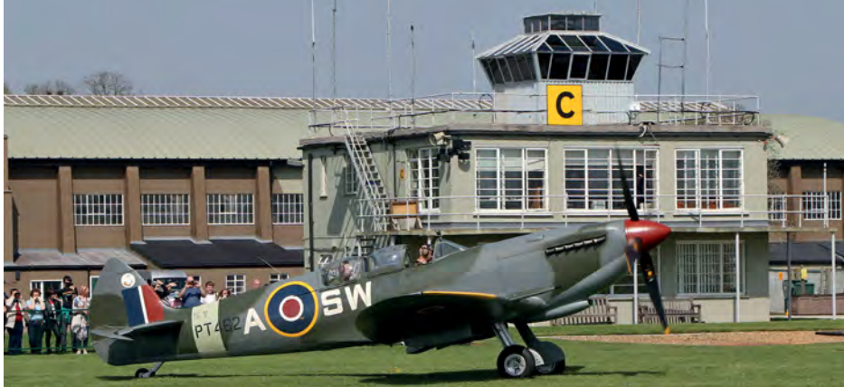
ABOVE: Spitfire IX PT462 about to operate a Classic Wings flight.