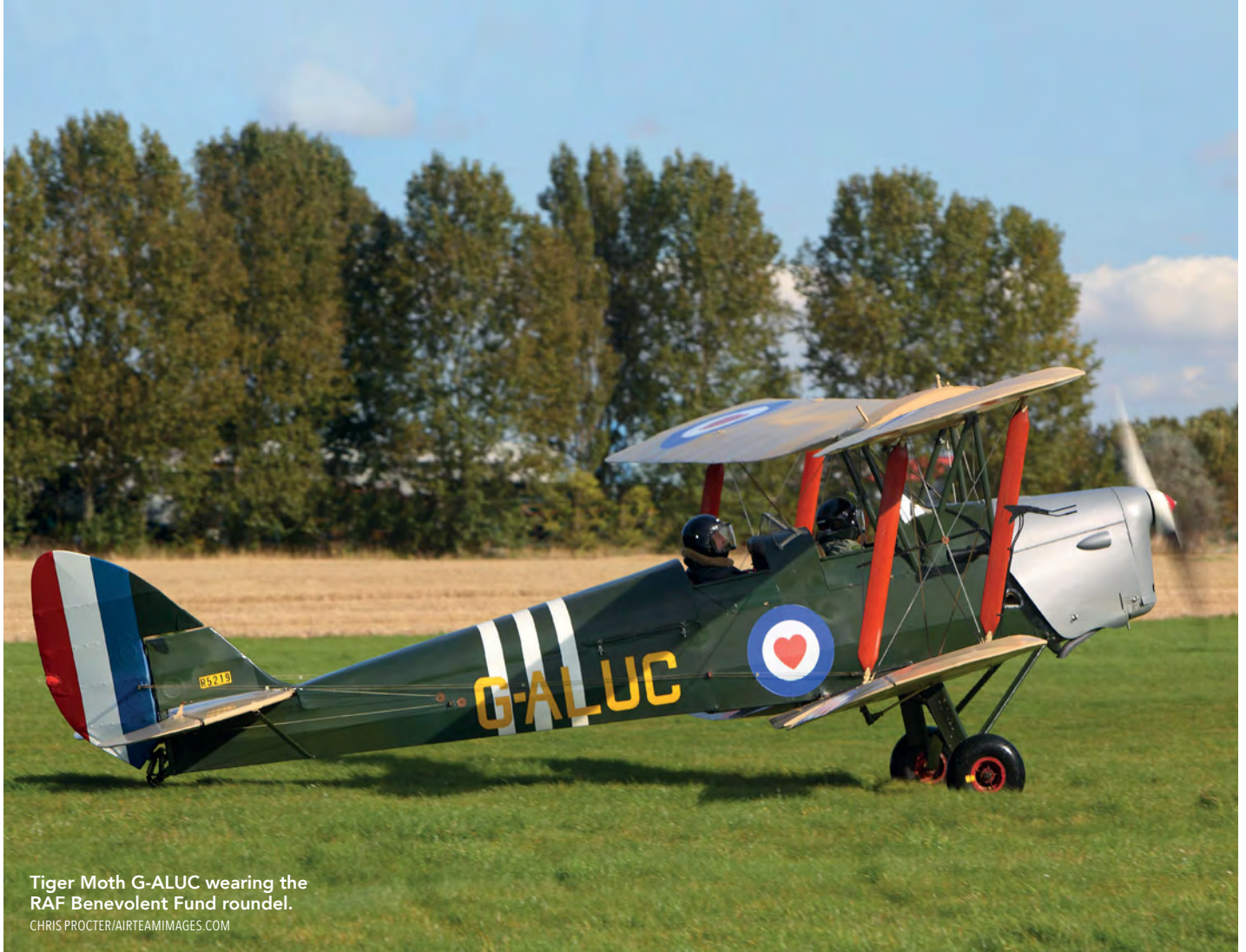
Tiger Moth G-ALUC wearing the RAF Benevolent Fund roundel.