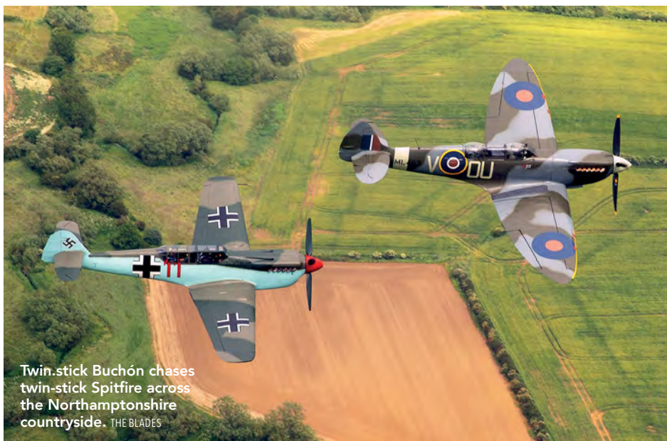
Twin-stick Buchón chases twin-stick Spitfire across the Northamptonshire countryside. THE BLADES