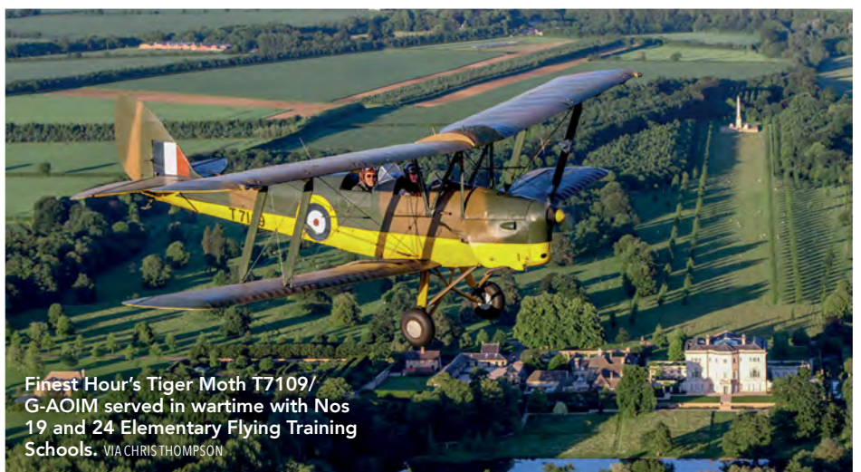
Finest Hour's Tiger Moth T7109/ G-AOIM served in wartime with Nos 19 and 24 Elementary Flying Training Schools.

PRICES, BOOKING AND INFORMATION: Telephone 07415 735683, www.finesthourexperiences.co.uk