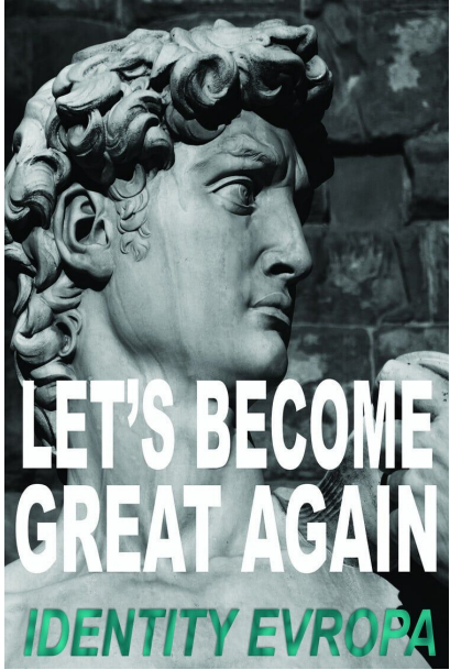
Figure 2 Identity Evropa Recruitment Poster