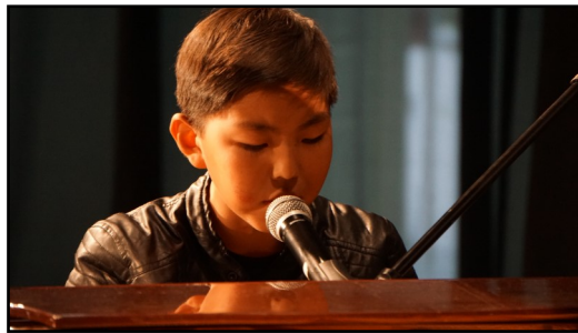
(ASU's Got Talent, from p. 1)