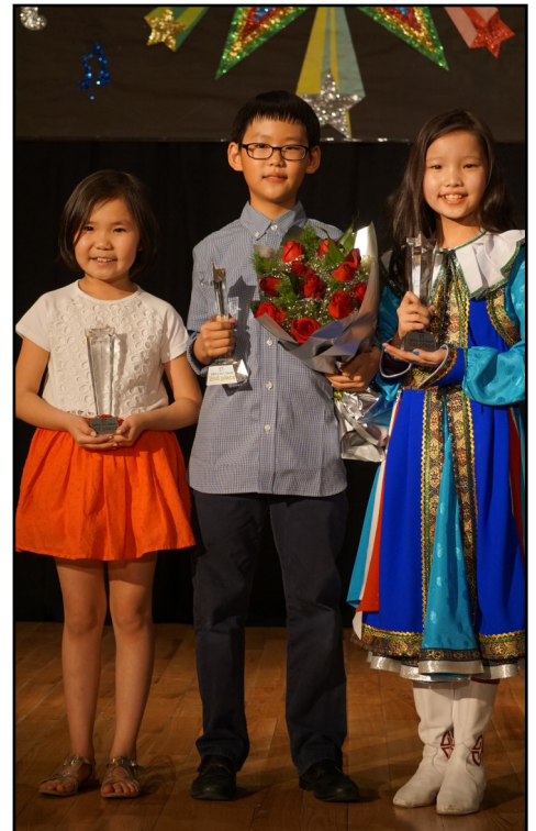
The top three finishers at the annual talent show stand proudly with their awards.