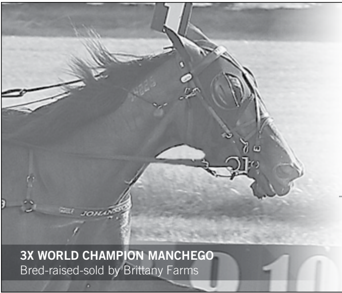
3X WORLD CHAMPION MANCHEGO Bred-raised-sold by Brittany Farms