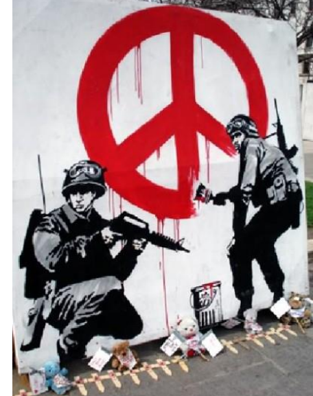
NATO double speech

Our goal is forward, towards a Socialist European Union!