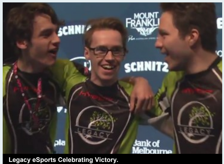
Legacy eSports Celebrating Victory.

Abyss eSports Club VS Legacy eSports - PAX ESL 5K LAN Grand Final VOD