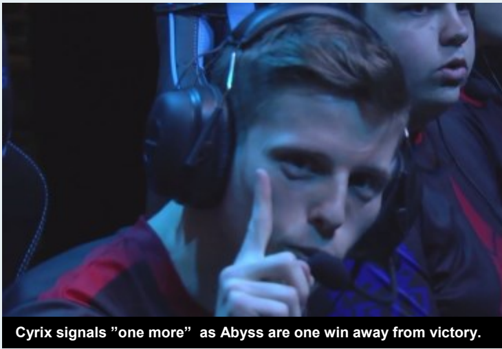
Cyrix signals "one more" as Abyss are one win away from victory.

They quickly settled the game and won convincingly, putting them on an absolute tear of a streak to be back into the Grand Final versus Abyss.