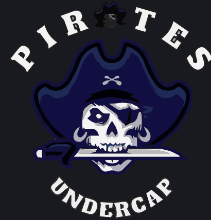
Pirates Undercap Calls