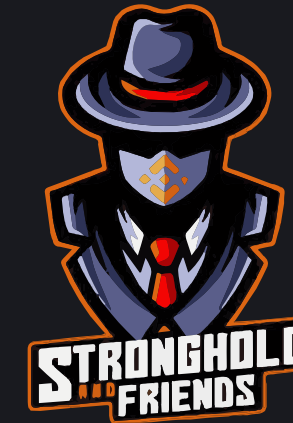
Stronghold And Friends