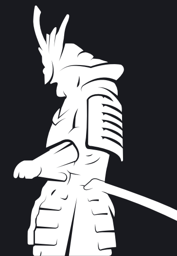
Crypto Clans Kamikaze